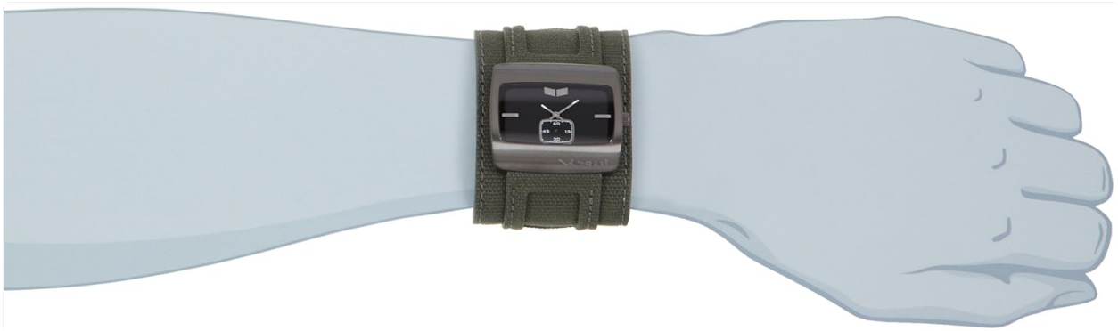
Figure 2: Close-up view of the Vestal SN034 Saint watch dial. This image highlights the minimalist design and the 60-second subdial.

The watch displays time using traditional hour and minute hands on an analog dial. The 60-second subdial, located at the 6 o'clock position, indicates the current second.