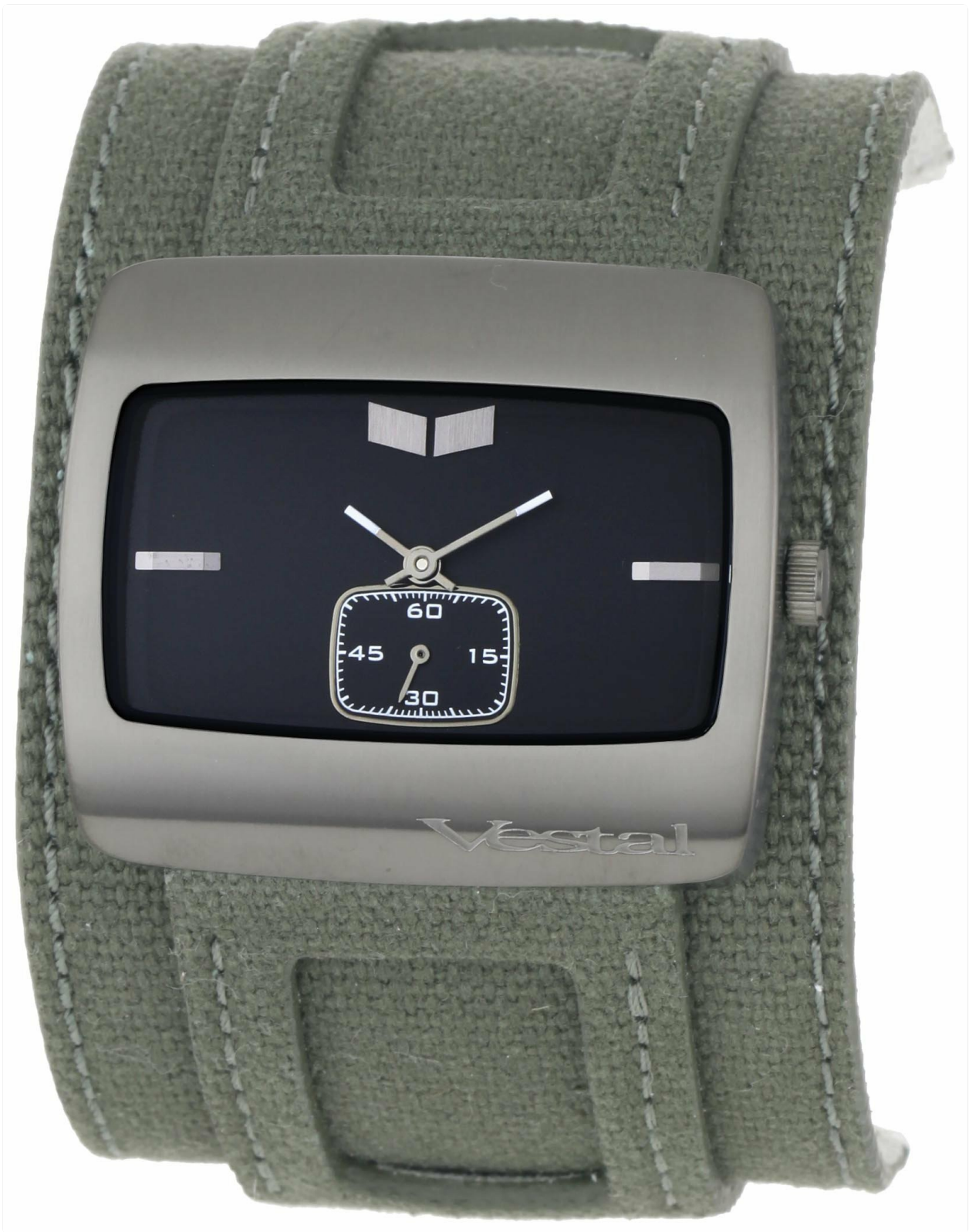
Figure 1: Vestal SN034 Saint watch worn on a wrist. This image illustrates the watch's appearance and fit.