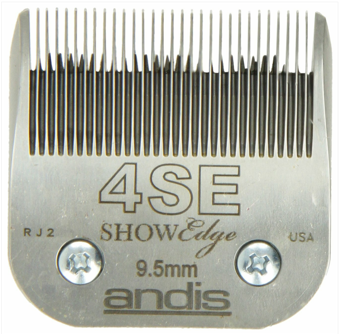
Figure 1: Andis Pet No.4SE Blade Set. This image displays the complete blade set, highlighting its design and finish.