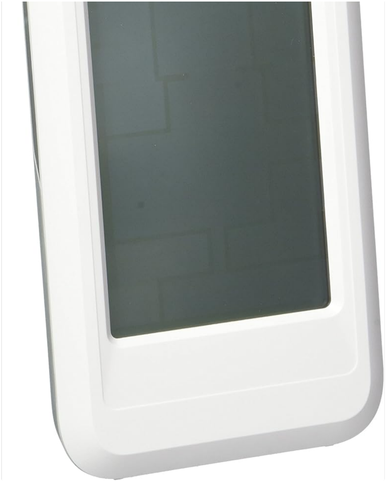
Figure 1: Front view of the Honeywell REM5000R1001 Portable Comfort Control, showing its large digital display and sleek white casing.