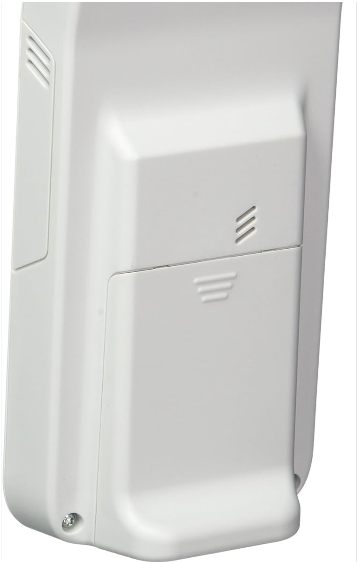
Figure 2: Side and back view of the control unit, highlighting the battery compartment and overall ergonomic design.