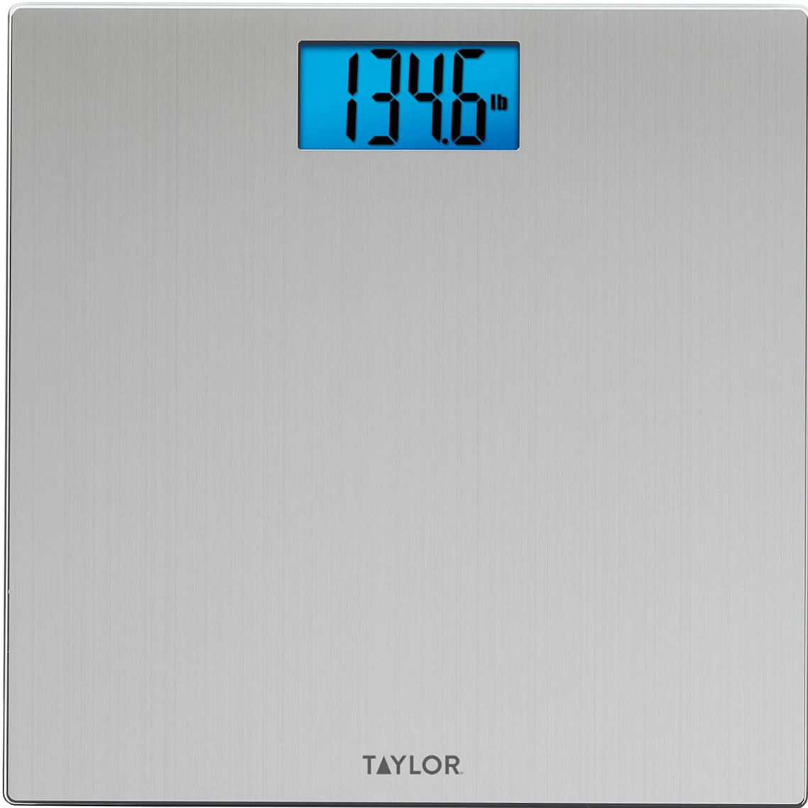
Image: The Taylor Model 7407 Digital Body Weight Scale with a brushed stainless steel platform and a blue backlit LCD displaying '134.6 lb'.