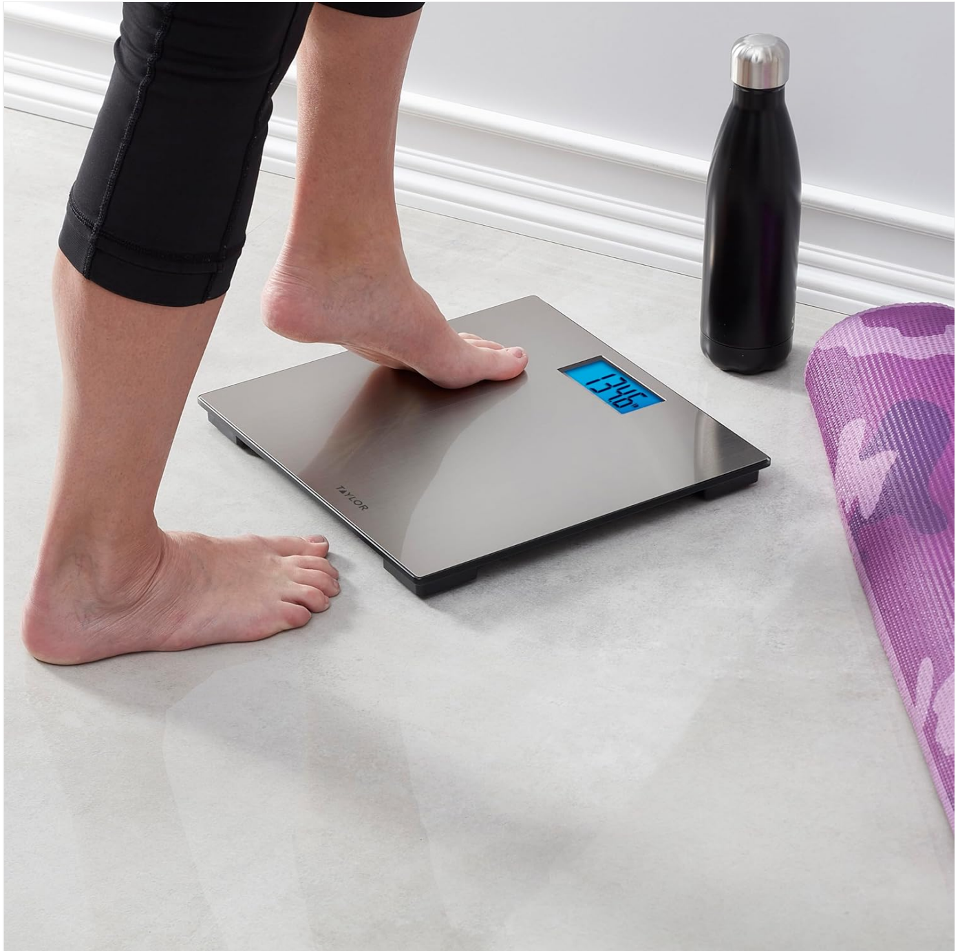
Image: A user stepping onto the digital scale to take a weight measurement.