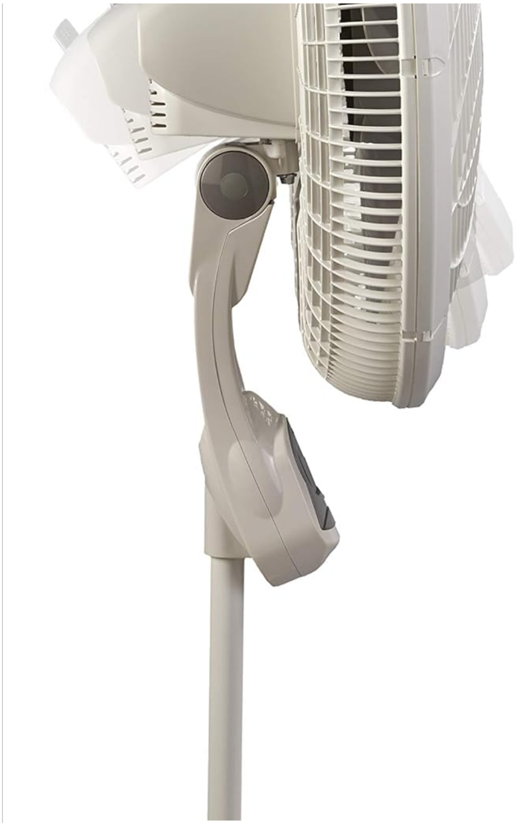
Image: The fan head shown tilted at various angles, demonstrating its adjustable tilt feature.