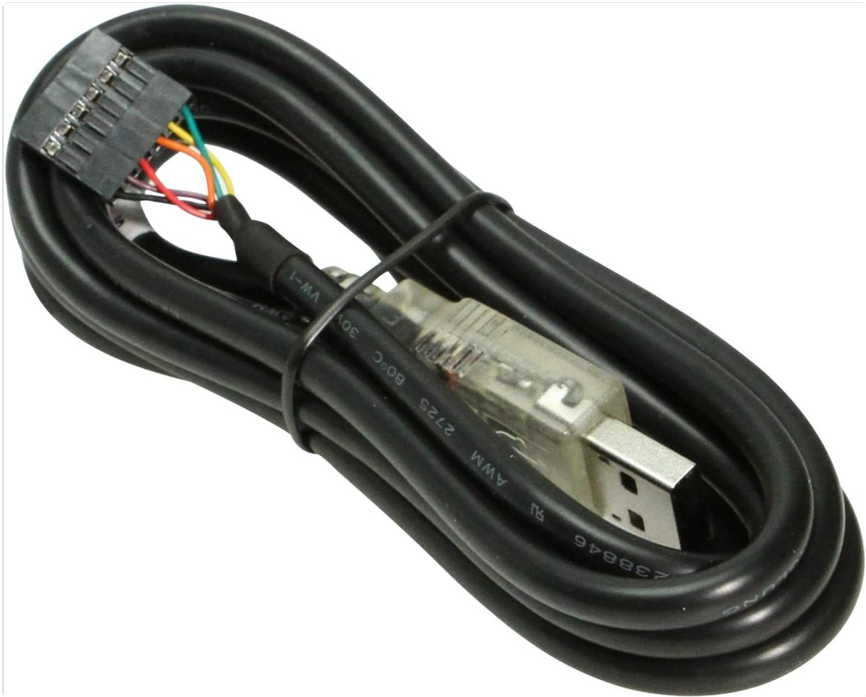
Image 5.1: The Gearmo USB to TTL Serial Adapter Cable coiled, demonstrating its durable design suitable for various environments.