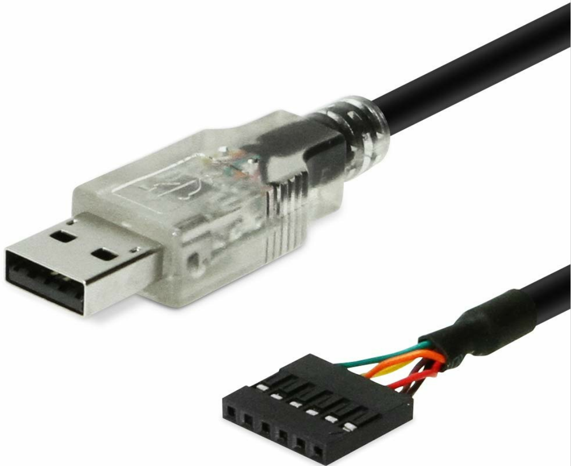
Image 1.1: The Gearmo USB to TTL Serial Adapter Cable, featuring the USB-A connector with a transparent housing that allows visibility of the internal FTDI chip and activity LEDs.