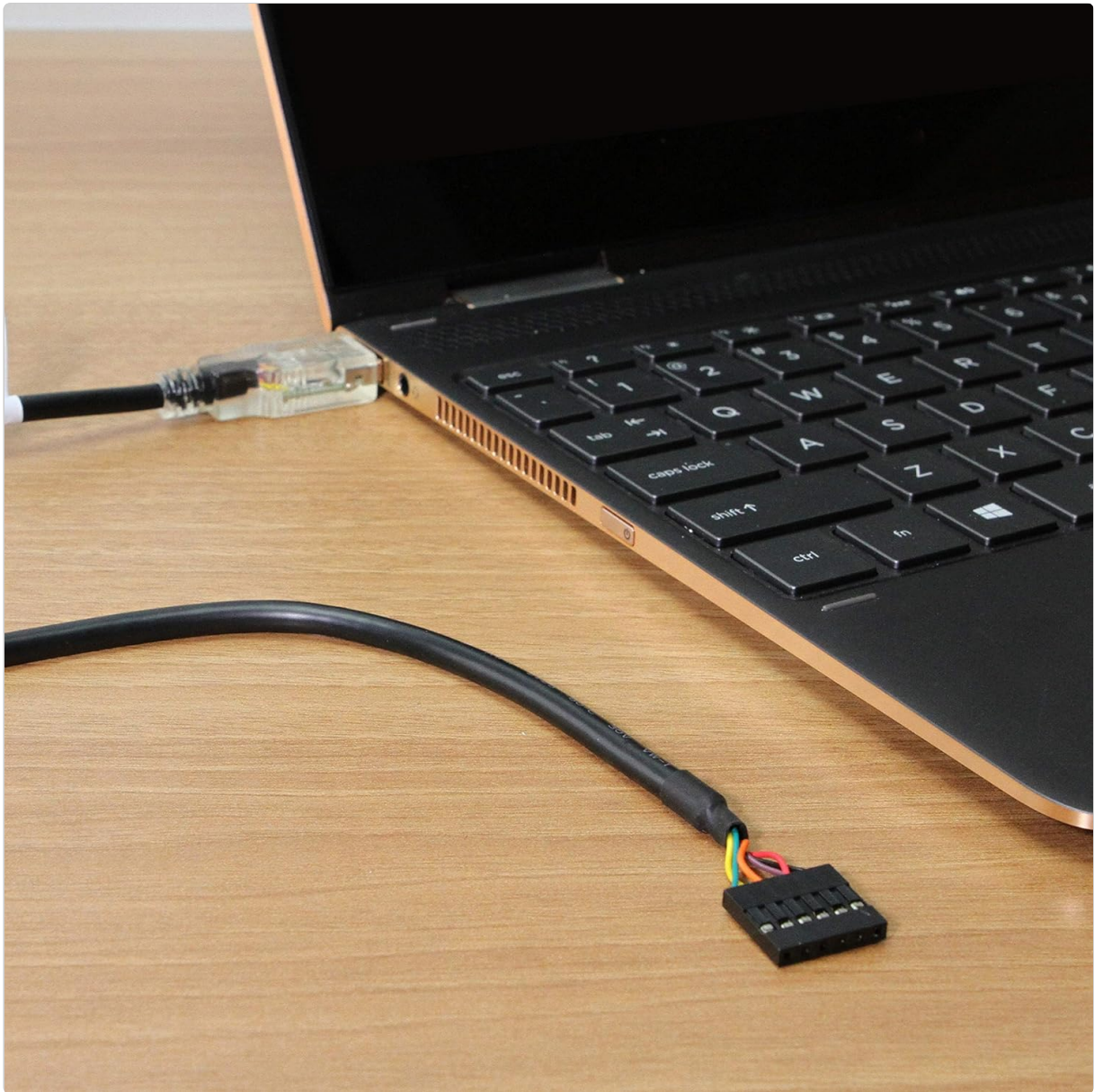
Image 3.1: The Gearmo USB to TTL Serial Adapter Cable connected to a laptop, illustrating the USB-A end plugged into the computer and the 6-pin header ready for connection to a target device.

Your browser does not support the video tag.