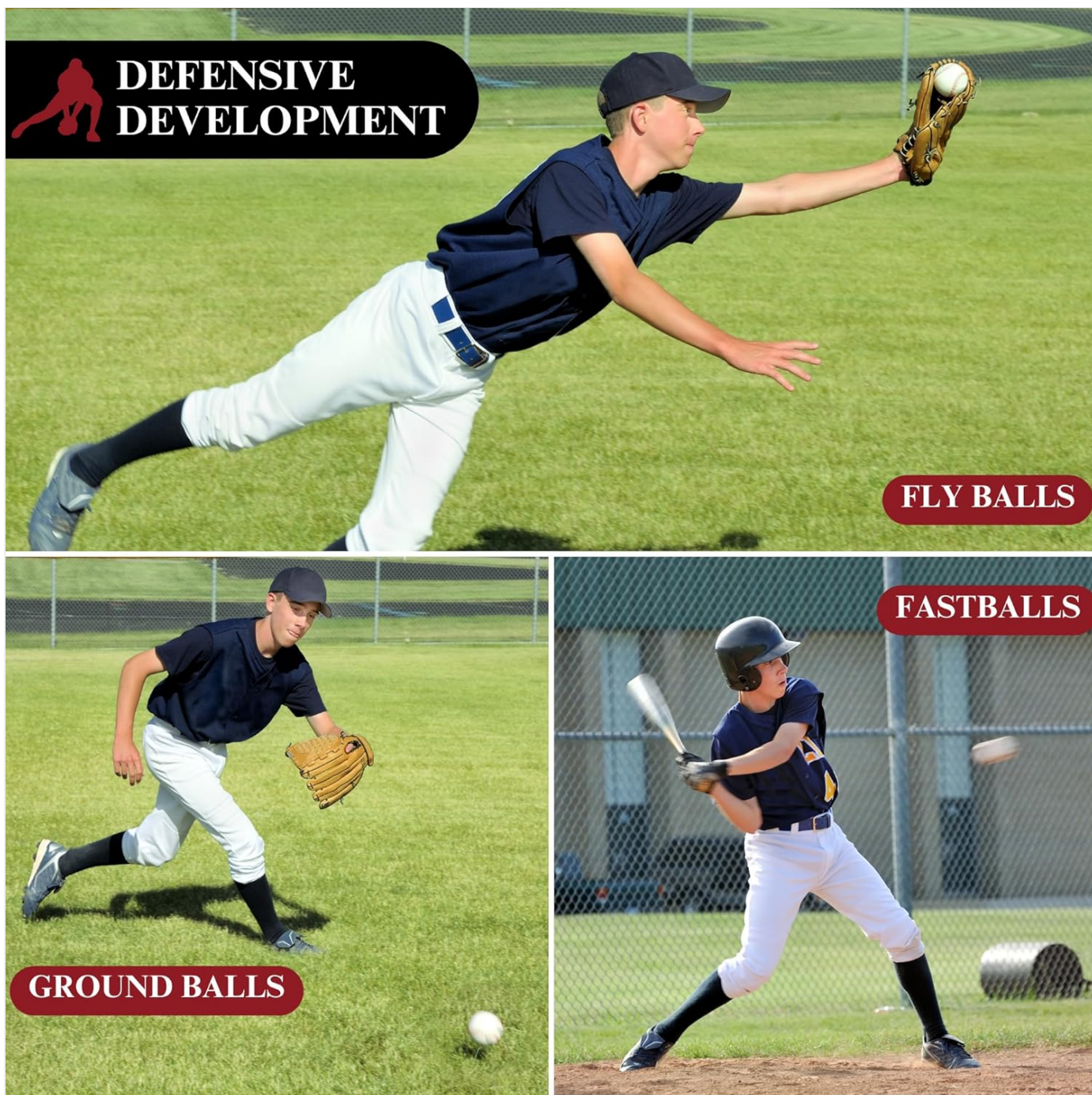
Image 5.3: Examples of defensive drills possible with the Heater PA99, including fly balls, ground balls, and fastballs.