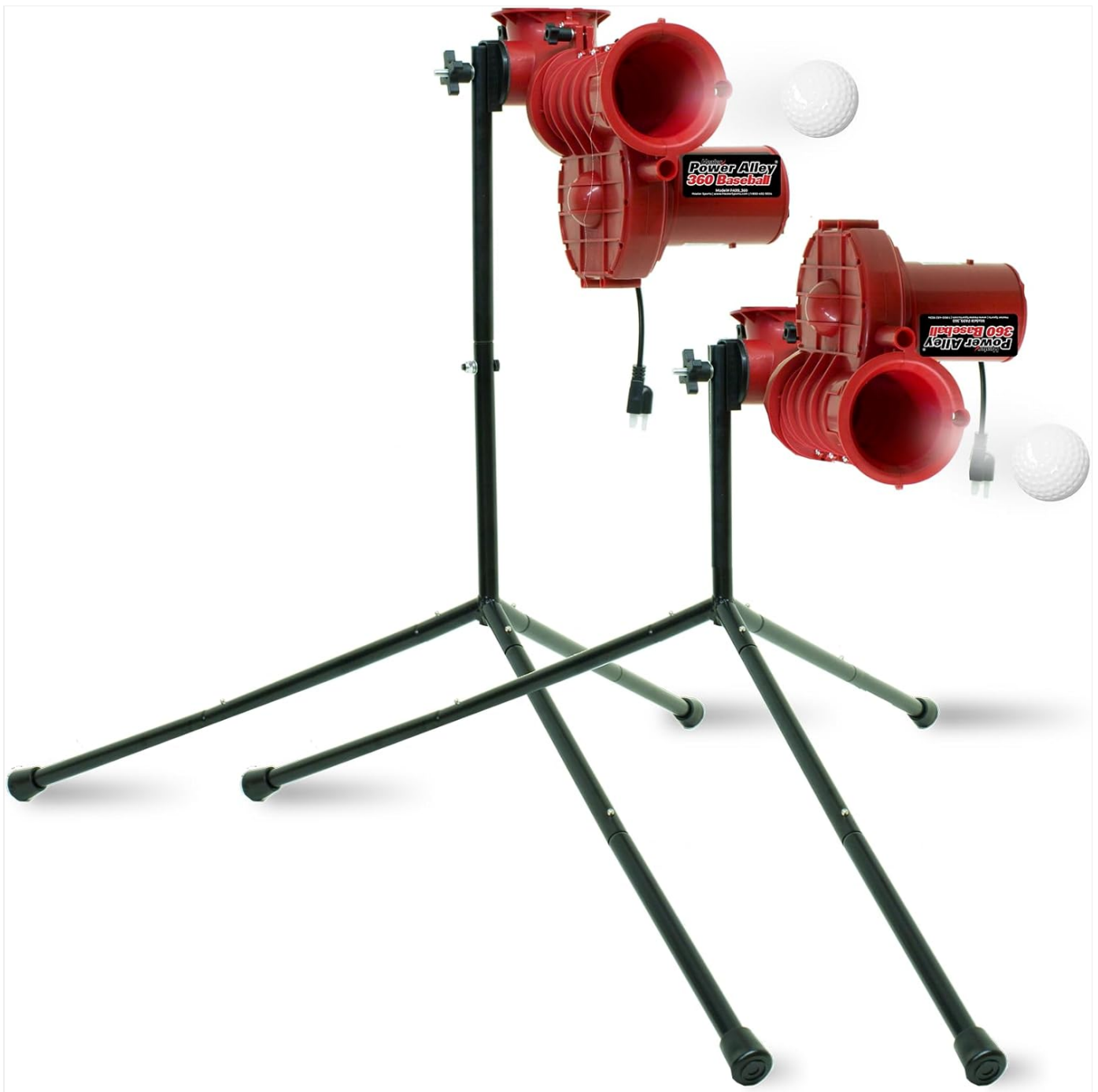
Image 1.1: The Heater PA99 Power Alley Lite Baseball Pitching Machine, demonstrating its pitching capability with two units shown.