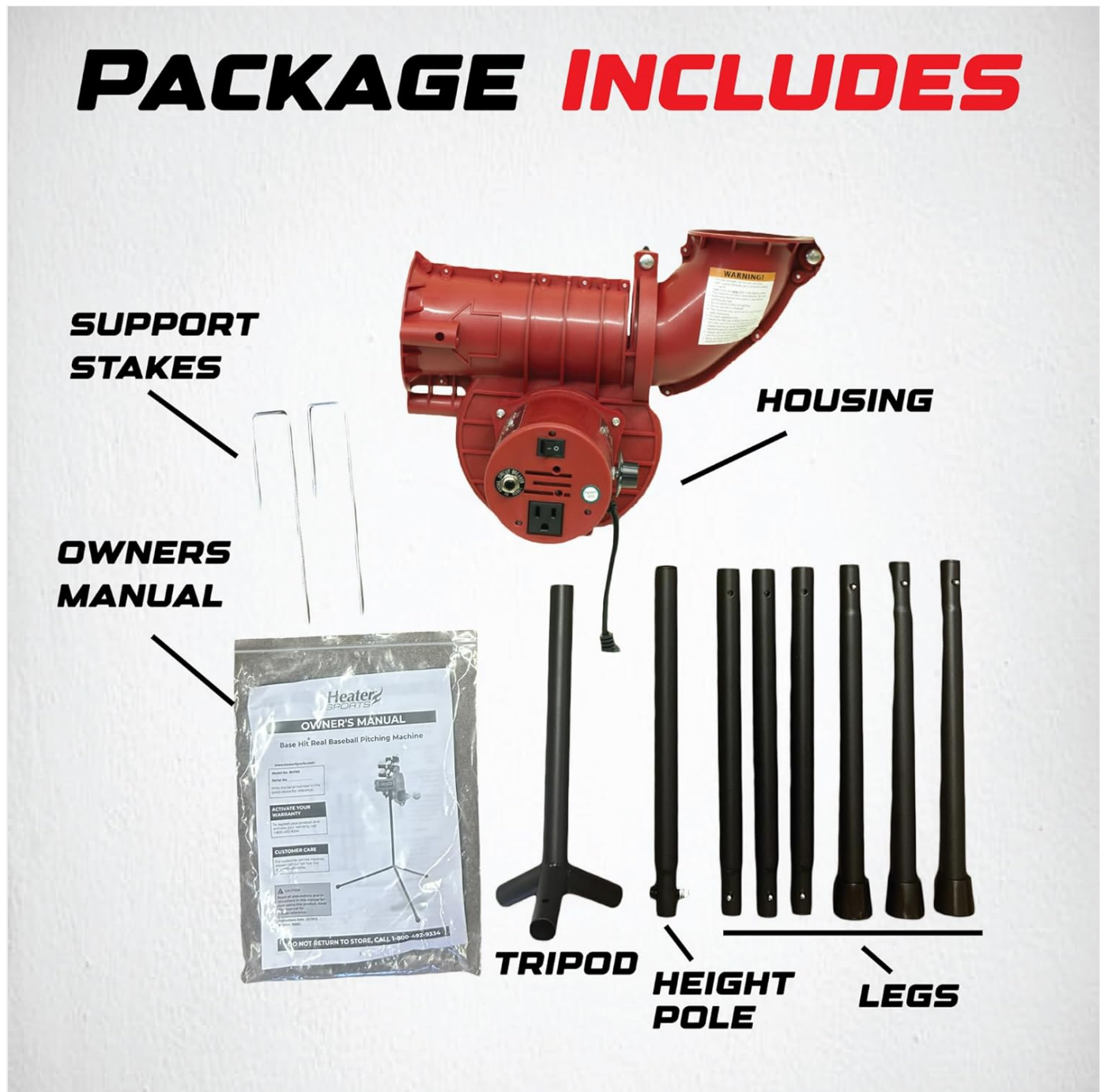
Image 3.1: Components included in the Heater PA99 Power Alley Lite Baseball Pitching Machine package.

Before assembly, verify that all components are present in the package: