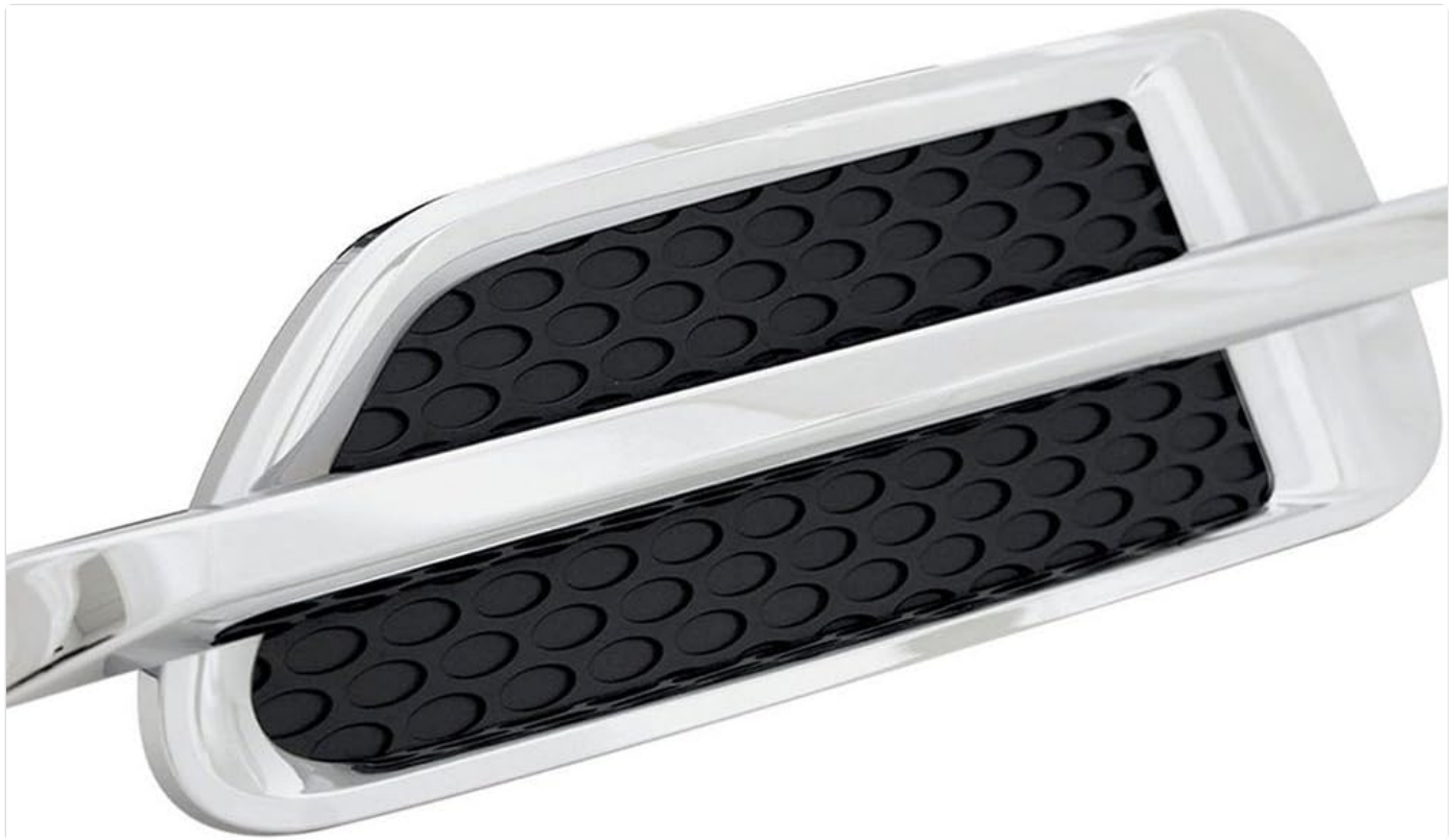
Figure 1: Pilot Automotive CZ279 Large Single Fin Vent. This image displays the vent's sleek chrome frame and the textured black fin insert, designed for aesthetic enhancement on vehicle exteriors.

This manual provides comprehensive instructions for the installation, operation, and maintenance of the Pilot Automotive CZ279 Large Single Fin Vent. Please read this manual thoroughly before installation to ensure proper function and longevity of your product.