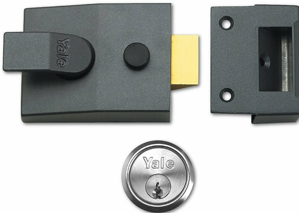
Image 1: Yale Locks 89 Deadlock Nightlatch components, showing the main lock body and strike plate.