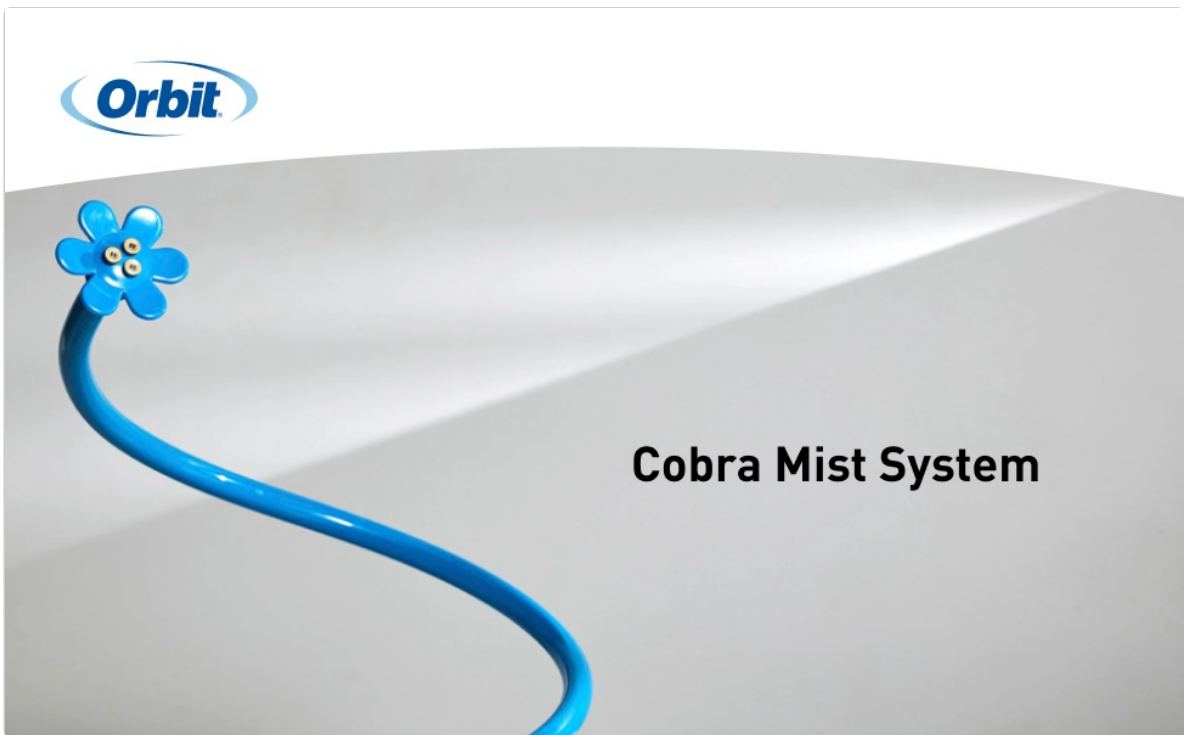
Image: The Cobra Mist System in operation, illustrating the fine mist it produces.