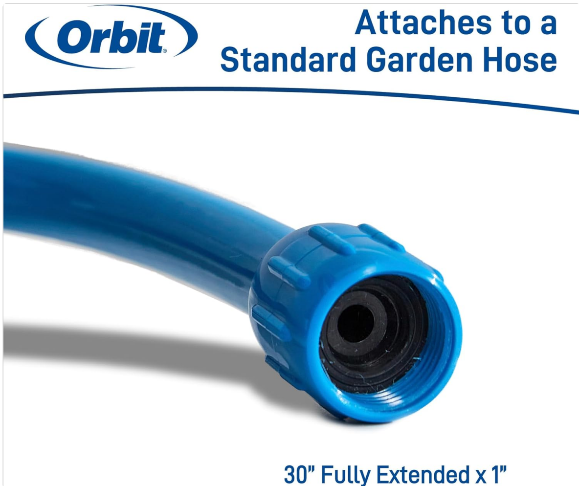
Image: The threaded connector of the Flex Cobra Mist Stand attaching to a standard garden hose.