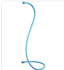
Image: The Orbit Flex Cobra Portable Mist Stand, showcasing its flexible design.

The Orbit 10360 Flex Cobra Portable Mist Stand is designed to provide refreshing cooling outdoors. This flexible and mobile misting system connects to a standard garden hose and can lower ambient temperatures by up to 20 degrees Fahrenheit. Its adjustable design allows for precise mist direction, making it suitable for various outdoor activities.