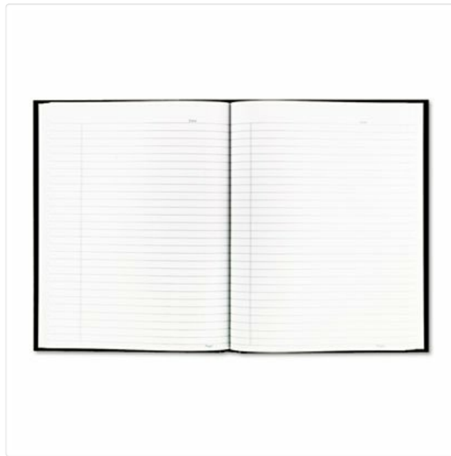
Figure 2.2: Open Blueline Business Notebook A9. The notebook is open to a two-page spread, revealing college-ruled lines on both pages, ready for writing.