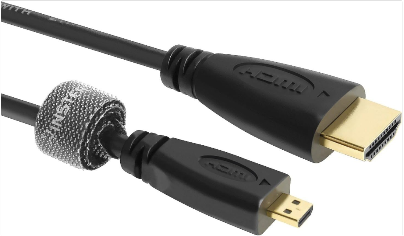
Image: The Micro-HDMI (Type D) connector and the standard HDMI (Type A) connector of the cable.