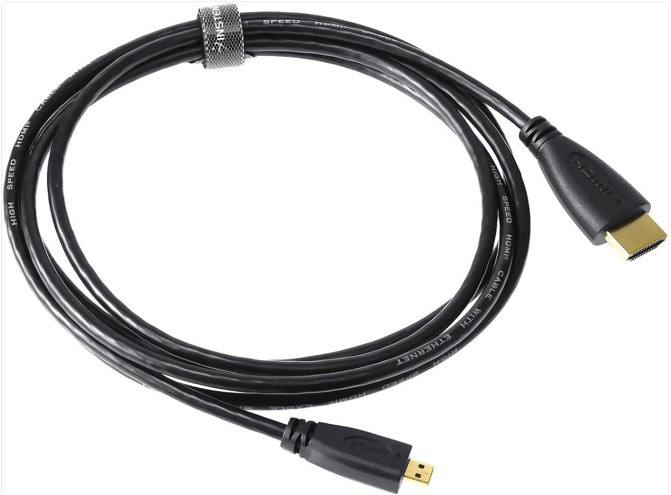
Image: A neatly coiled Micro-HDMI to HDMI cable, secured with a velcro strap, demonstrating proper storage.