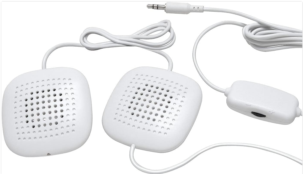
Image: The Sound Oasis SP-101 Pillow Speakers showing the 3.5mm audio jack and the in-line volume control.