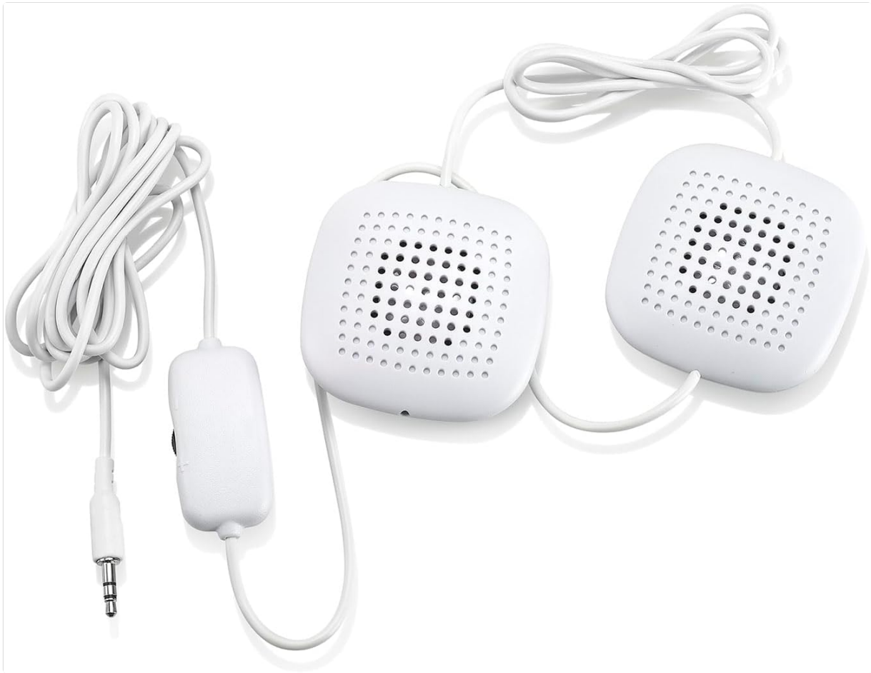
Image: A close-up view of the Sound Oasis SP-101 Pillow Speakers, highlighting the in-line volume control for easy adjustment.