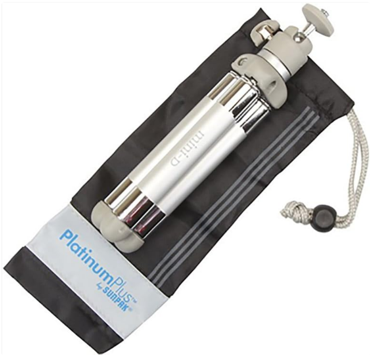
Figure 6: The locking knob on the ball head allows for precise adjustment of your device's angle.