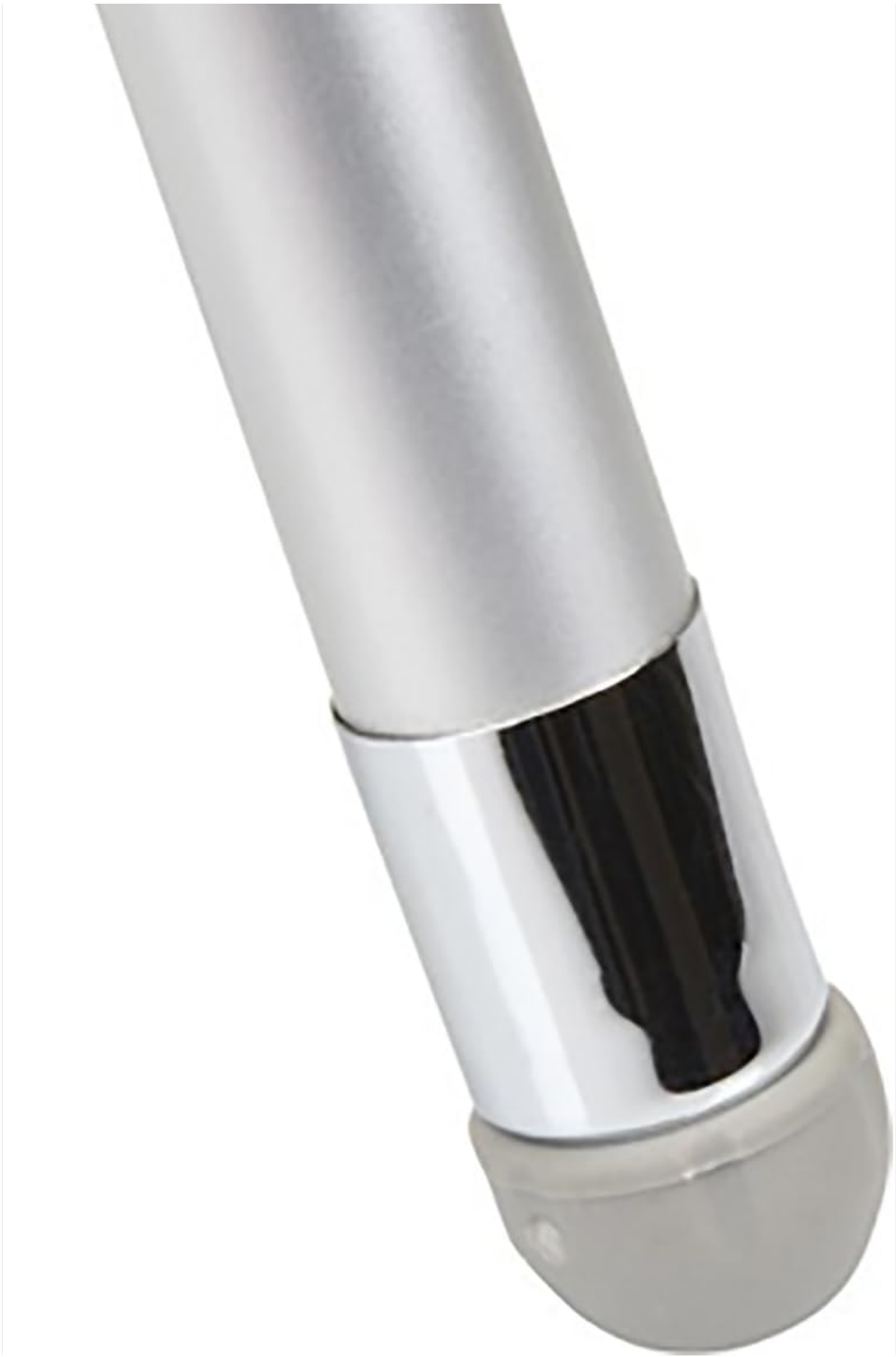
Figure 2: Detail of the leg extension mechanism. Release the clip to extend or retract the leg sections.