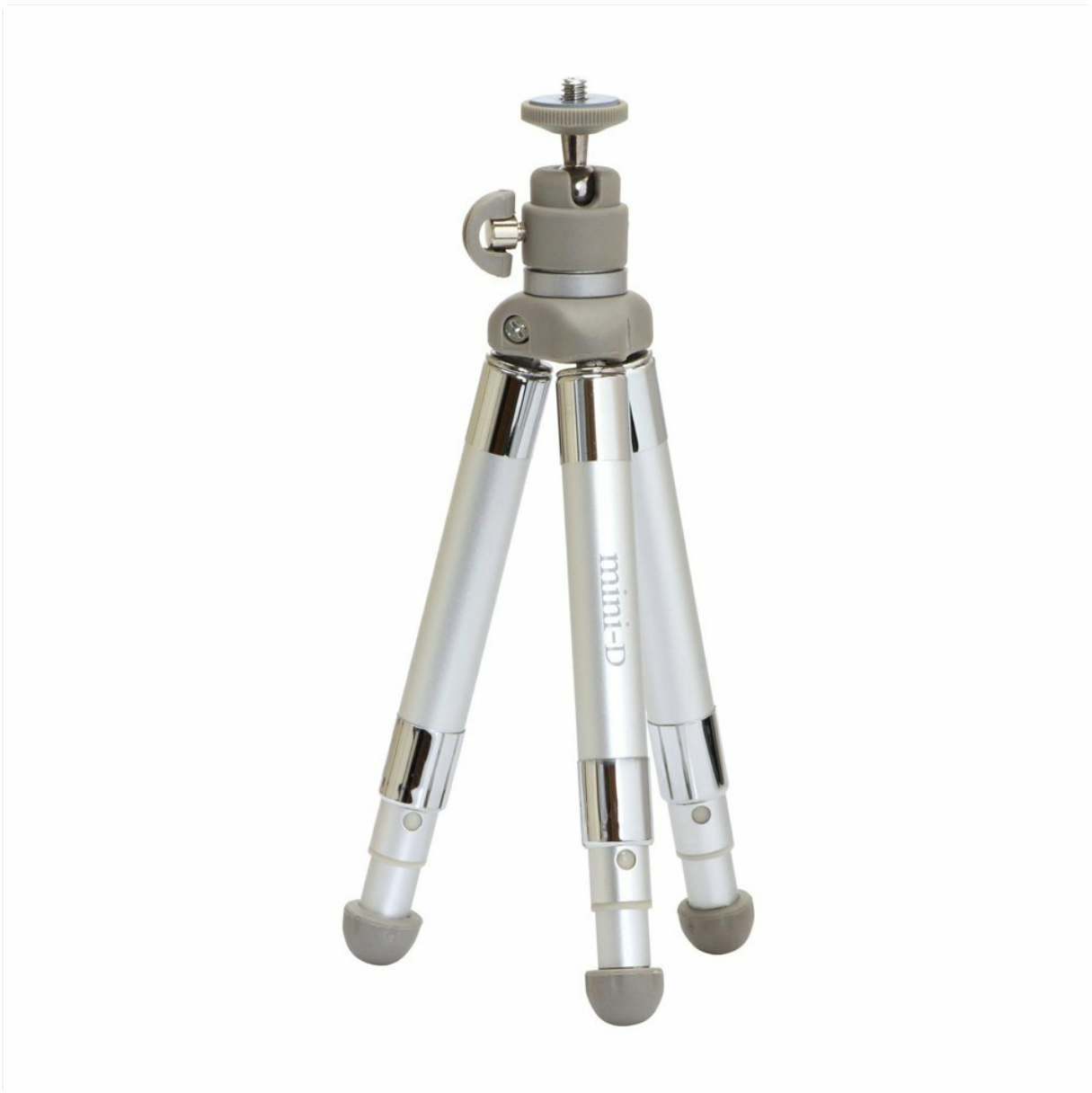
Figure 7: The tripod shown in its compact form, alongside its protective carrying pouch.