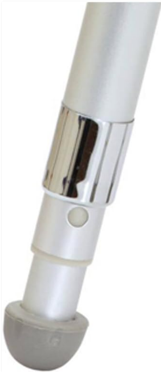
Figure 3: The leg lock mechanism ensures the extended leg sections remain securely in place.