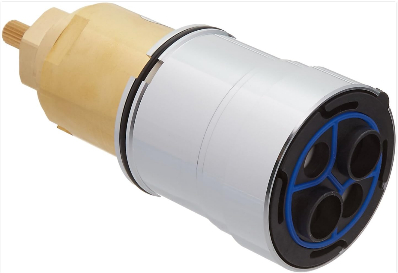
Figure 2: Bottom view of the hansgrohe 88586000 Balance Cartridge, showing the water inlets and outlets.