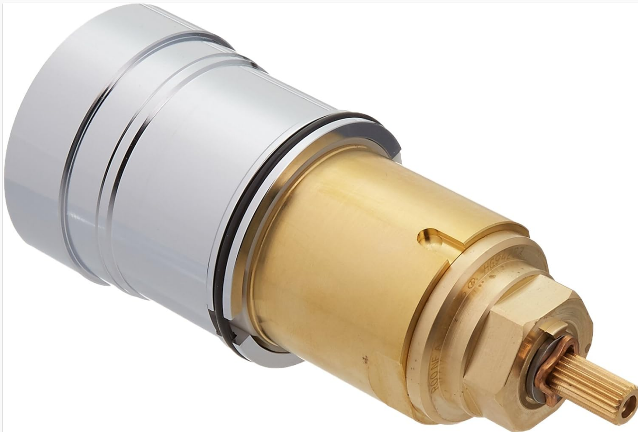
Figure 1: Main view of the hansgrohe 88586000 Balance Cartridge, showing its chrome and brass components.

The hansgrohe 88586000 Balance Cartridge is a replacement component designed for specific hansgrohe faucet models. This cartridge is crucial for regulating water flow and temperature, ensuring consistent performance of your faucet. It is engineered for durability and precise control.