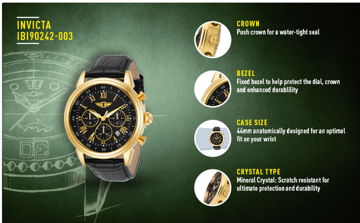
Image 2: Exploded view highlighting the watch's crown, bezel, case size (44mm), and mineral crystal type.