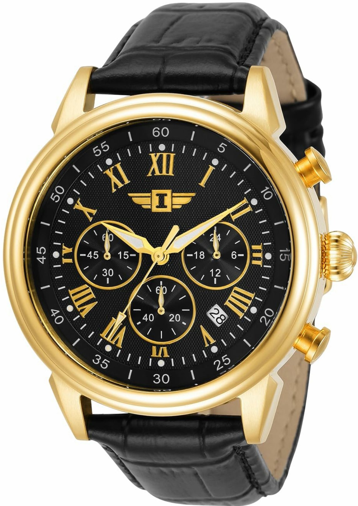
Image 1: Front view of the Invicta Men's Chronograph Watch Model IBI90242-003, showcasing its black dial, gold-tone case, and black leather band.