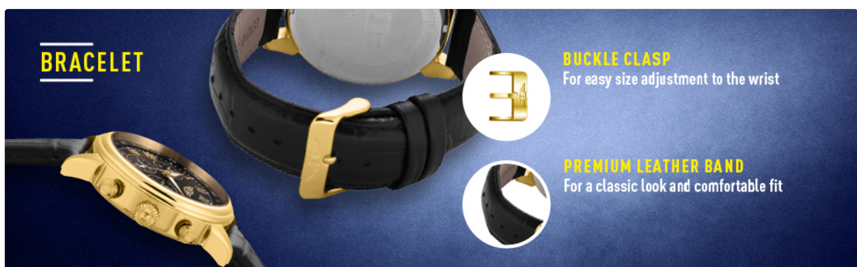
Image 3: Close-up of the black leather band and buckle clasp, designed for easy size adjustment.