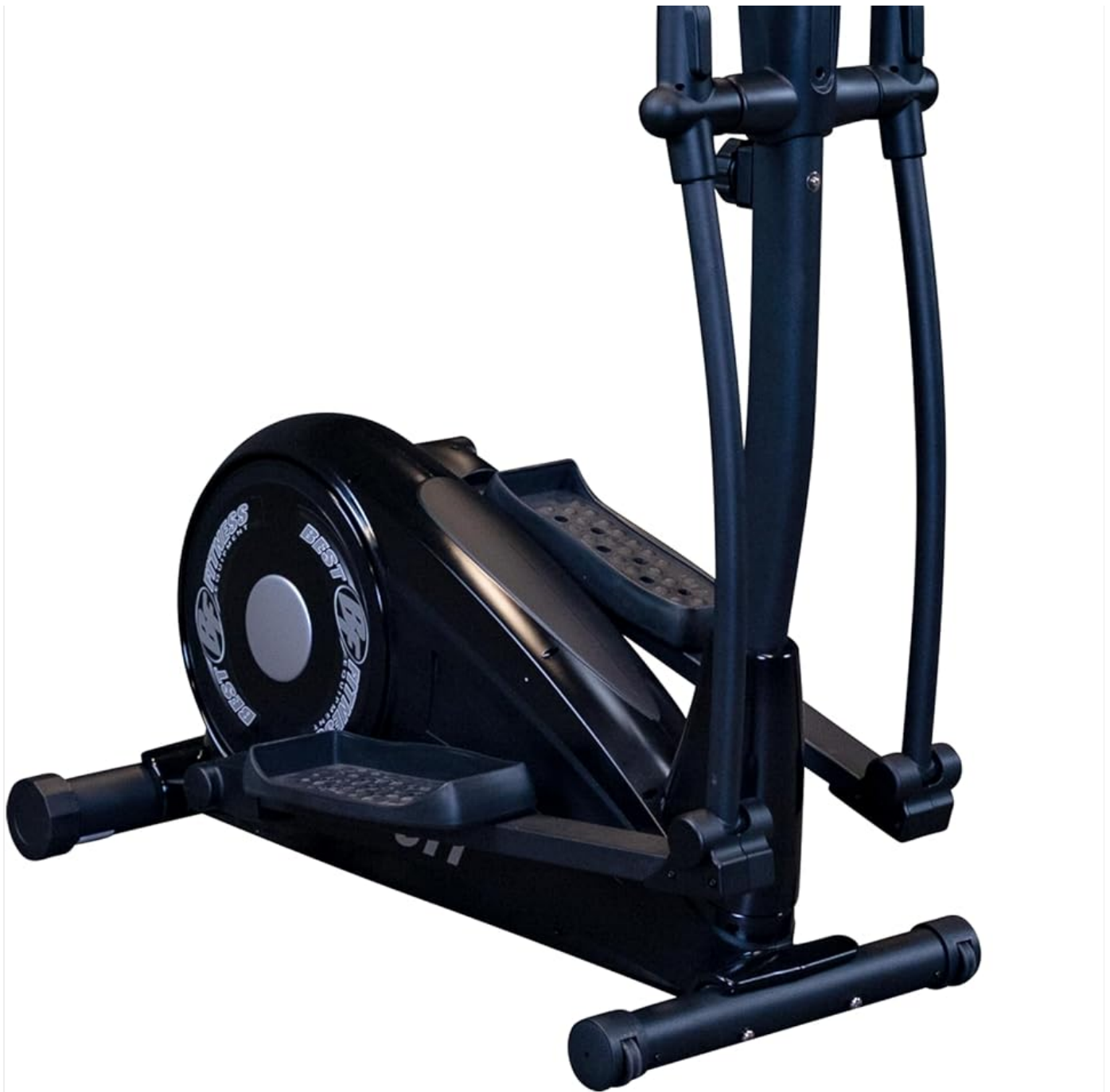
Image 1.1: The Best Fitness BFCT1B Elliptical Trainer Machine. This image shows the complete elliptical trainer from a front-right angle, highlighting its compact design and moving handlebars.