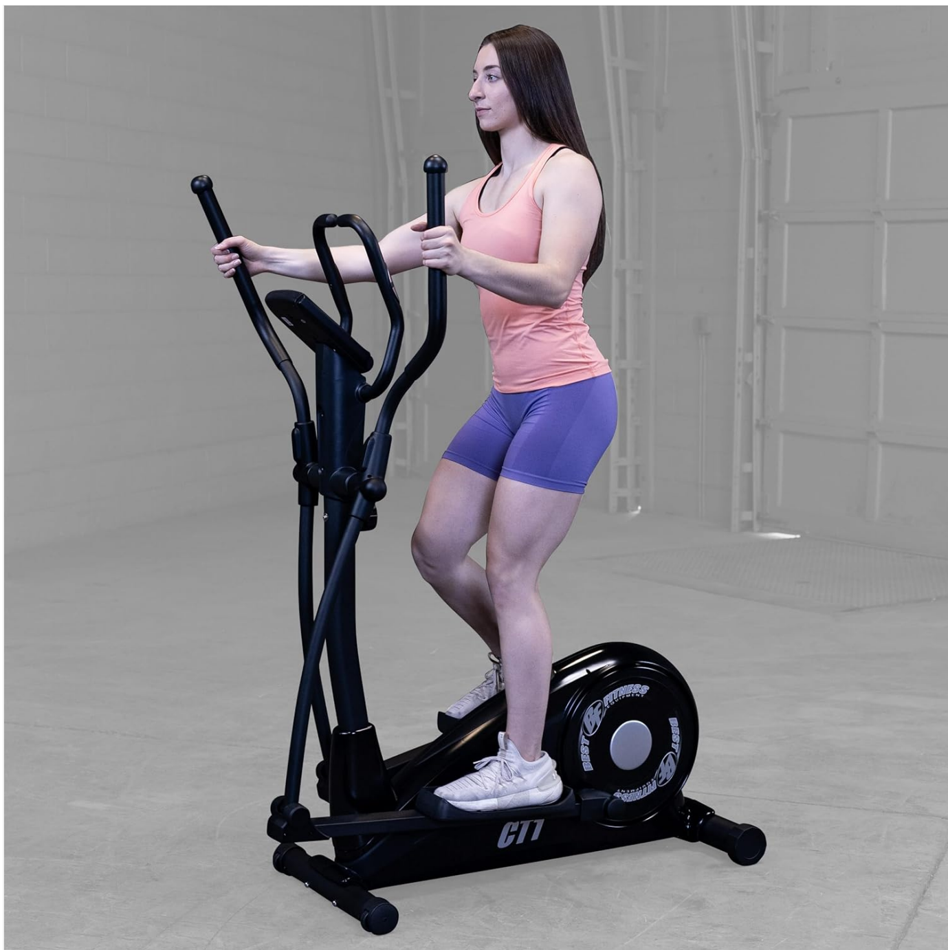
Image 3.1: A user exercising on the Best Fitness BFCT1B Elliptical Trainer. This image demonstrates the elliptical in use, showing the synchronized arm and leg movement.