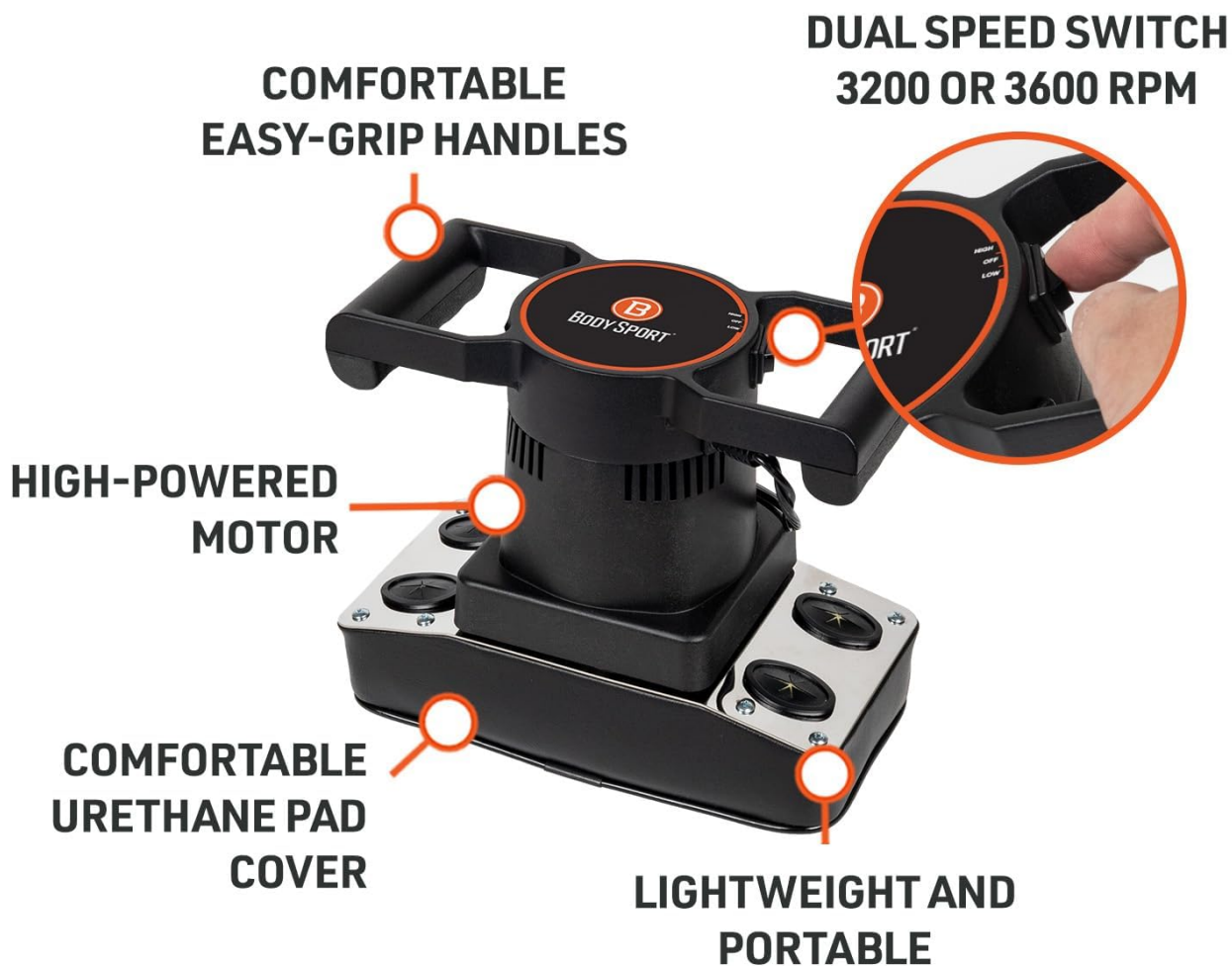
Image: An annotated diagram highlighting the key features of the massager, including handles, motor, pad cover, and speed switch.