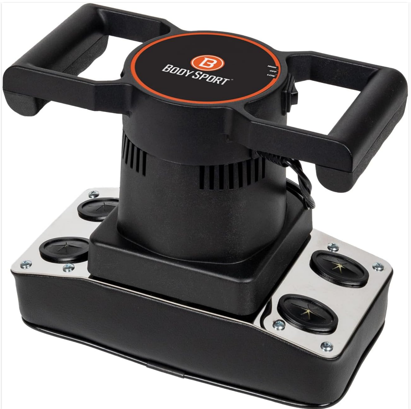
Image: The Body Sport Therapeutic Dual Speed Professional Vibrating Massager, showcasing its handles and padded base.