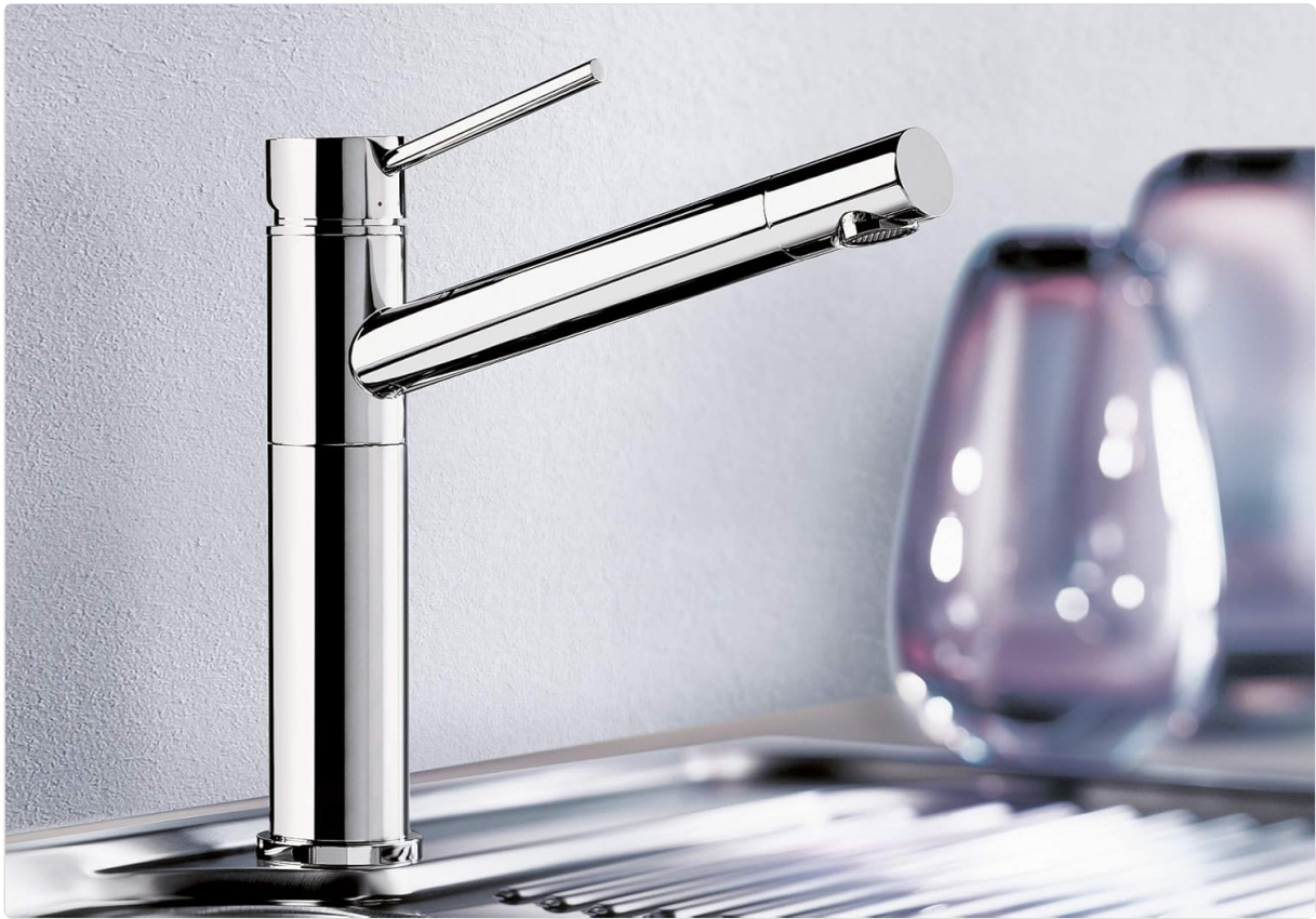
Figure 2: BLANCO Alta 512319 Tap in a kitchen setting. This image shows the tap installed next to a kitchen sink, demonstrating its integration into a contemporary kitchen environment.

The BLANCO Alta 512319 is a single-lever mixer tap designed for kitchen use, featuring a high spout for convenience and a 360° revolvable spout for enhanced flexibility. It is constructed from brass with a chrome finish, ensuring durability and a rust-resistant quality.