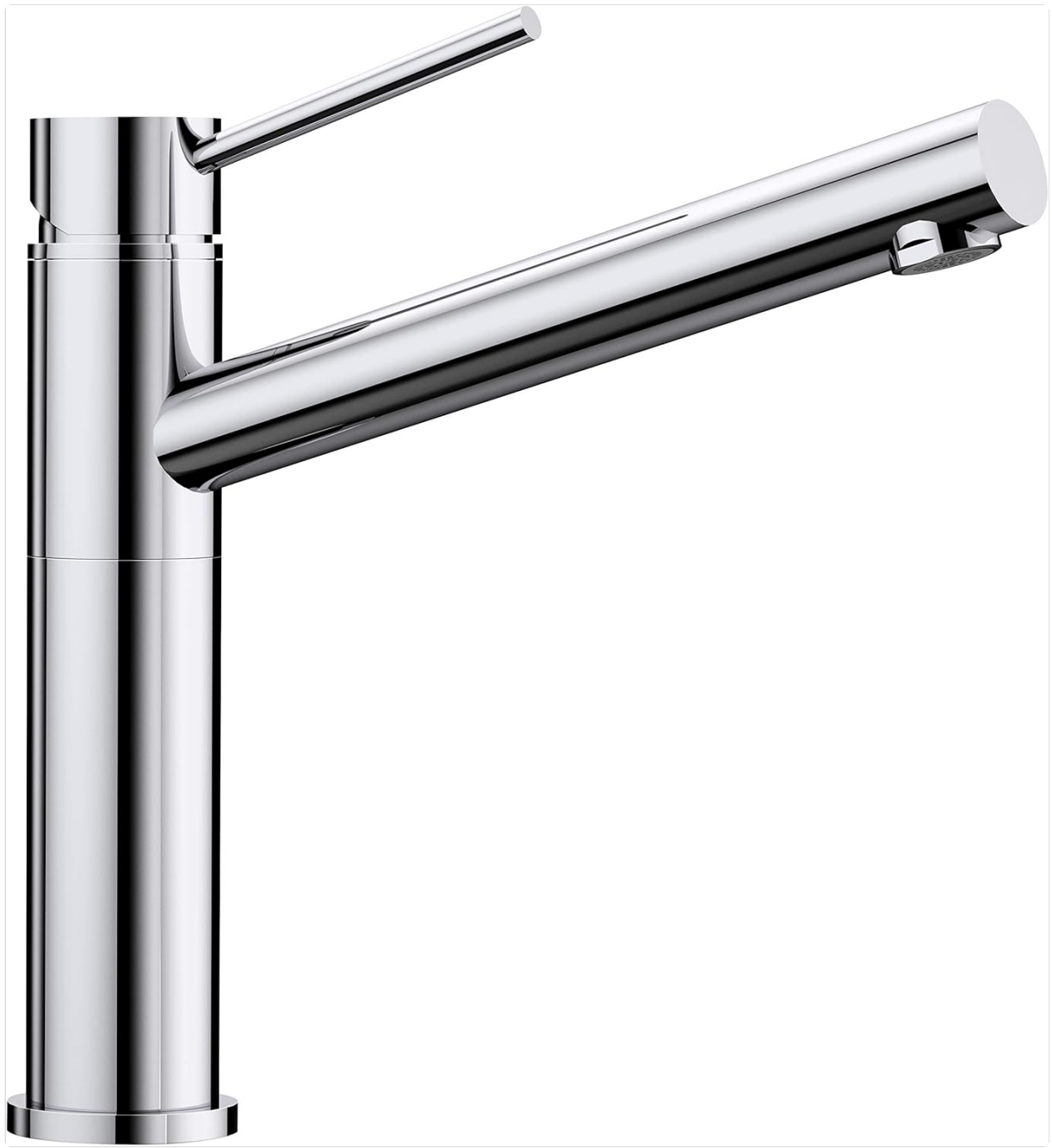
Figure 1: BLANCO Alta 512319 Single-Lever Kitchen Mixer Tap. This image displays the complete tap unit, highlighting its chrome finish and modern design.