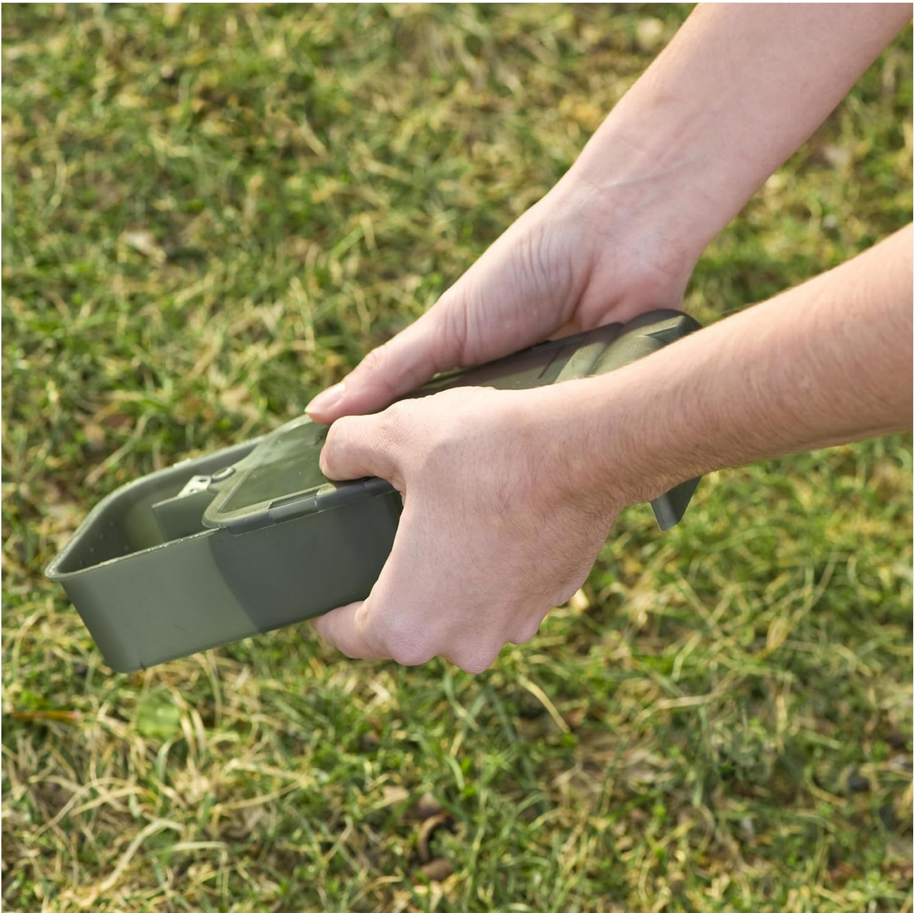
Image 1.1: The Victor M333 trap is designed to humanely catch up to four mice at once.