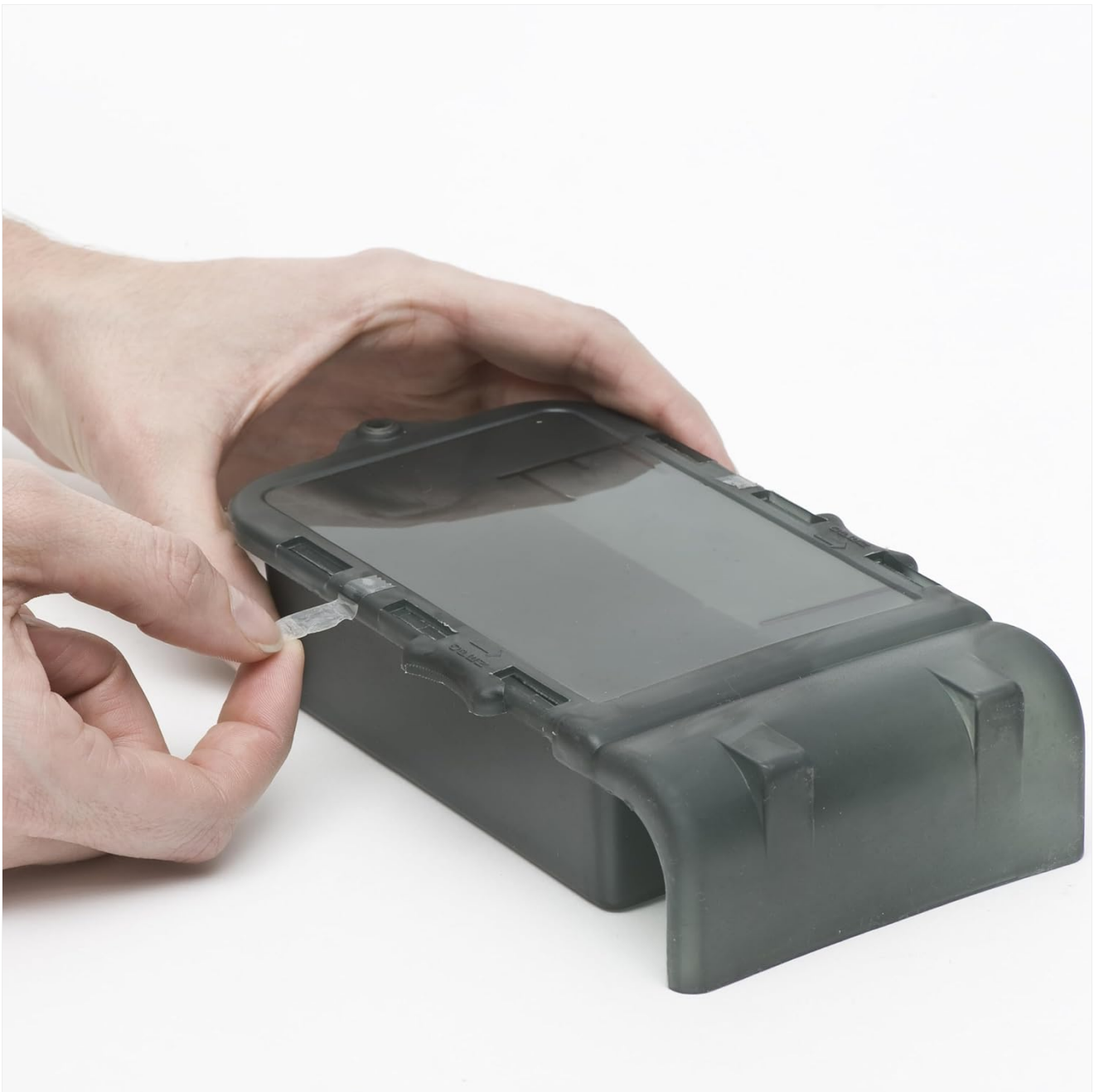
Image 3.2: Release captured mice at a suitable location away from your property.