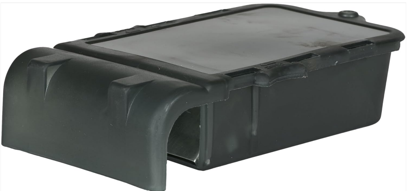
Image 2.2: Apply a small amount of bait into the designated trough.