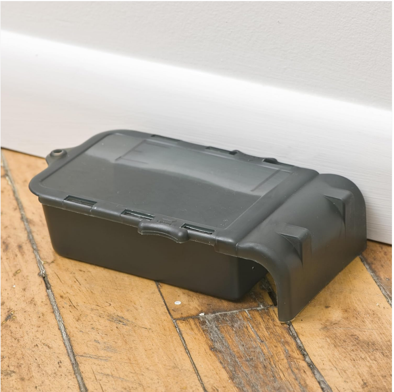
Image 1.2: The trap is safe for use around people and pets when used as directed.