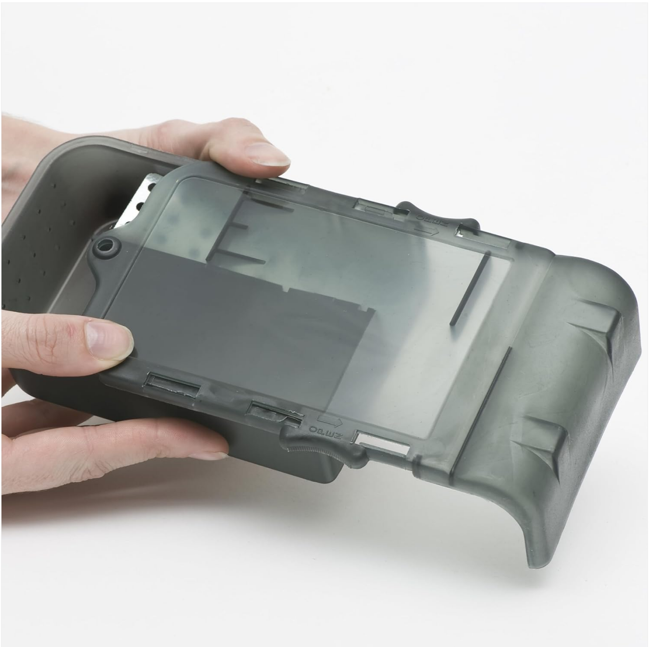
Image 1.3: The Victor M333 trap is versatile for both indoor and outdoor applications.