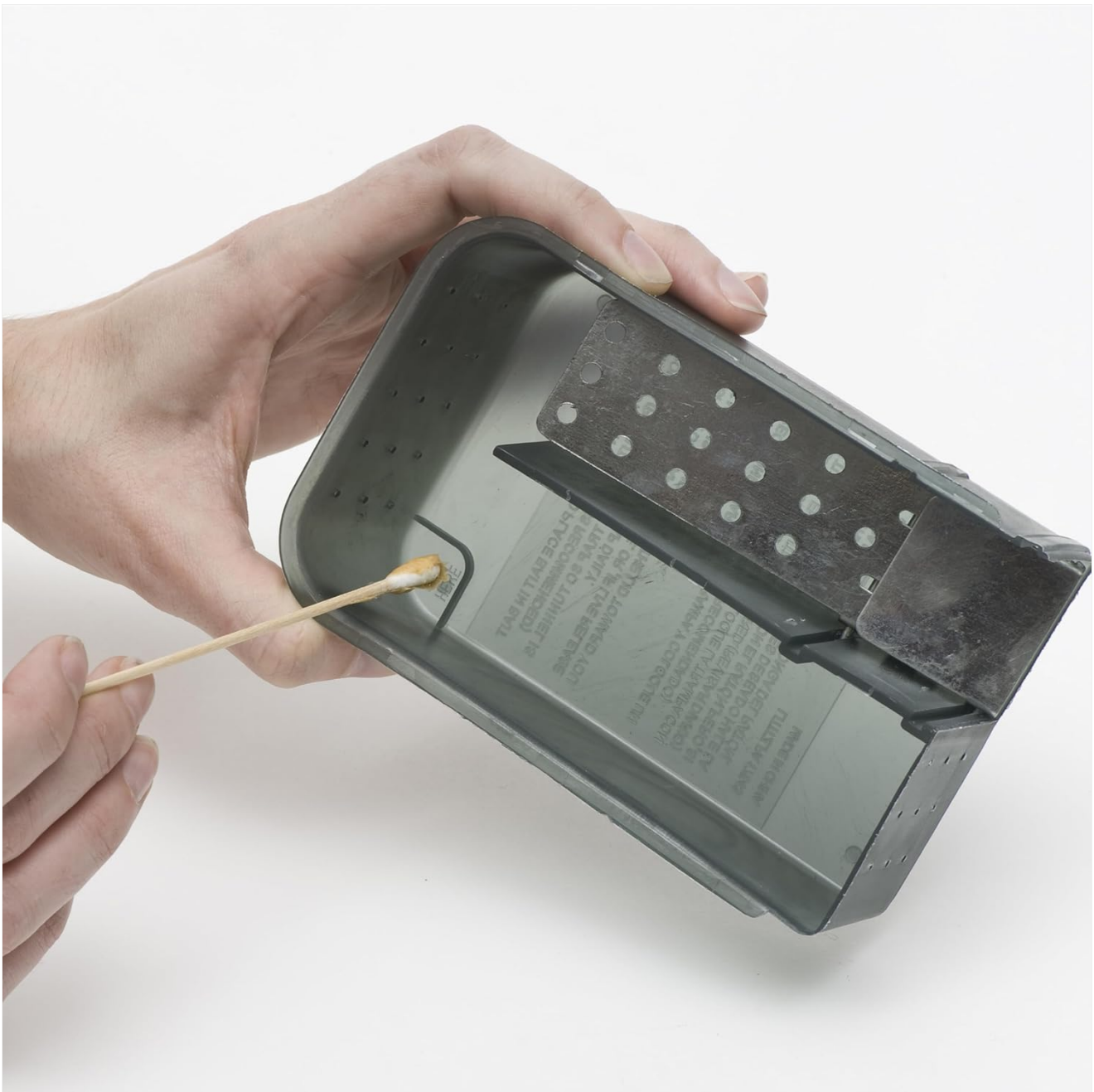
Image 4.1: The trap can be easily opened and cleaned for repeated use.