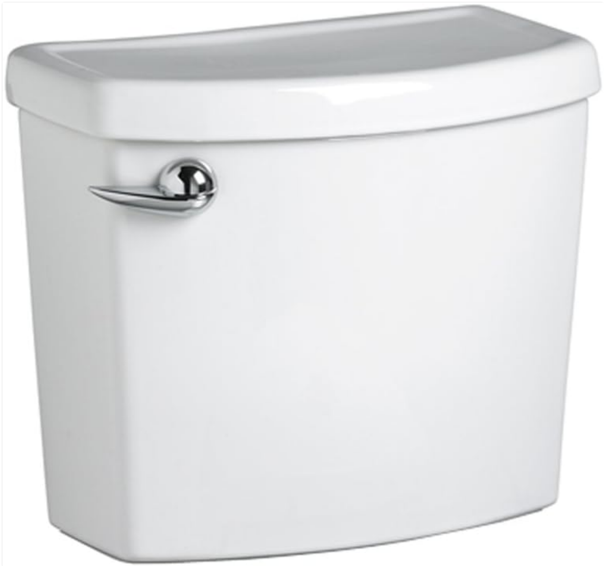
Image 1: Front view of the American Standard Cadet 3 Flowise Toilet Tank in white, featuring a chrome trip lever.

This document contains critical information for a successful installation.