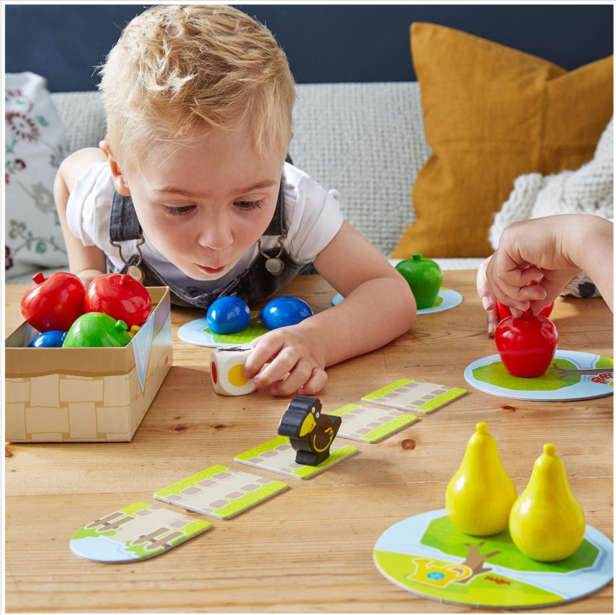
Image 4: A child rolling the large wooden die during gameplay, with fruit pieces and the raven on the table.