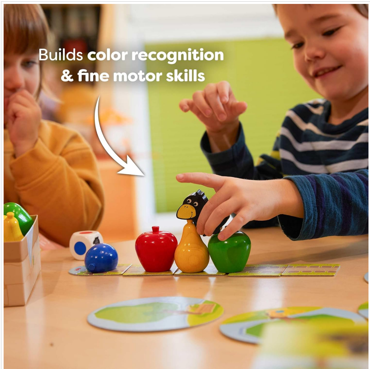
Image 5: A child's hand pointing to a green apple, illustrating the development of color recognition skills.