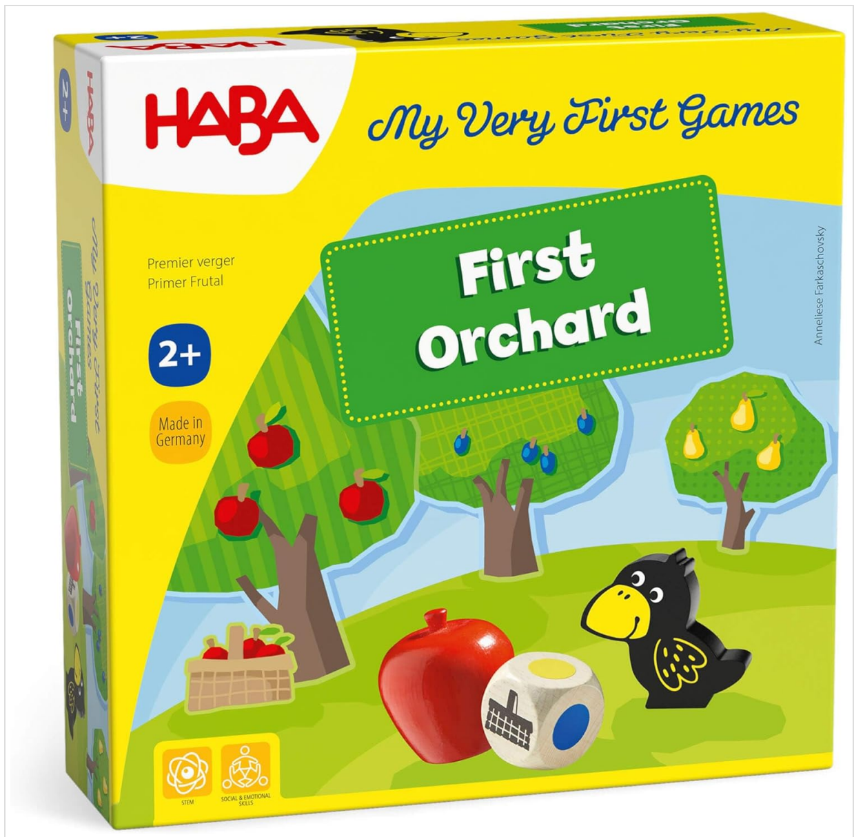
Image 1: The HABA First Orchard game box, featuring colorful fruit trees, a raven, a die, and a fruit basket.