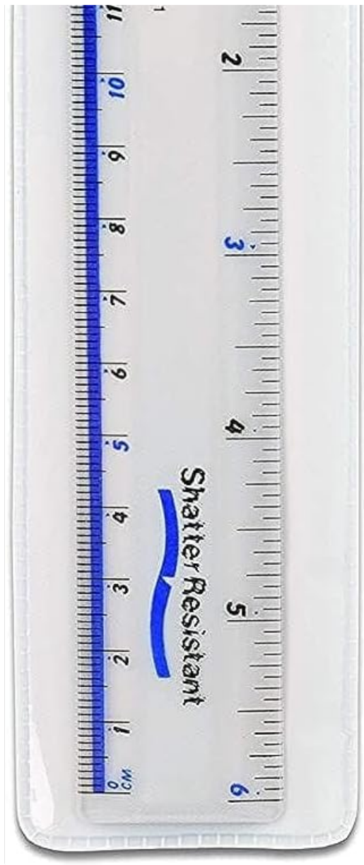
Figure 1: Helix 6 inch 15cm Clear Ruler in retail packaging.

The Helix ruler features easy-to-read 2-color print graduations for both inches (up to 6 inches) and centimeters (up to 15 cm), including zero-center graduations for specific measurement needs. Its compact size makes it convenient for desks, bags, and pencil cases.