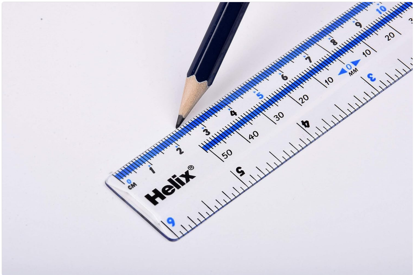
Figure 3: Demonstrating the ruler's use for drawing straight lines.