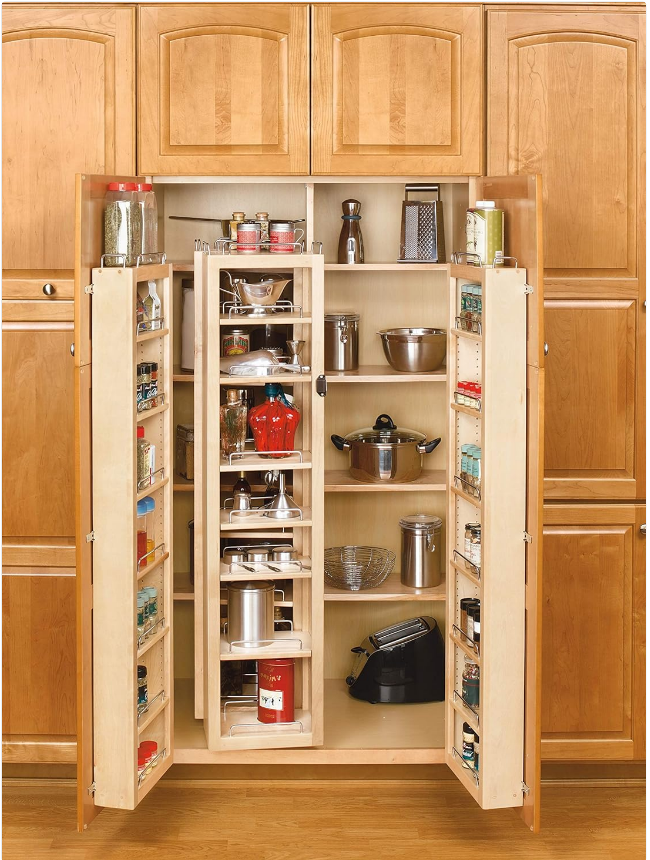
Figure 4: Pantry Kit in use, demonstrating storage capacity.