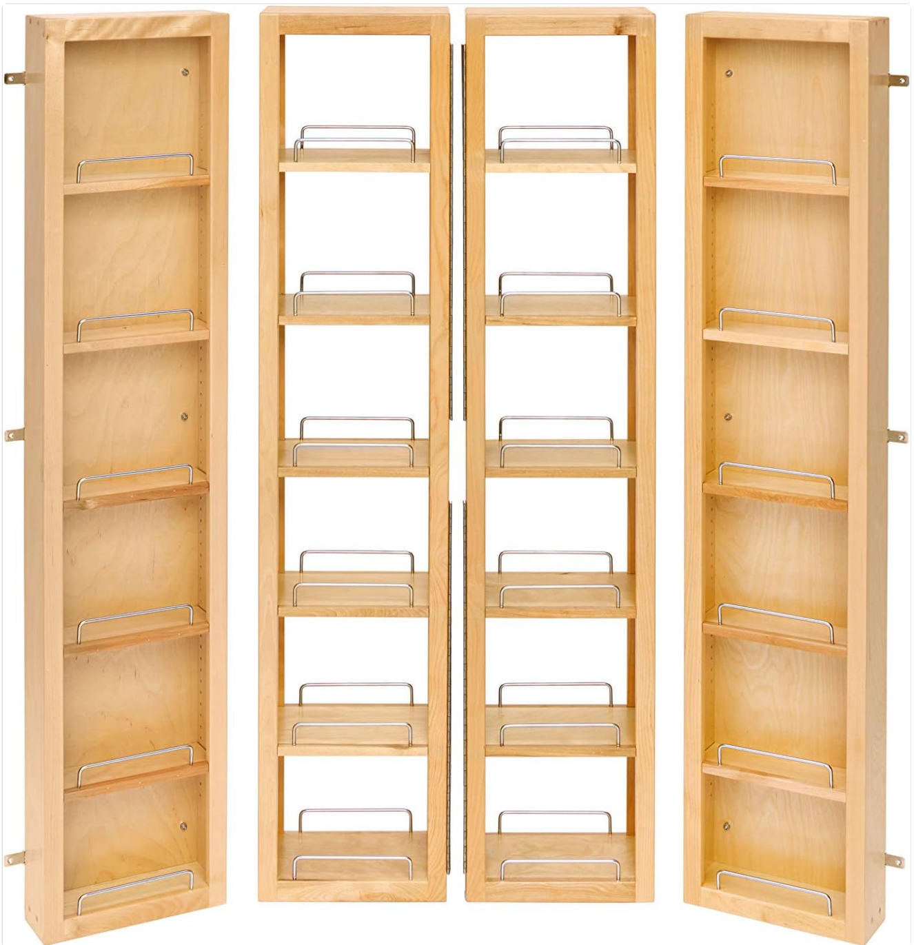
Figure 1: Components of the Rev-A-Shelf Swing Out Pantry Kit.