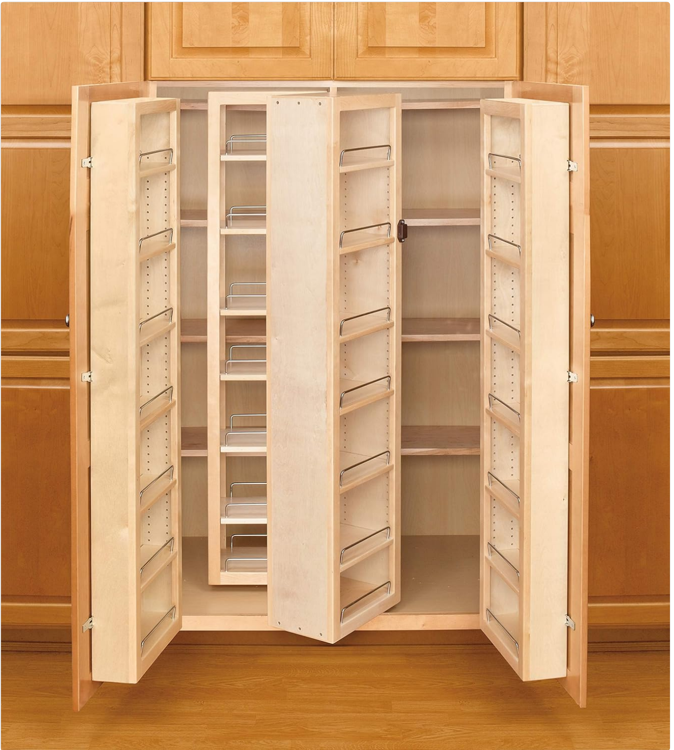
Figure 3: Installed Rev-A-Shelf Pantry Kit with units extended.