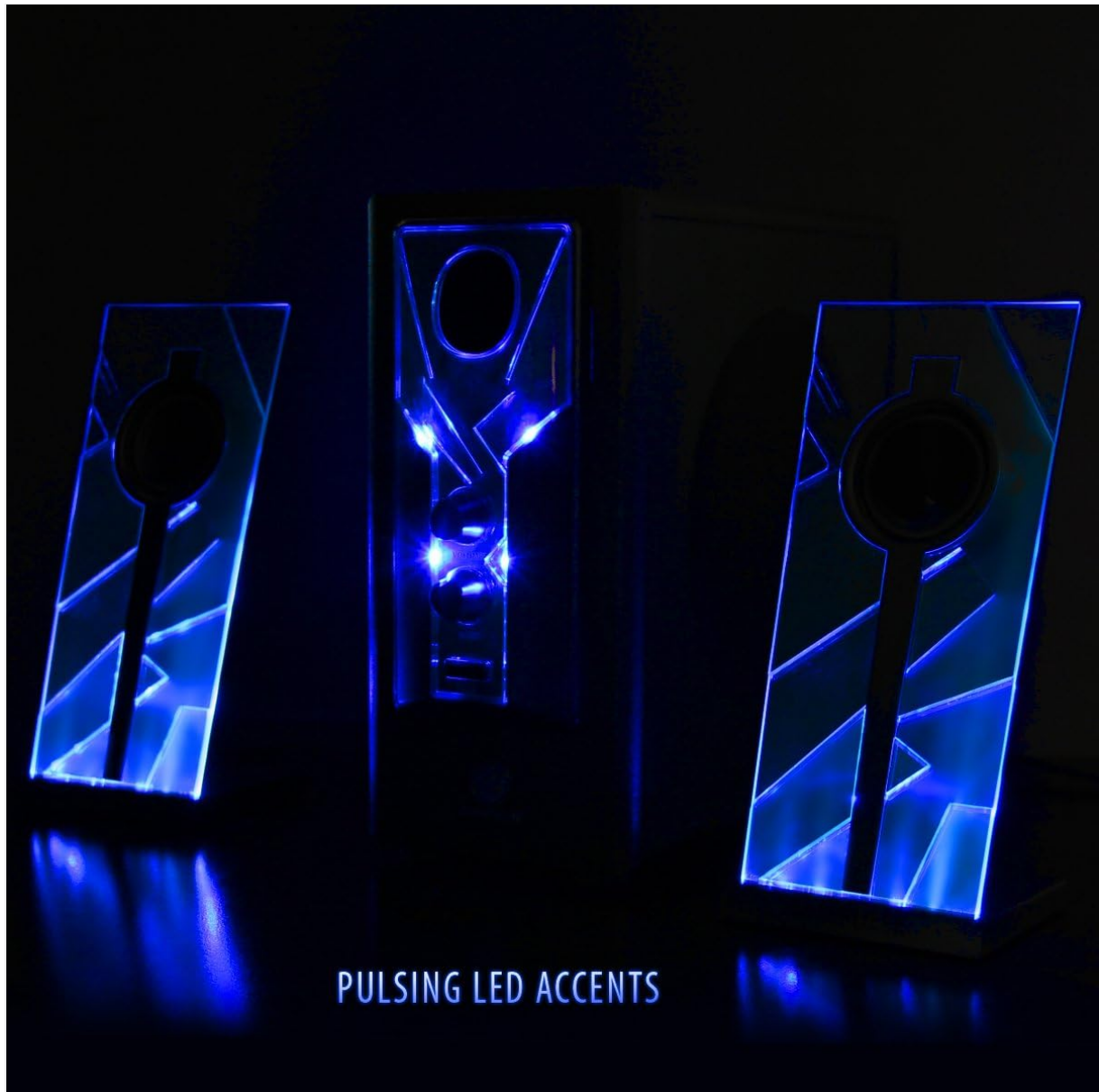
Image: The GOgroove BassPULSE 2.1 speaker system arranged on a desk, showcasing the blue LED illumination.