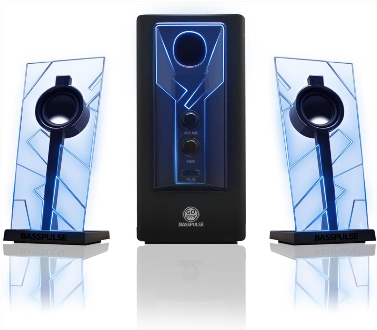
Image: The GOgroove BassPULSE 2.1 Computer Speaker system, featuring a subwoofer and two satellite speakers with blue LED accents.