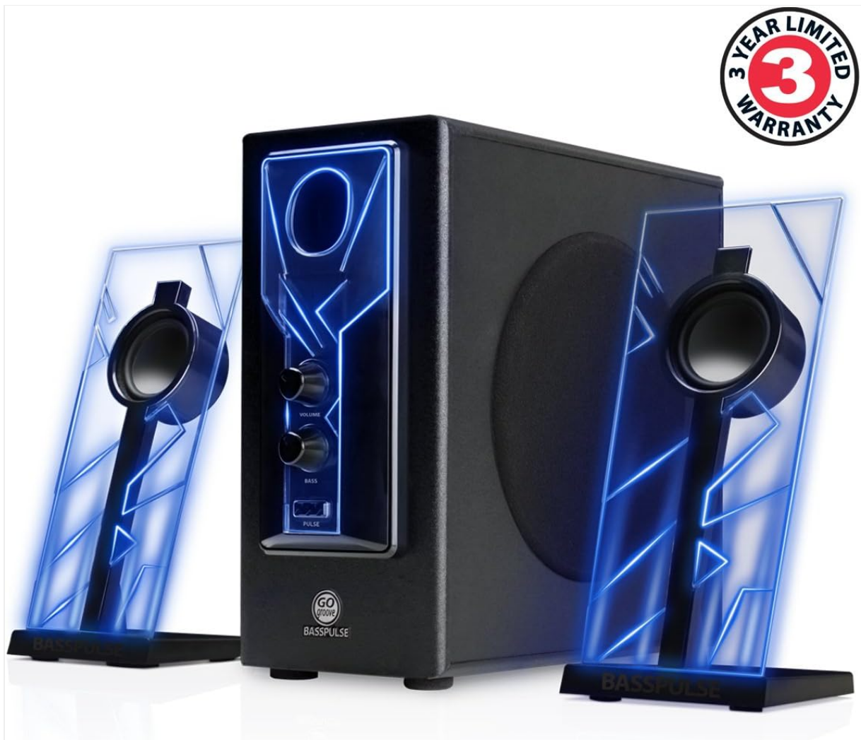
Image: The GOgroove BassPULSE 2.1 speaker system, highlighting the 3-year limited warranty.