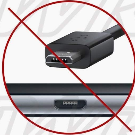
Image: A visual warning indicating that the product is not a USB charger, specifically showing a micro USB connector with a red cross over it.