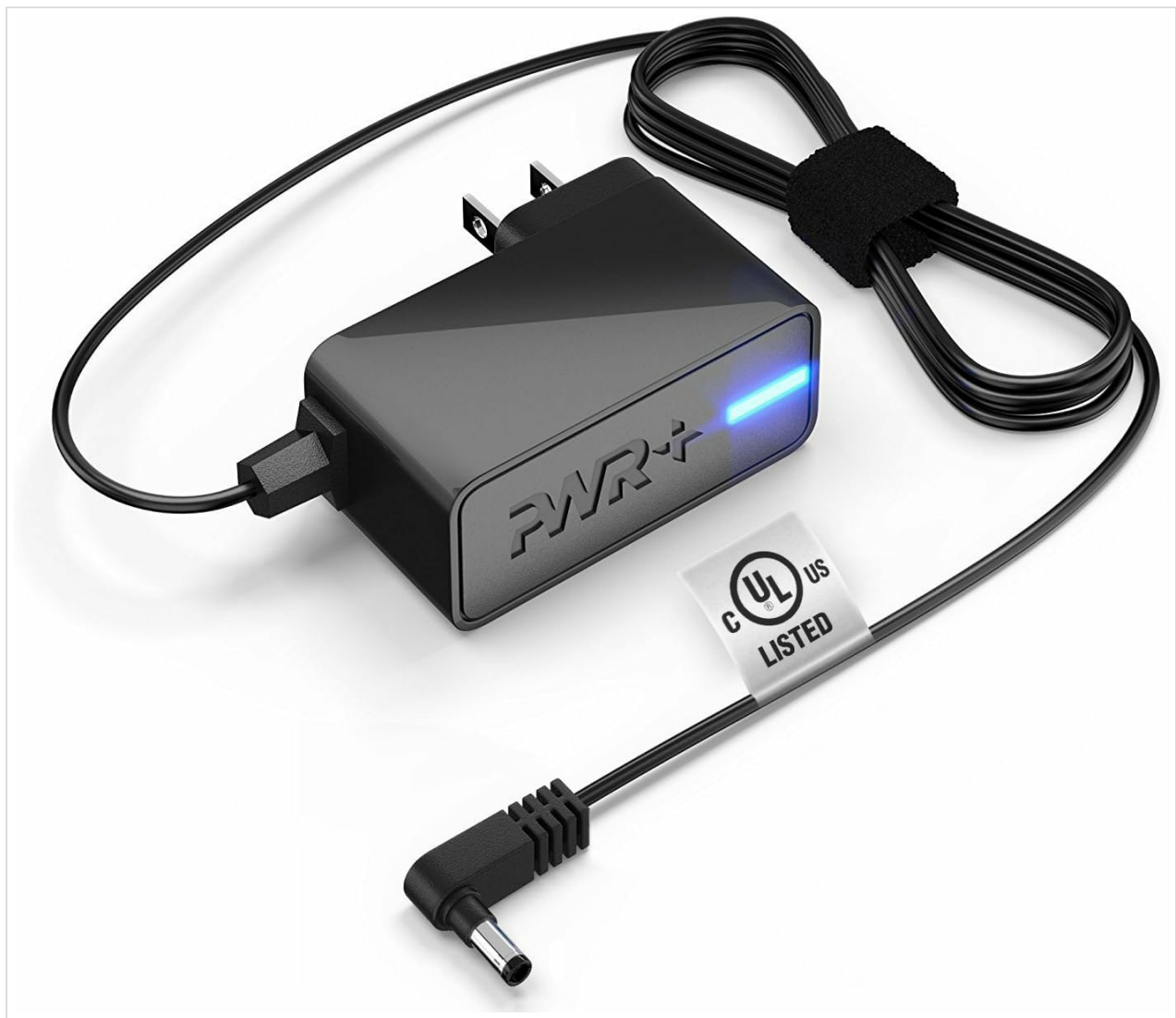
Image: The PWR+ AC Adapter unit with its attached power cord and barrel connector.