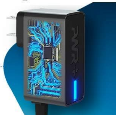
Image: An illustration detailing the internal construction of the power cord, highlighting high-grade copper, wire insulation, aluminum foil shield, protective tinned copper braid, and PVC cable jacket. It also shows the adapter with icons for Short Circuit Protection (SCP), Over Current Protection (OCP), Over Voltage Protection (OVP), and Over Temperature Protection (OTP).