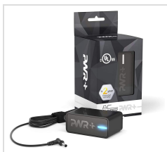
Image: The UL Listed certification logo, signifying that the product meets recognized safety standards. The adapter incorporates built-in safety protections: