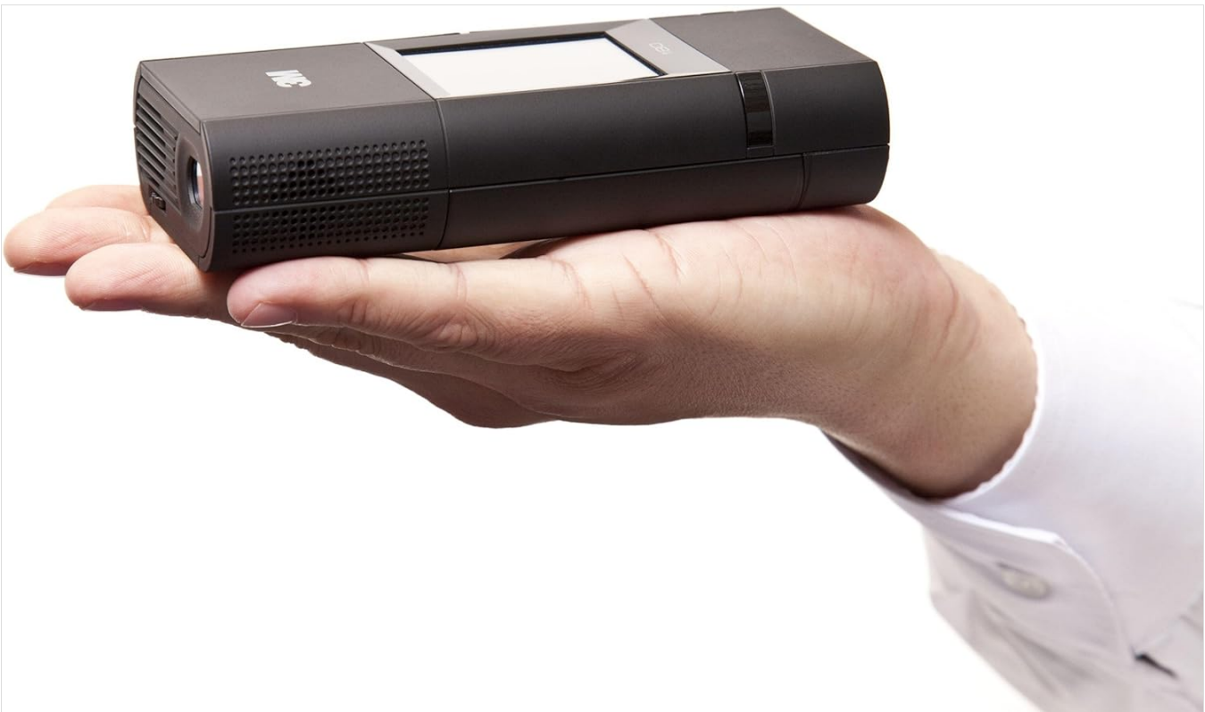
Figure 3: The MP180 held in an adult's hand, illustrating its highly portable and compact form factor, making it easy to carry for presentations or entertainment on the go.