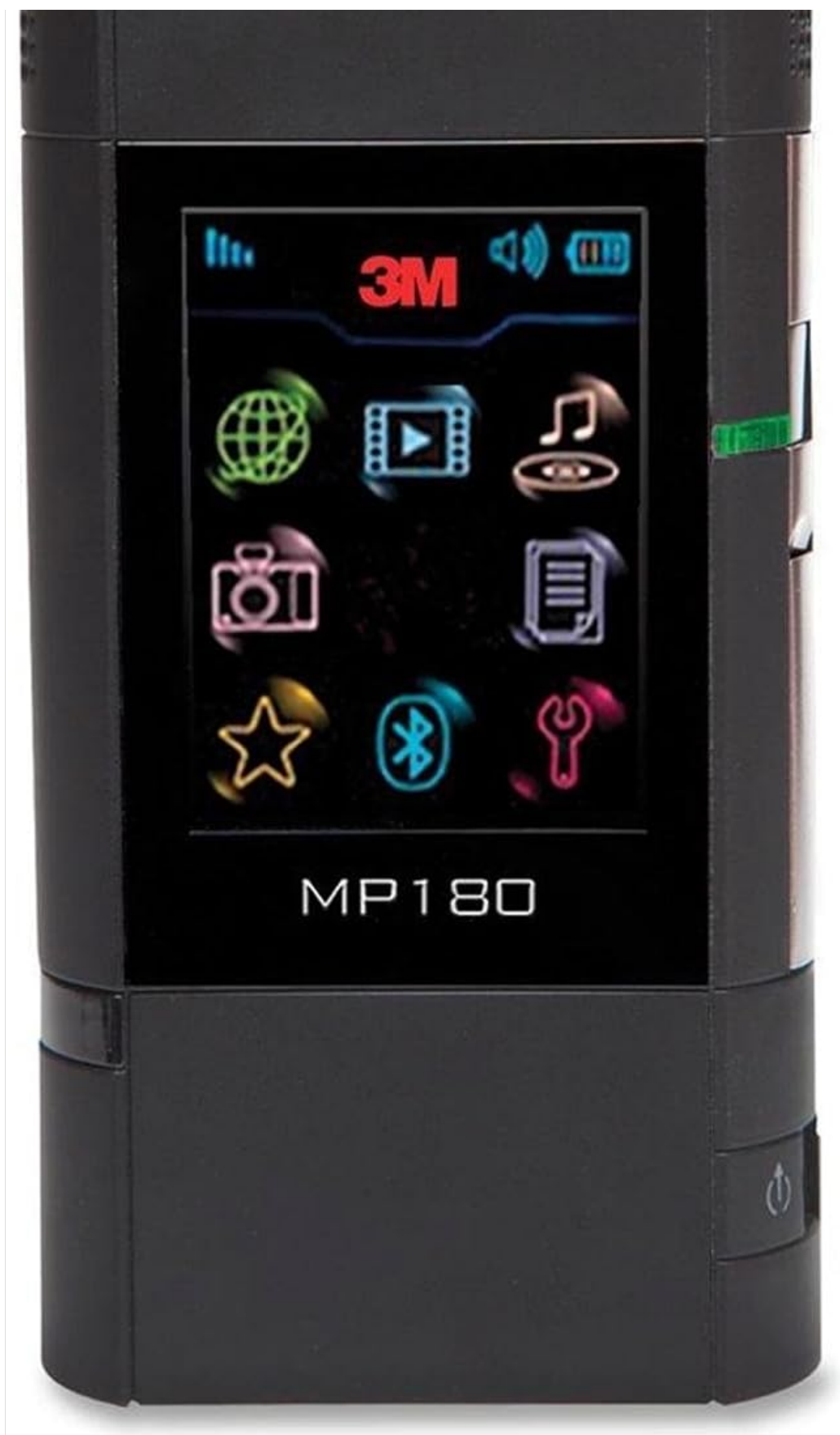
Figure 1: Front view of the 3M Pocket Projector MP180, highlighting its intuitive touch-screen interface and compact design. The screen displays icons for various functions including web browsing, video playback, music, photos, documents, and system settings.