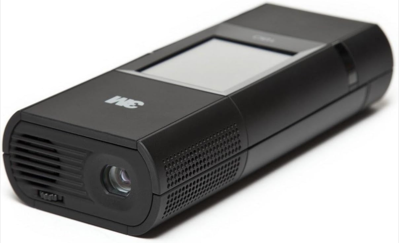
Figure 2: Angled view of the MP180, showcasing the projection lens at the front and the integrated ventilation grilles designed for efficient heat dissipation during operation.