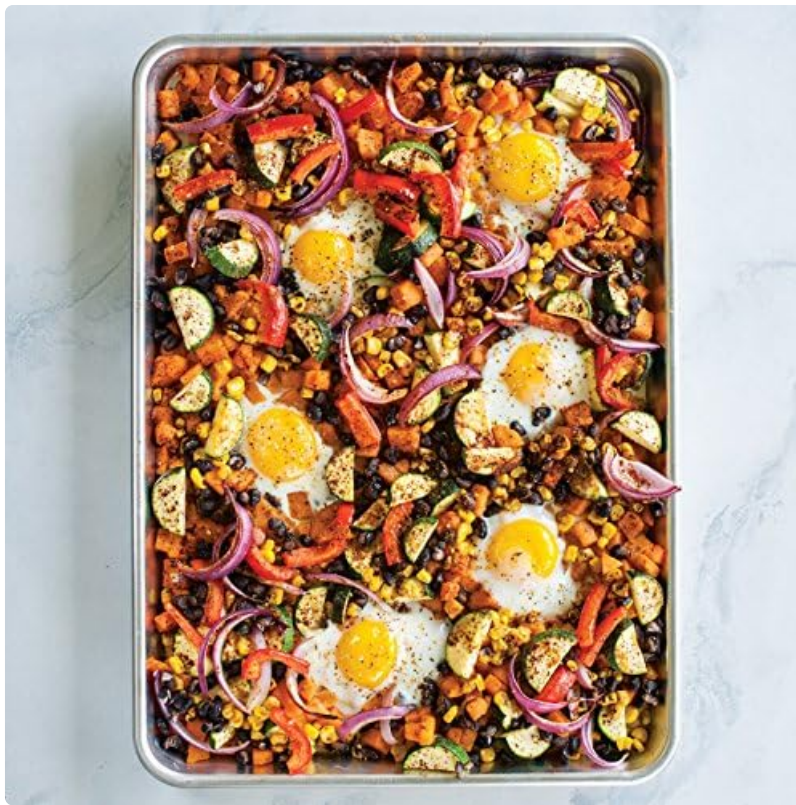
Image: Sheet pan dinner with eggs, vegetables, and beans on a Nordic Ware baking sheet.