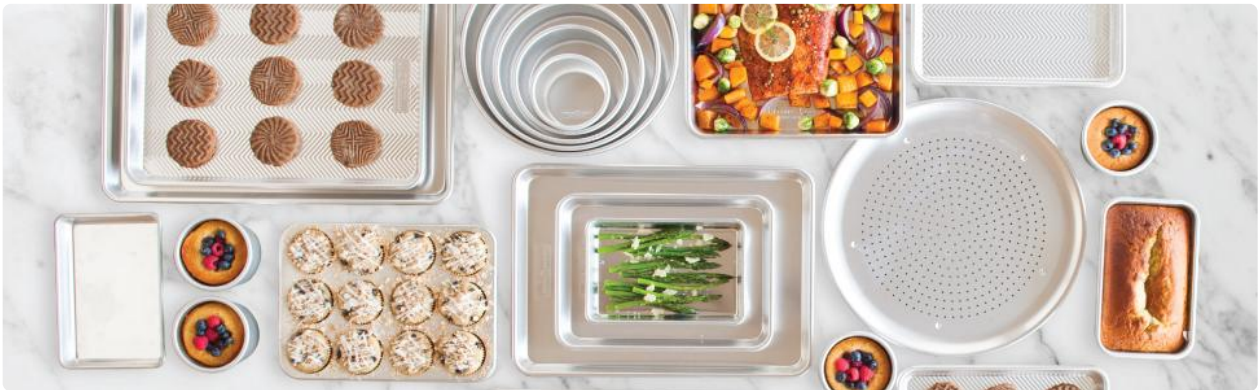
Image: Nordic Ware Naturals Aluminum Bakeware branding.

Welcome to the instruction manual for your Nordic Ware Naturals Half Sheet Baking Pans. These pans are designed for both commercial and home use, offering durable, natural aluminum construction for superior heat conductivity and even baking. The encapsulated galvanized steel rims are engineered to prevent warping, ensuring long-lasting performance. This manual provides essential information for the proper setup, operation, maintenance, and care of your new bakeware.