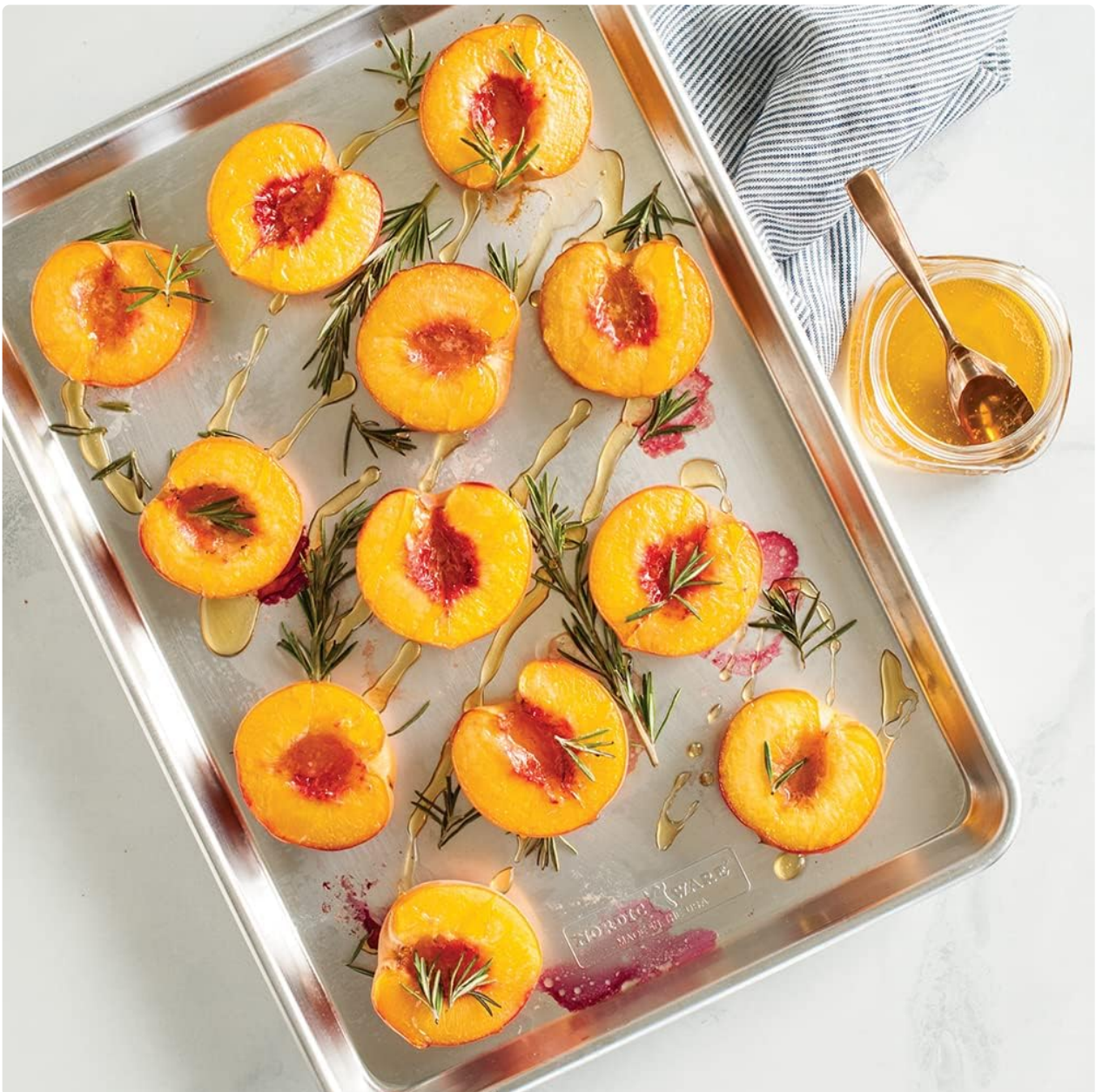
Image: Roasted peaches with rosemary and honey on a Nordic Ware baking sheet.