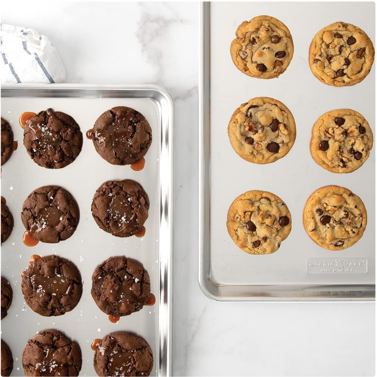
Image: Chocolate chip cookies and chocolate cookies on two Nordic Ware baking sheets.