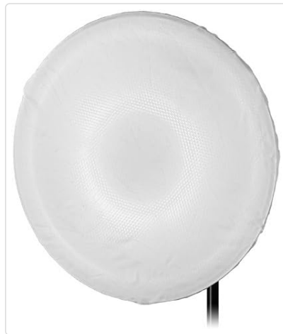
The beauty dish with the included white diffusion sock, which softens the light output for a more diffused effect.