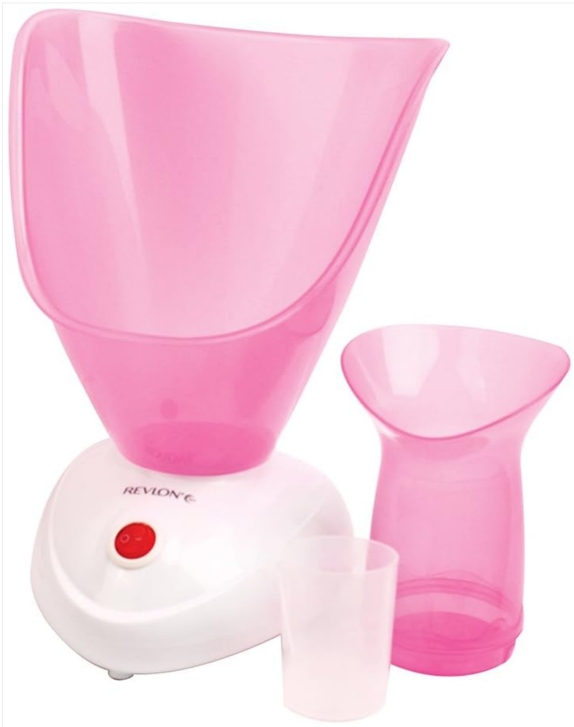
Image: The Revlon RVSP3503B Facial Sauna main unit, shown with the large facial cone attached, the smaller nasal cone, and the measuring cup. All components are pink and white.