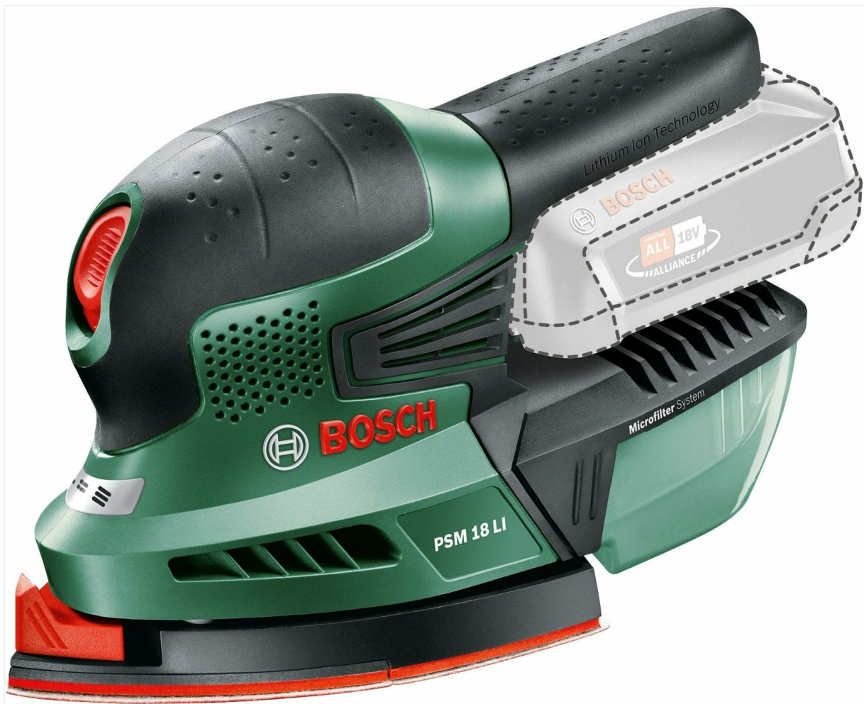
The Bosch PSM 18 LI Cordless Multi-Sander, a versatile tool for various sanding tasks.