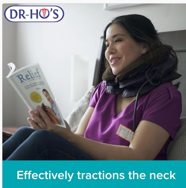
Image: A person wearing the Dr-Ho's Neck Comforter, demonstrating its use for neck traction.