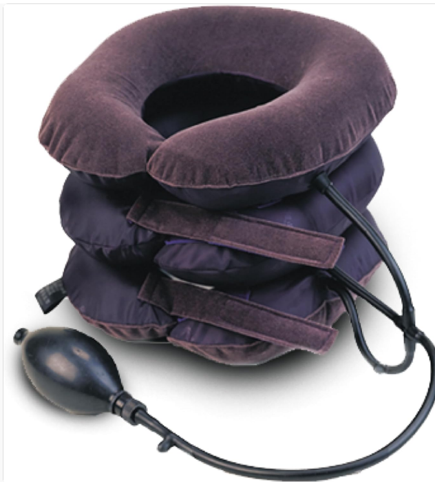
Image: The Dr-Ho's Neck Comforter, showing the inflatable collar and attached hand pump with tubing.