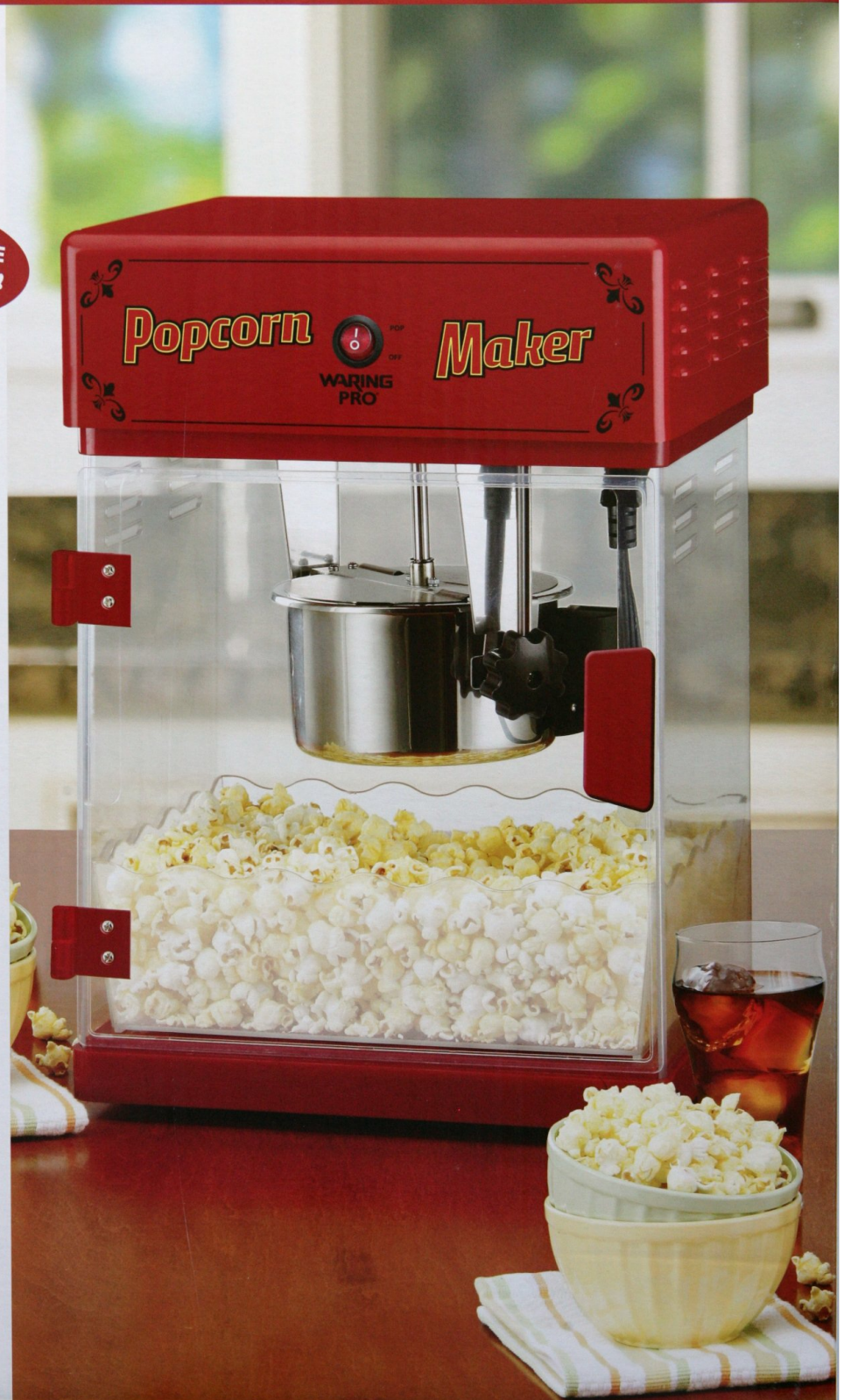
Figure 1: Waring Pro Professional Popcorn Maker (Model PCM55PC)