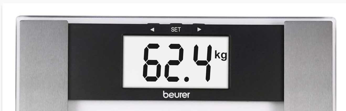
Image 3.1: Close-up of the XXL display showing a weight reading of 62.4 kg.