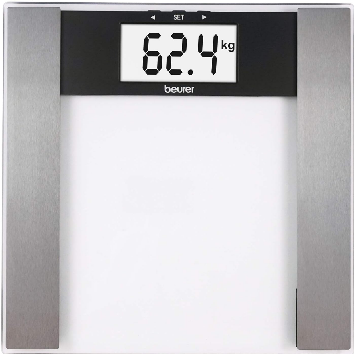
Image 1.1: The Beurer BG 17 Glass Body Analysis Scale, showcasing its sleek design and large display.