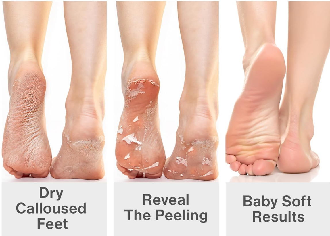
Figure 4: Visual timeline of the Baby Foot exfoliation process, from dry feet to soft results.