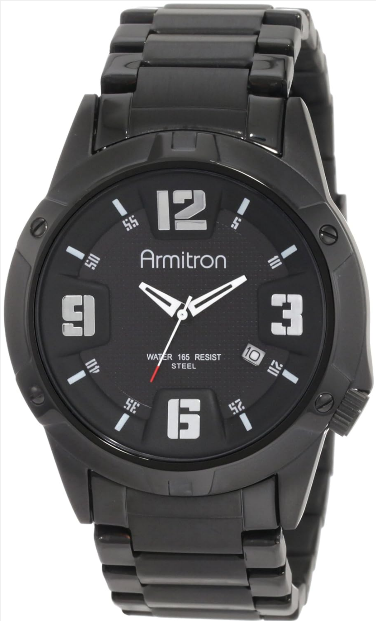
Figure 1: Front view of the Armitron 204692BKT1 watch, showcasing its black dial with silver-toned numerals and black-plated stainless steel bracelet.