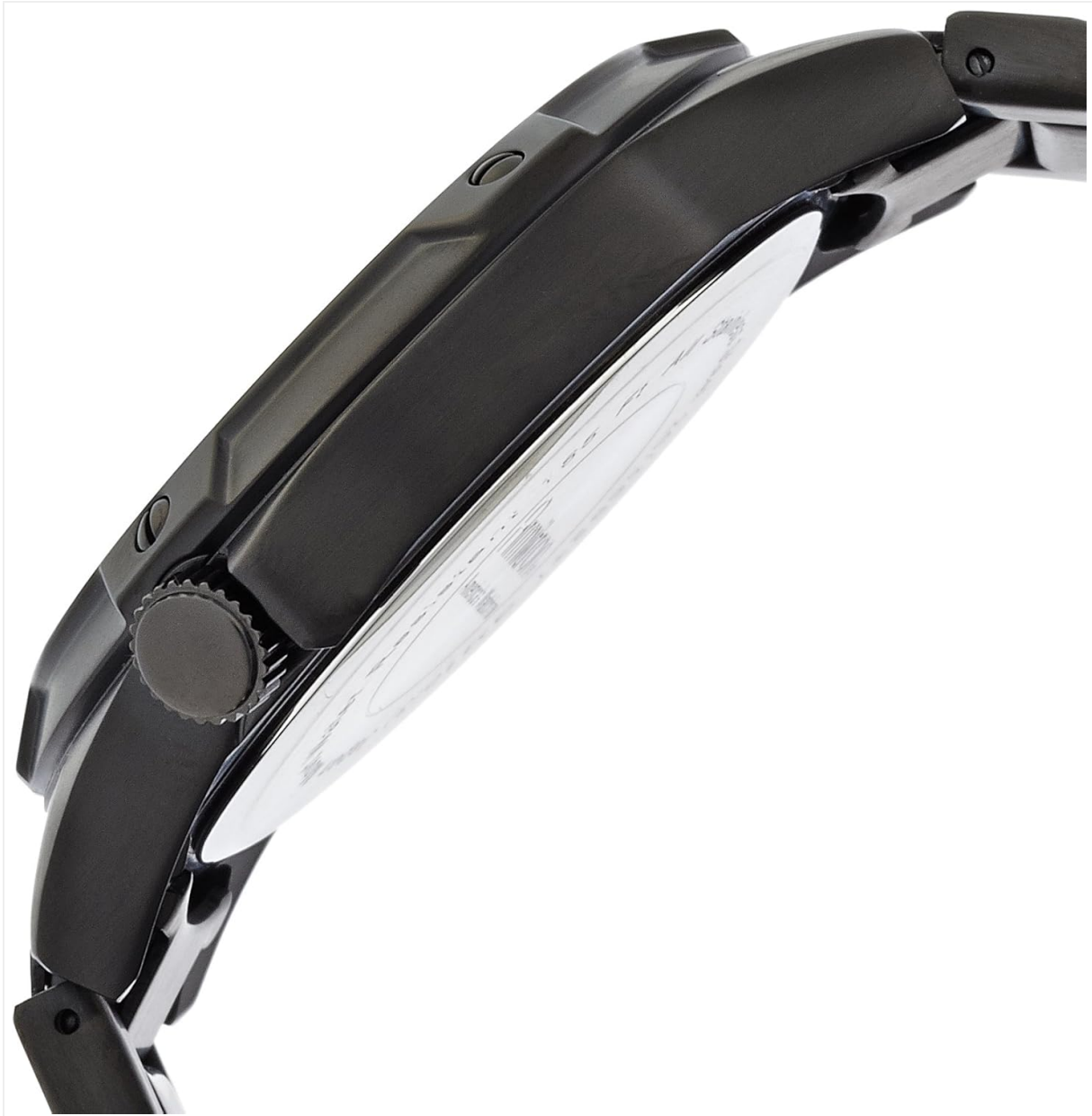
Figure 2: Side view of the watch, highlighting the crown used for time and date adjustments.