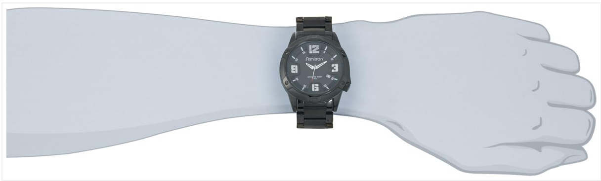
Figure 4: The Armitron 204692BKT1 watch worn on a wrist, demonstrating its fit and appearance.