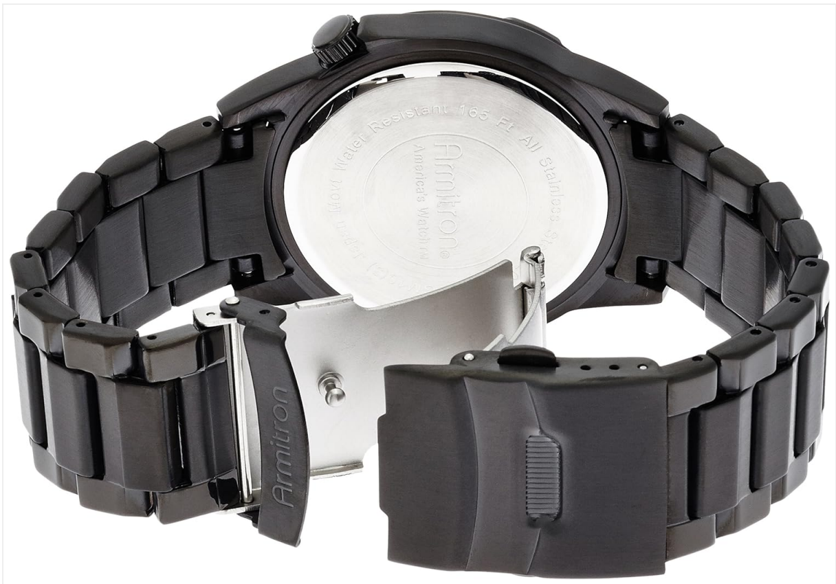
Figure 3: Rear view of the watch, displaying the fold-over push-button clasp with safety mechanism.