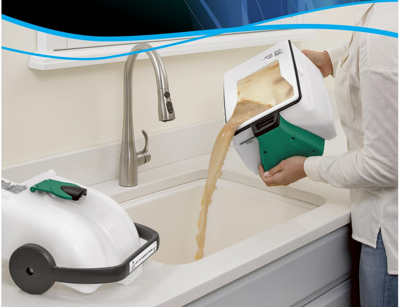
Figure 5.1: Emptying the dirty water tank after cleaning.