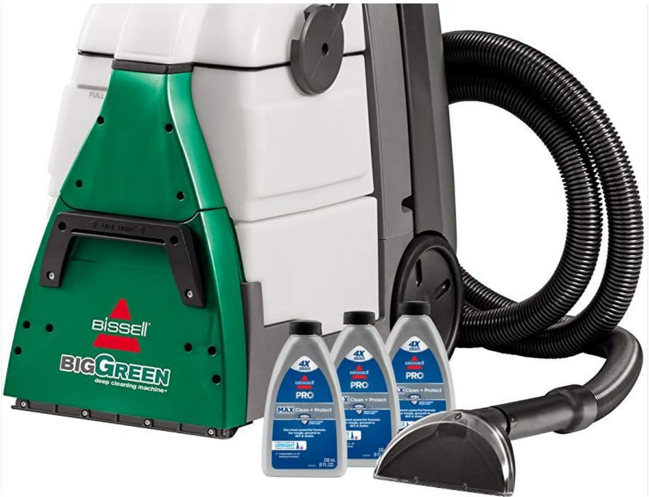
Figure 2.1: Main unit of the BISSELL Big Green Professional Carpet Cleaner with included accessories.