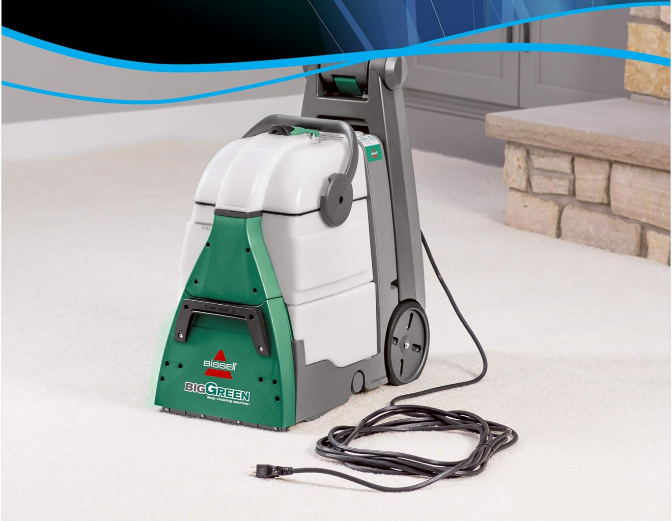
Figure 3.2: The long power cord provides extended reach for cleaning.