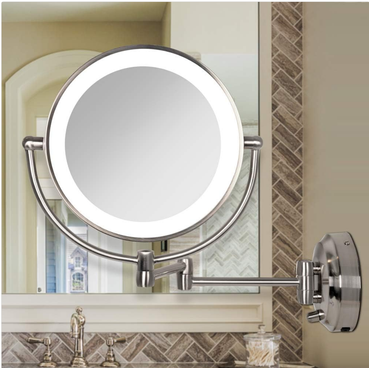
Figure 3: Illuminated LED mirror for optimal visibility.