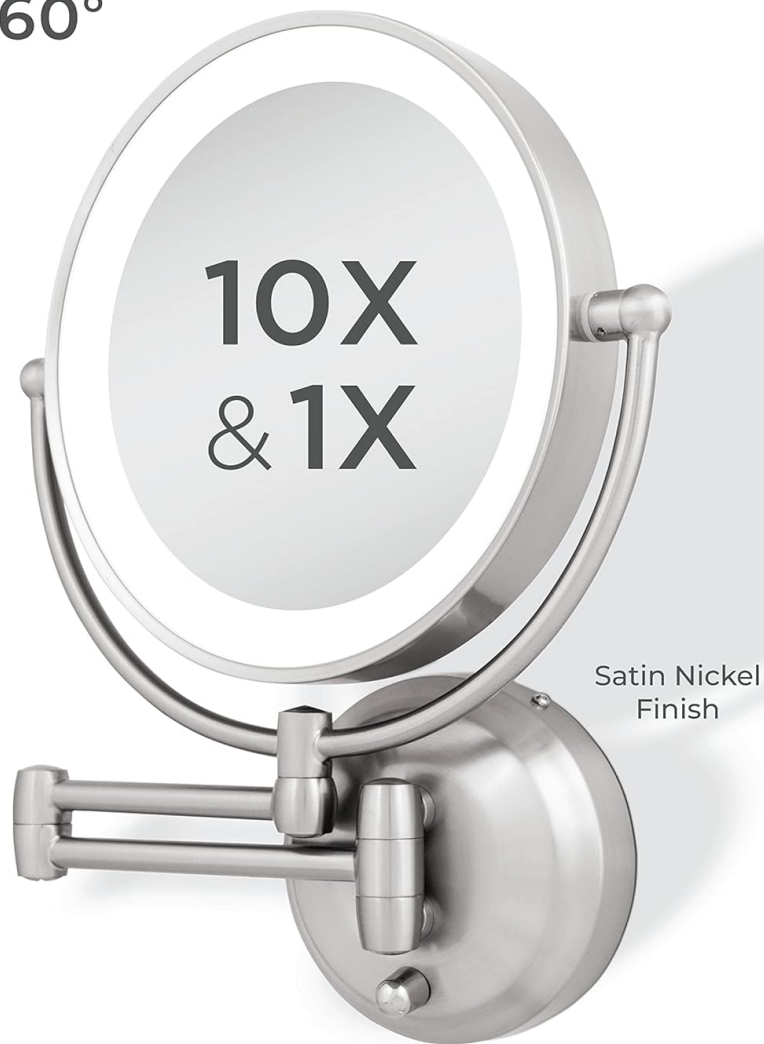
Figure 4: Mirror extended for user convenience.