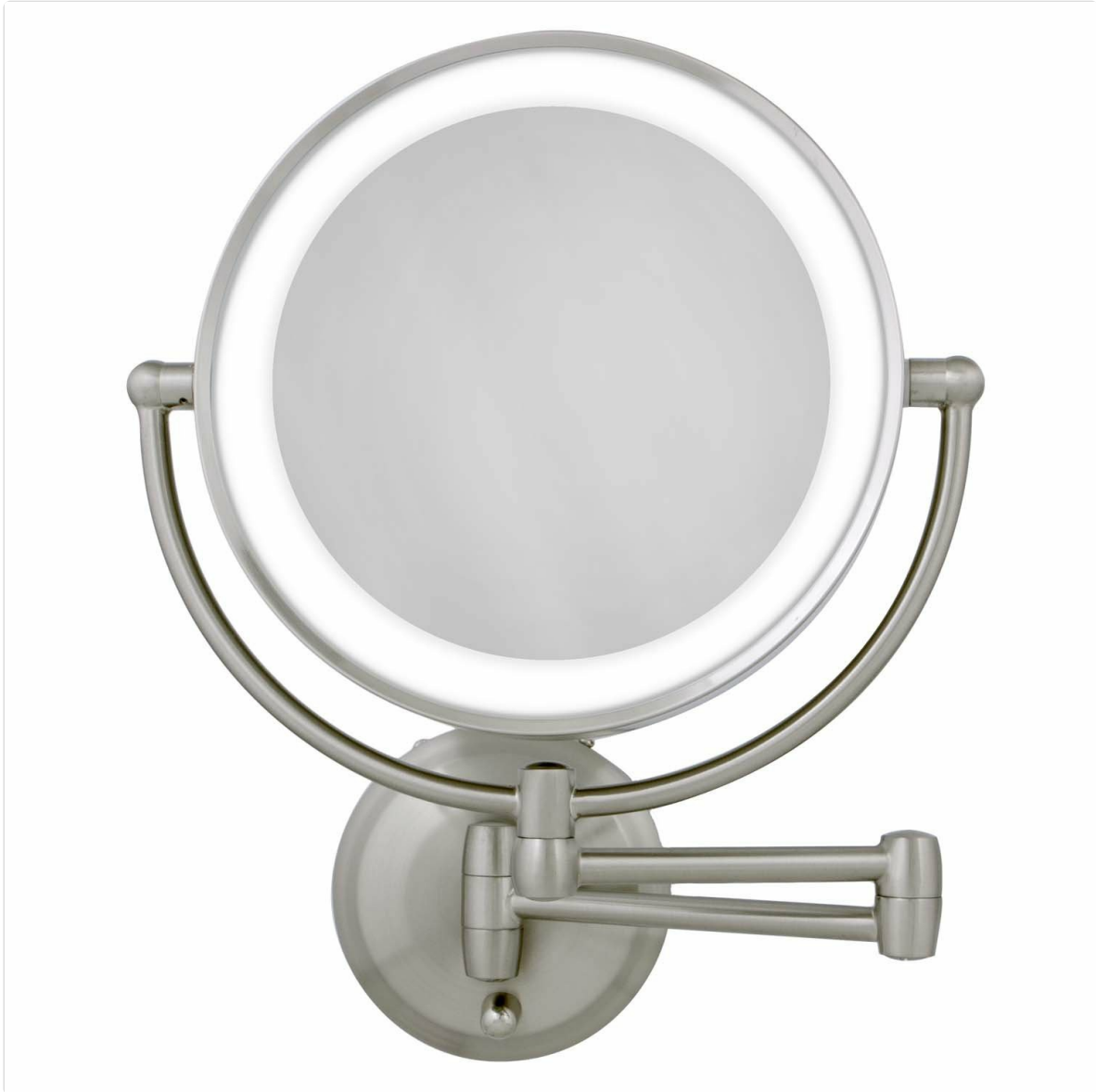
Figure 1: Zadro 11" LED Wall Mounted Makeup Mirror, fully extended.