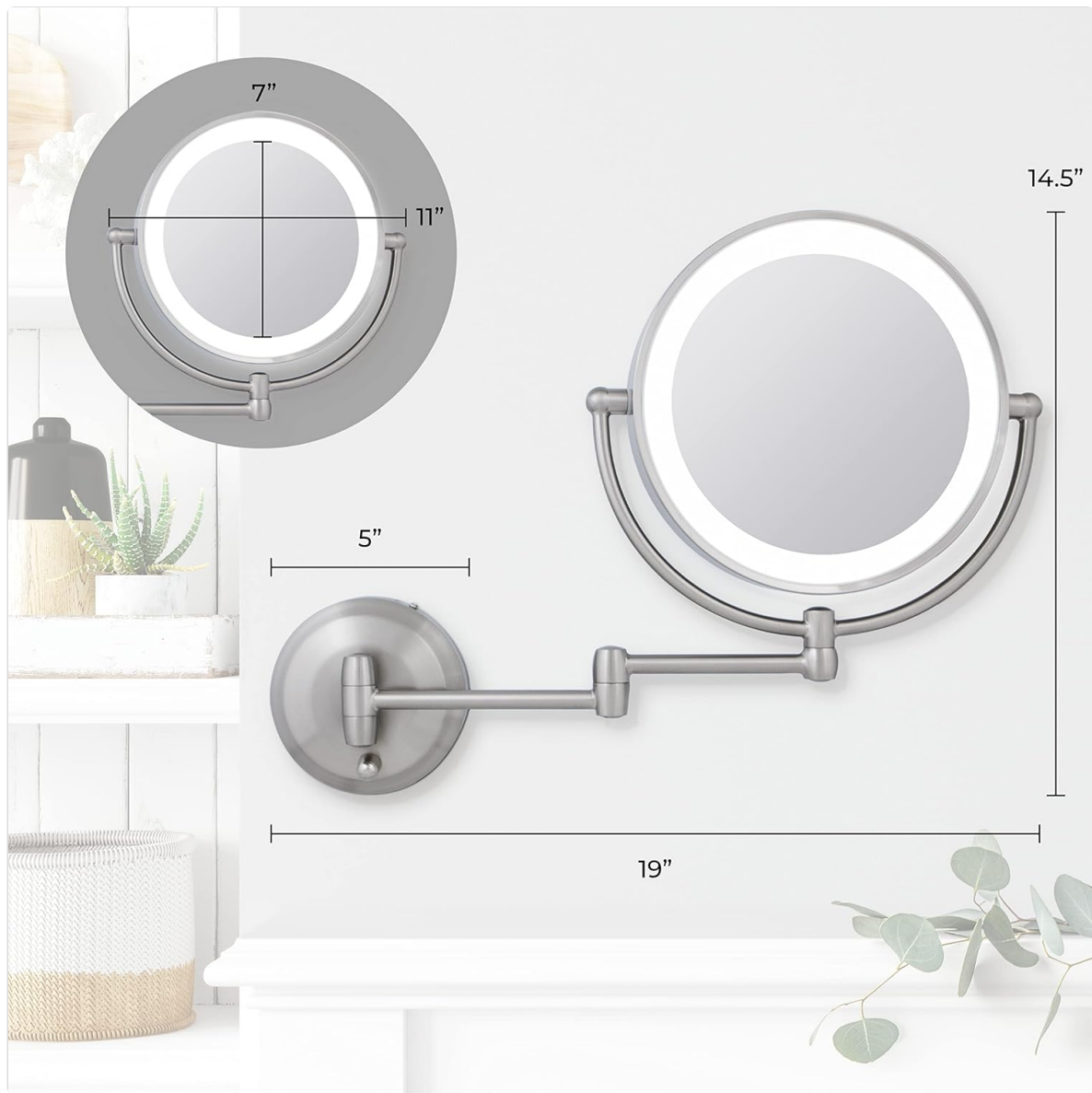
Figure 2: Product dimensions and extension capabilities.