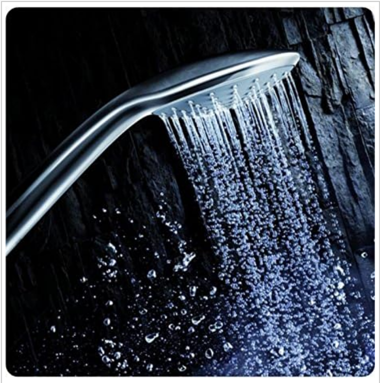
Image 5.1: The GROHE Euphoria Mono Shower Head delivering a consistent and refreshing spray pattern during use.