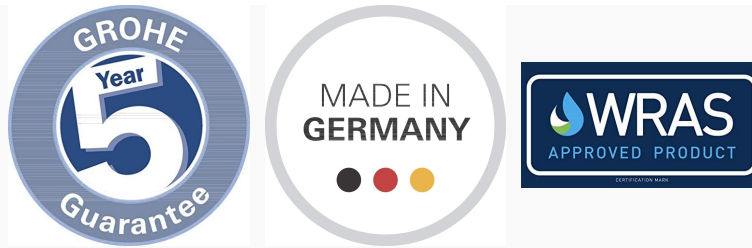
Image 9.1: Logos indicating the GROHE 5-Year Guarantee, 'Made in Germany' origin, and WRAS Approved Product certification.