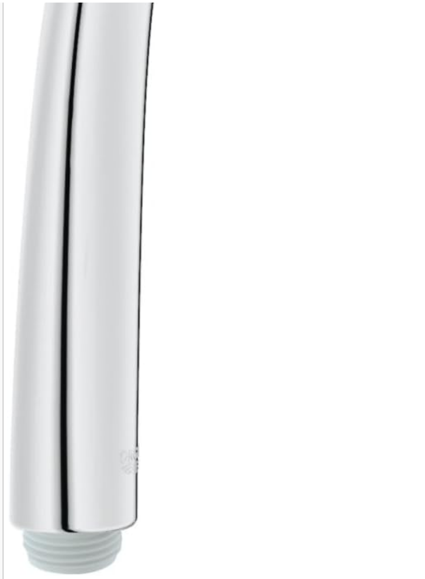
Image 1.1: Front view of the GROHE Euphoria Mono Shower Head, showcasing its polished chrome finish and single spray plate.