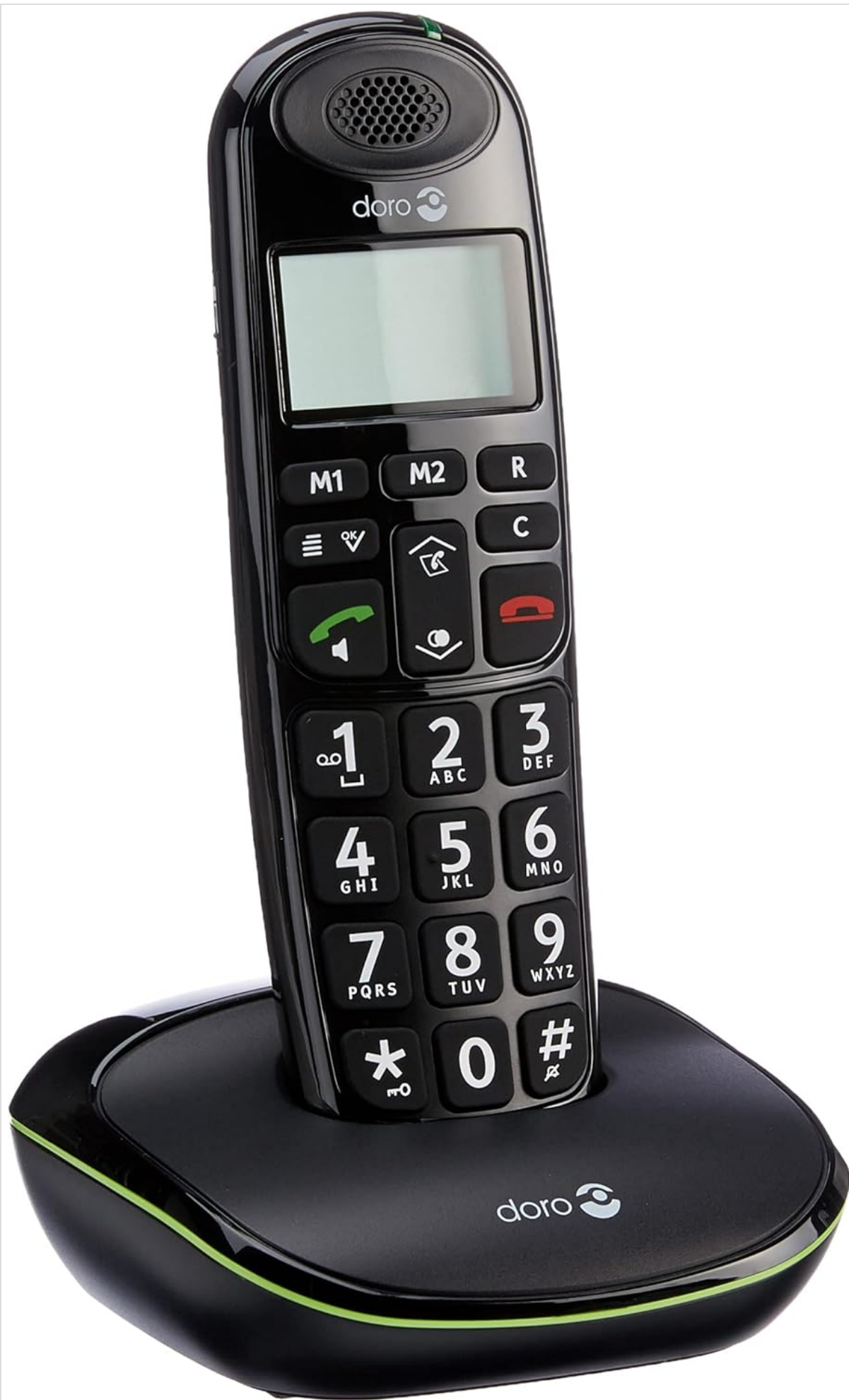
Figure 2: Handset correctly placed on the base station for charging.