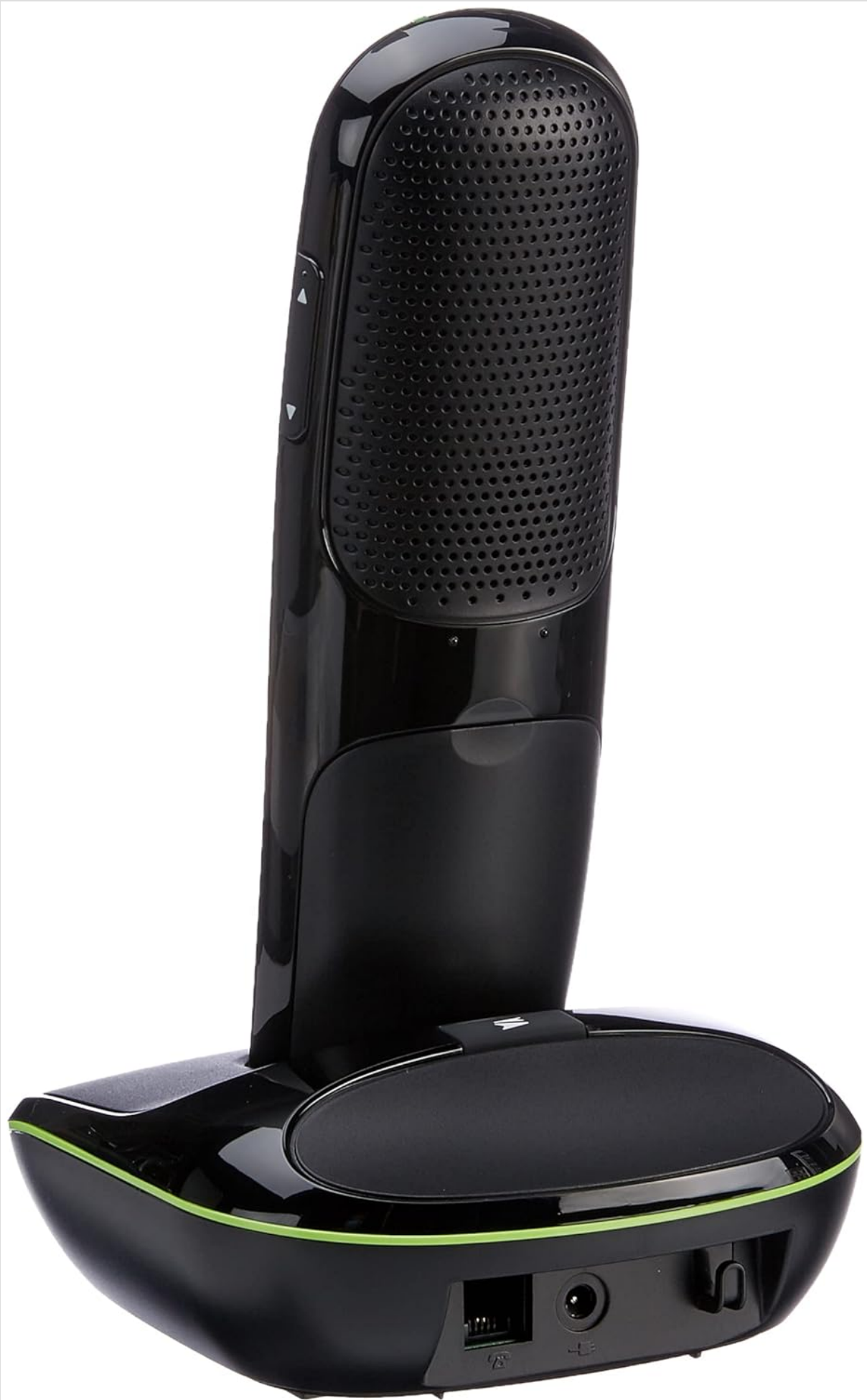
Figure 1: Rear view of the base station showing connection ports.