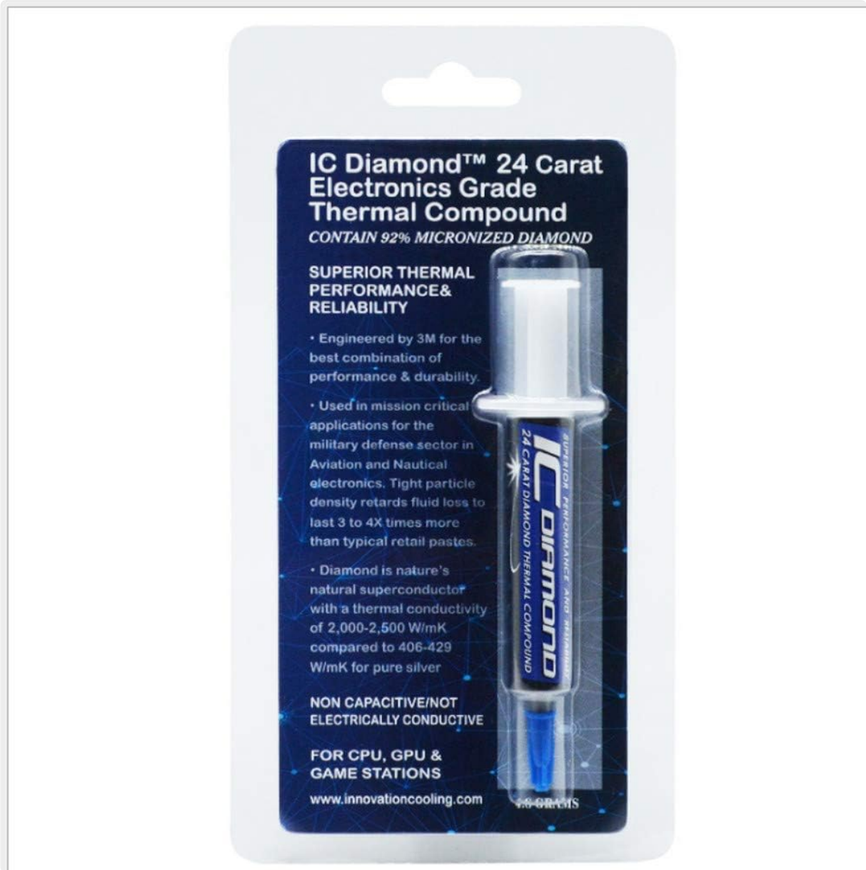
Figure 2.1: IC Diamond 24 Carat Thermal Compound in its retail packaging.