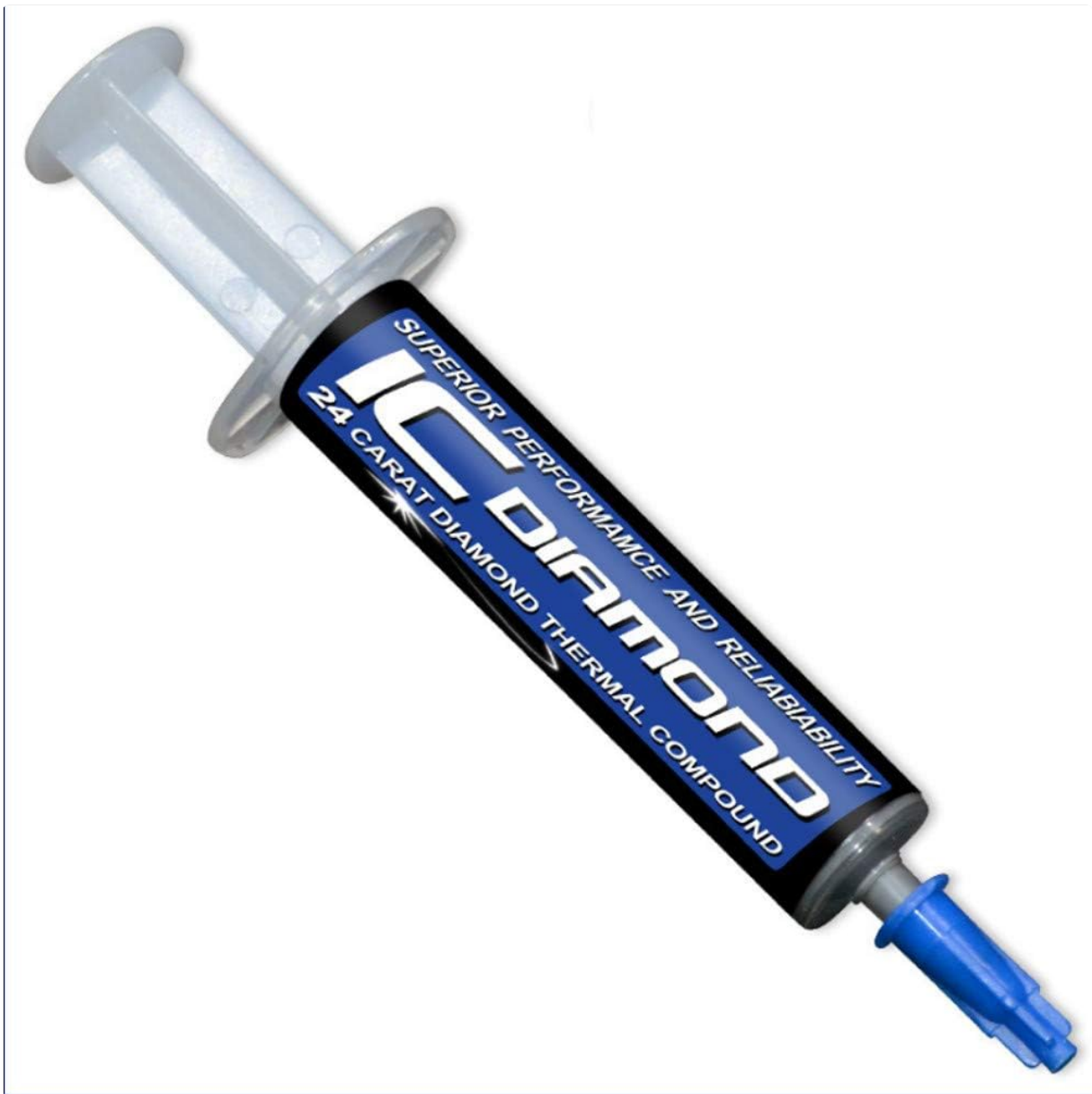
Figure 2.2: The IC Diamond 24 Carat thermal compound syringe.

IC Diamond 24 Carat Thermal Compound is an electronics-grade OEM thermal compound designed for critical heat transfer applications. Key features include: