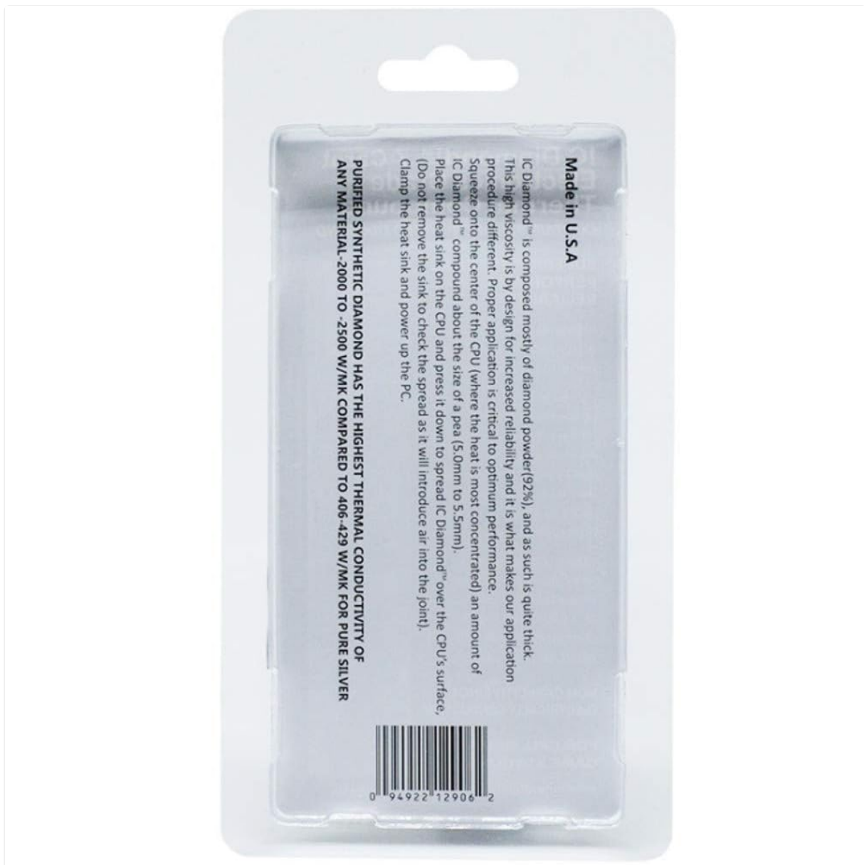
Figure 4.1: Back of the IC Diamond packaging, showing manufacturer's notes on application.

Note from manufacturer's packaging: "IC Diamond™ is composed mostly of diamond powder (92%), and as such is quite thick. This high viscosity is by design for increased reliability and it is what makes our application procedure different. Proper application is critical to optimum performance. Squeeze onto the center of the CPU (where the heat is most concentrated) an amount of IC Diamond™ compound about the size of a pea (5.0mm to 5.5mm). Place the heat sink on the CPU and press it down to spread IC Diamond™ over the CPU's surface. (Do not remove the sink to check the spread as it will introduce air into the joint). Clamp the heat sink and power up the PC."