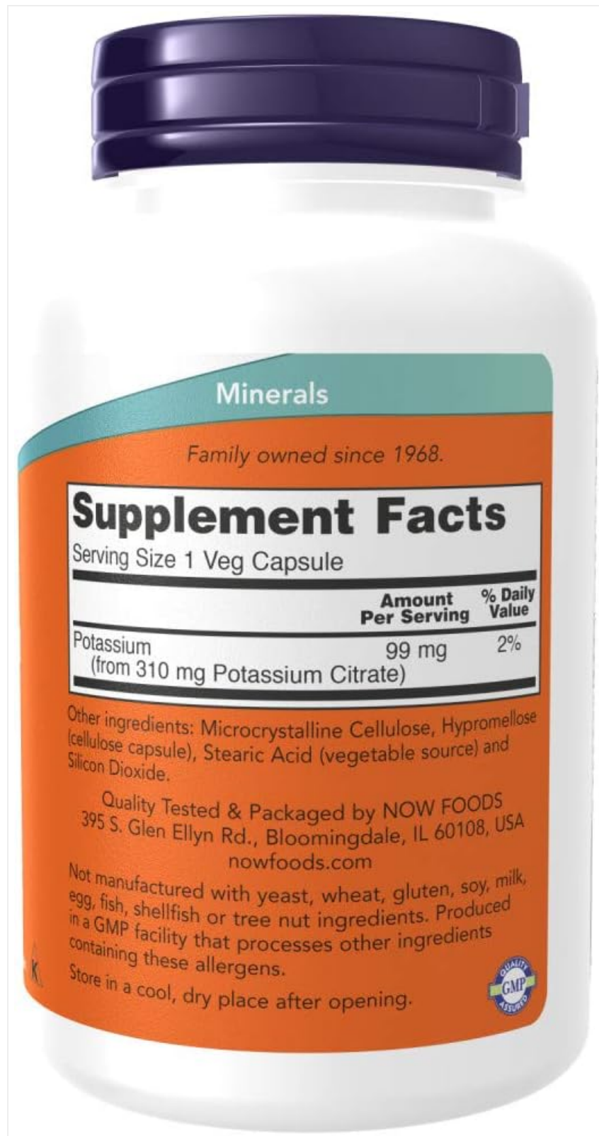
Image: Supplement Facts panel detailing potassium content and other ingredients.