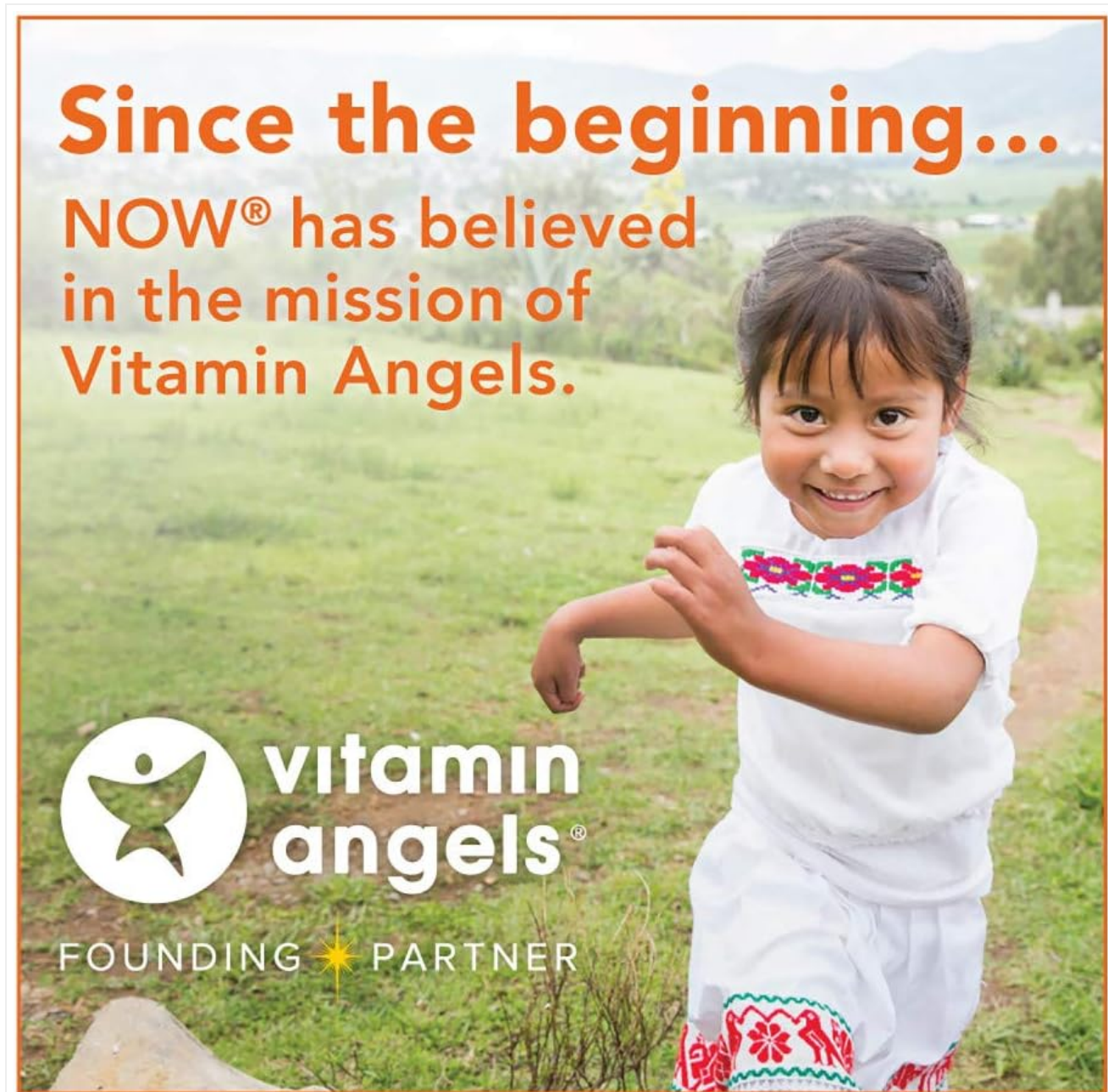
Image: Information about NOW Foods' partnership with Vitamin Angels.

Visit the official NOW Foods website for more information: www.nowfoods.com