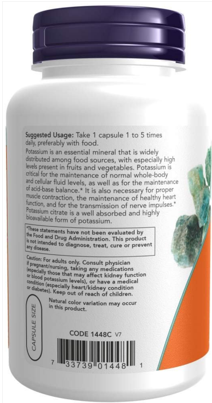
Image: Back label of the product bottle, displaying suggested usage and safety warnings.