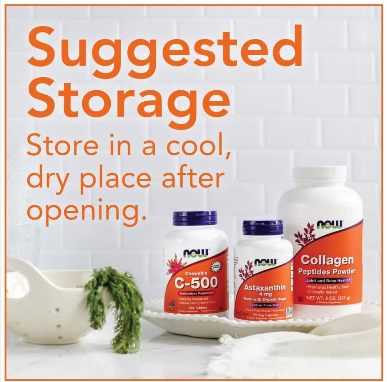
Image: Visual reminder for proper storage conditions.