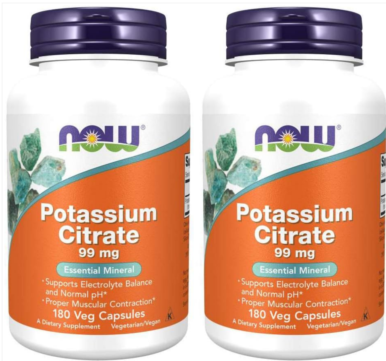
Image: Front view of NOW Foods Potassium Citrate 99 mg capsules, showing two bottles.