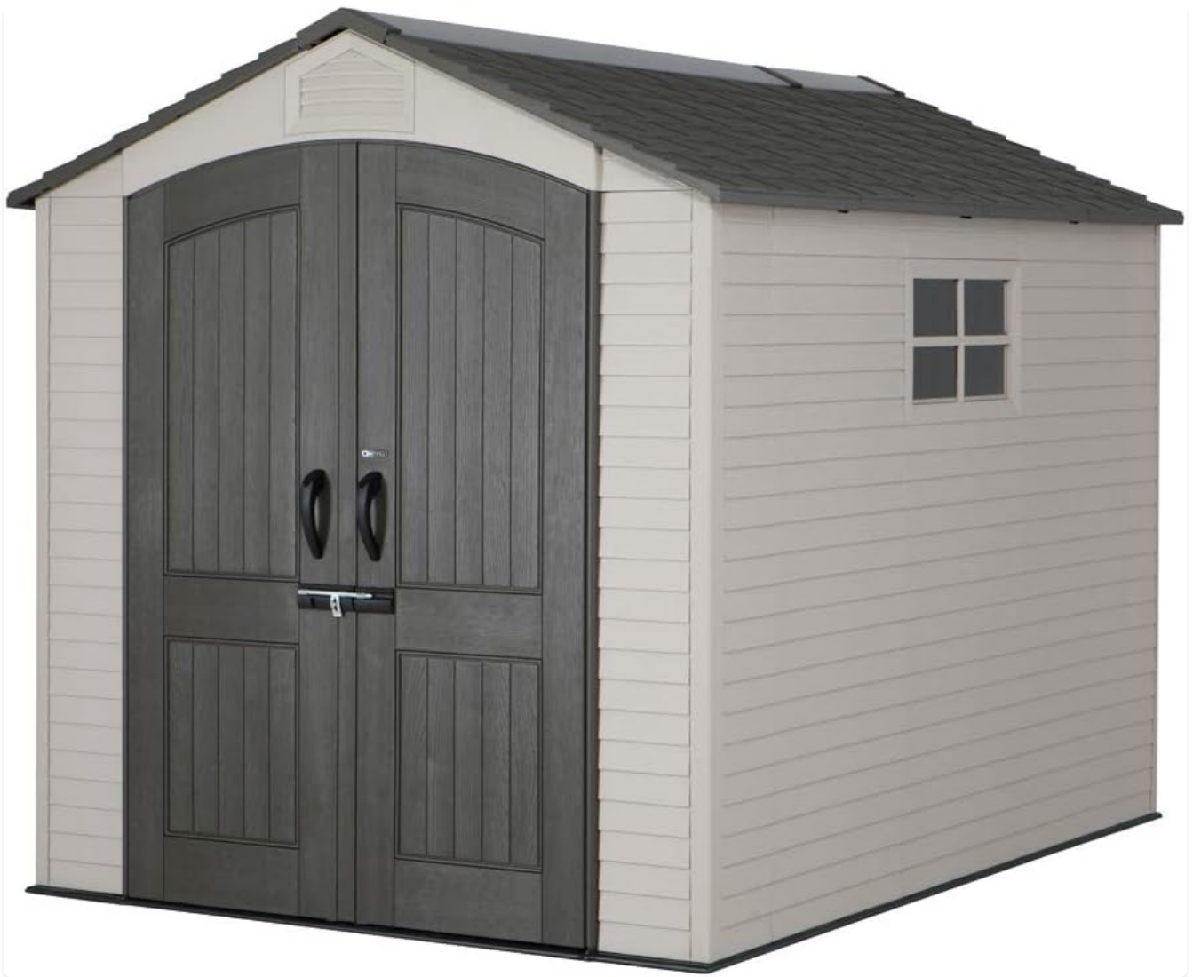
Figure 1: Exterior view of the Lifetime 7' x 7' Outdoor Storage Shed.