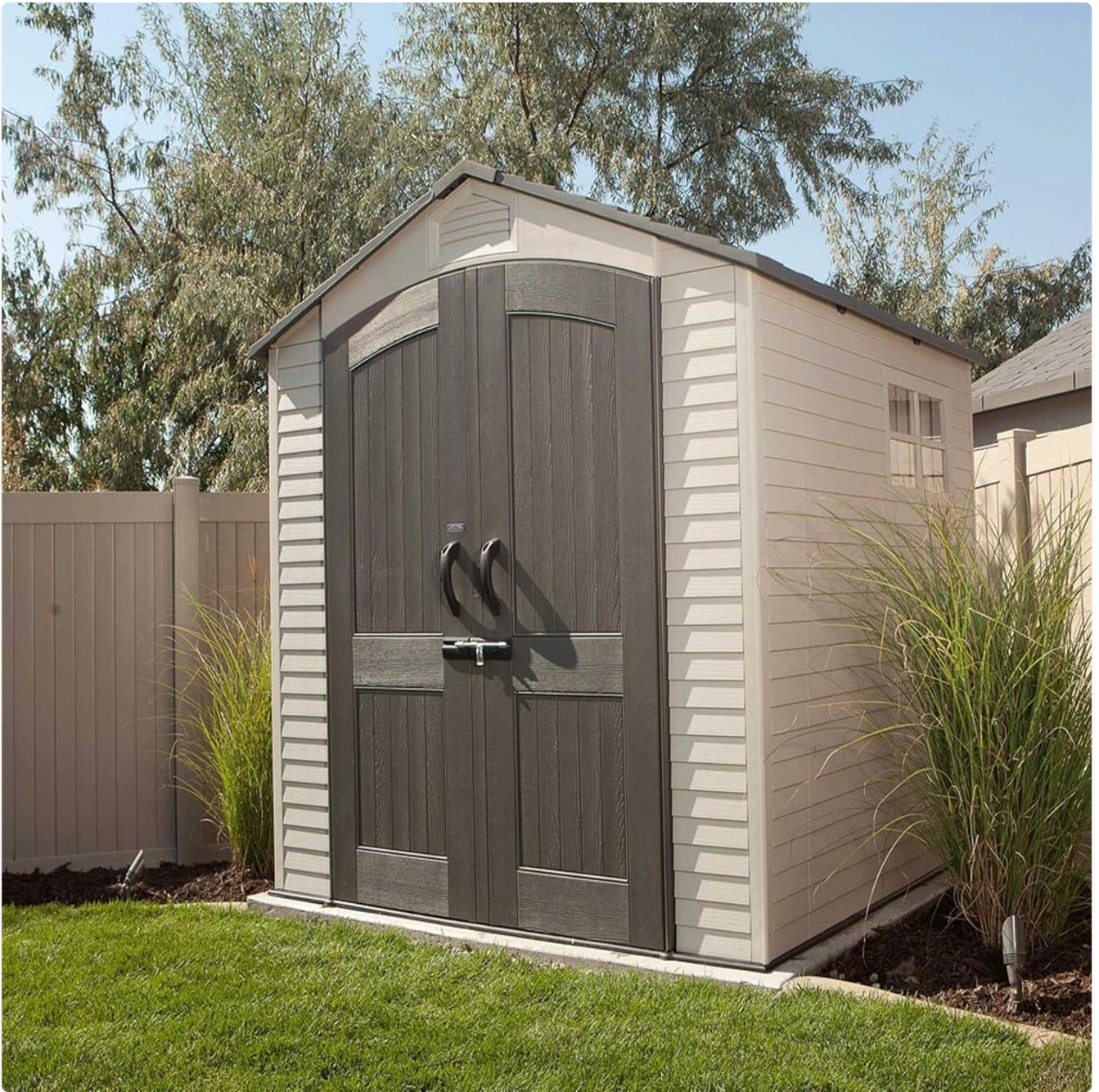
Figure 3: The shed's design blends well with outdoor environments.