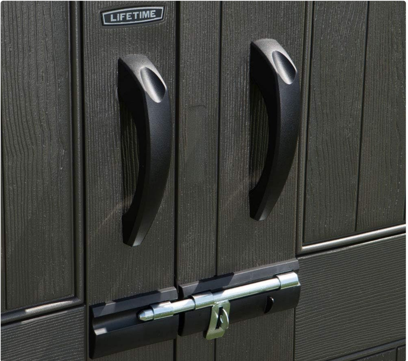
Figure 6: Secure door latch mechanism.

The shed features single-hinged double doors that open nearly 180 degrees, providing a wide opening for easy access. The steel-reinforced doors include an exterior padlock loop for enhanced security (padlock not included).