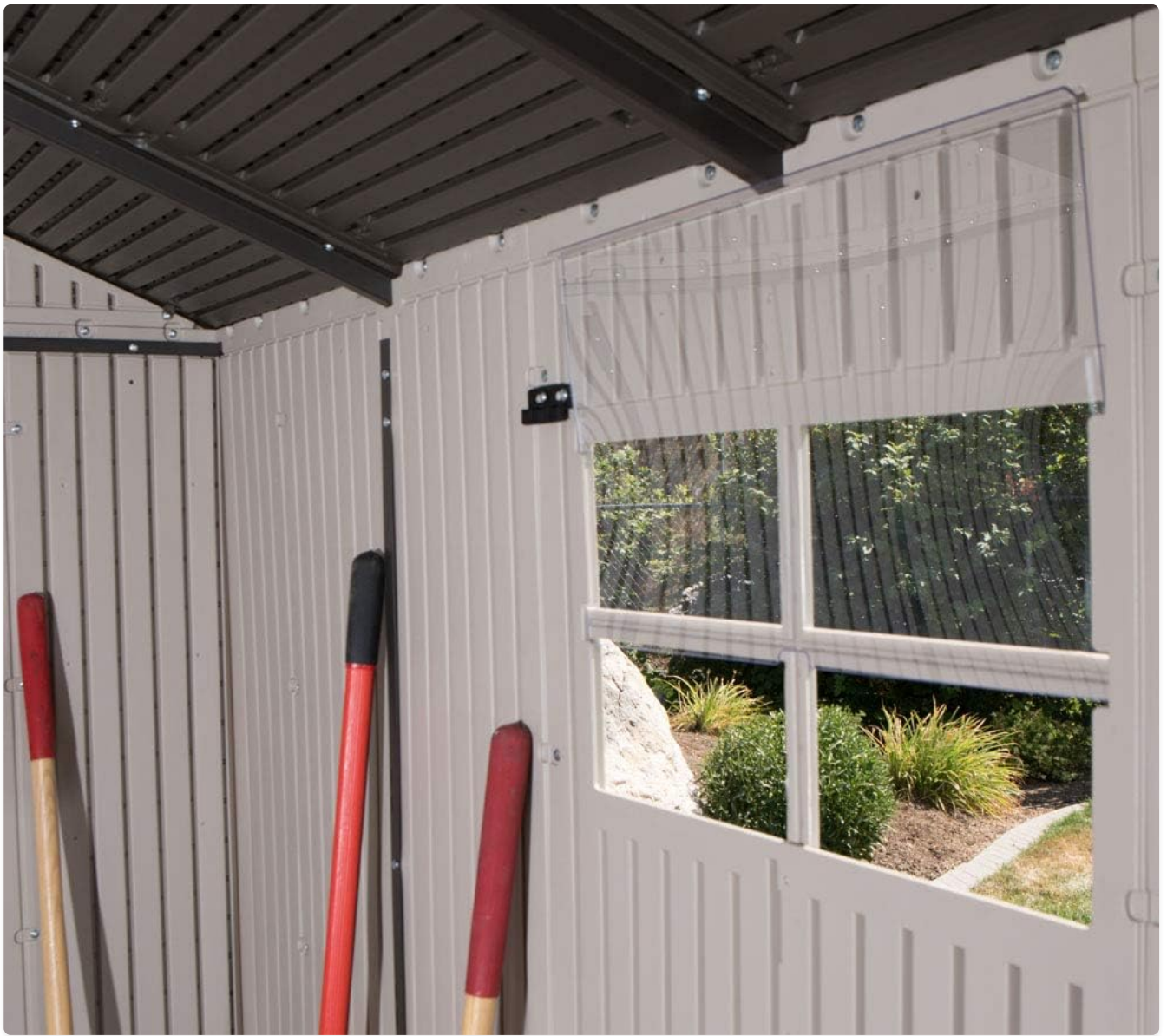
Figure 8: Interior window for natural light.