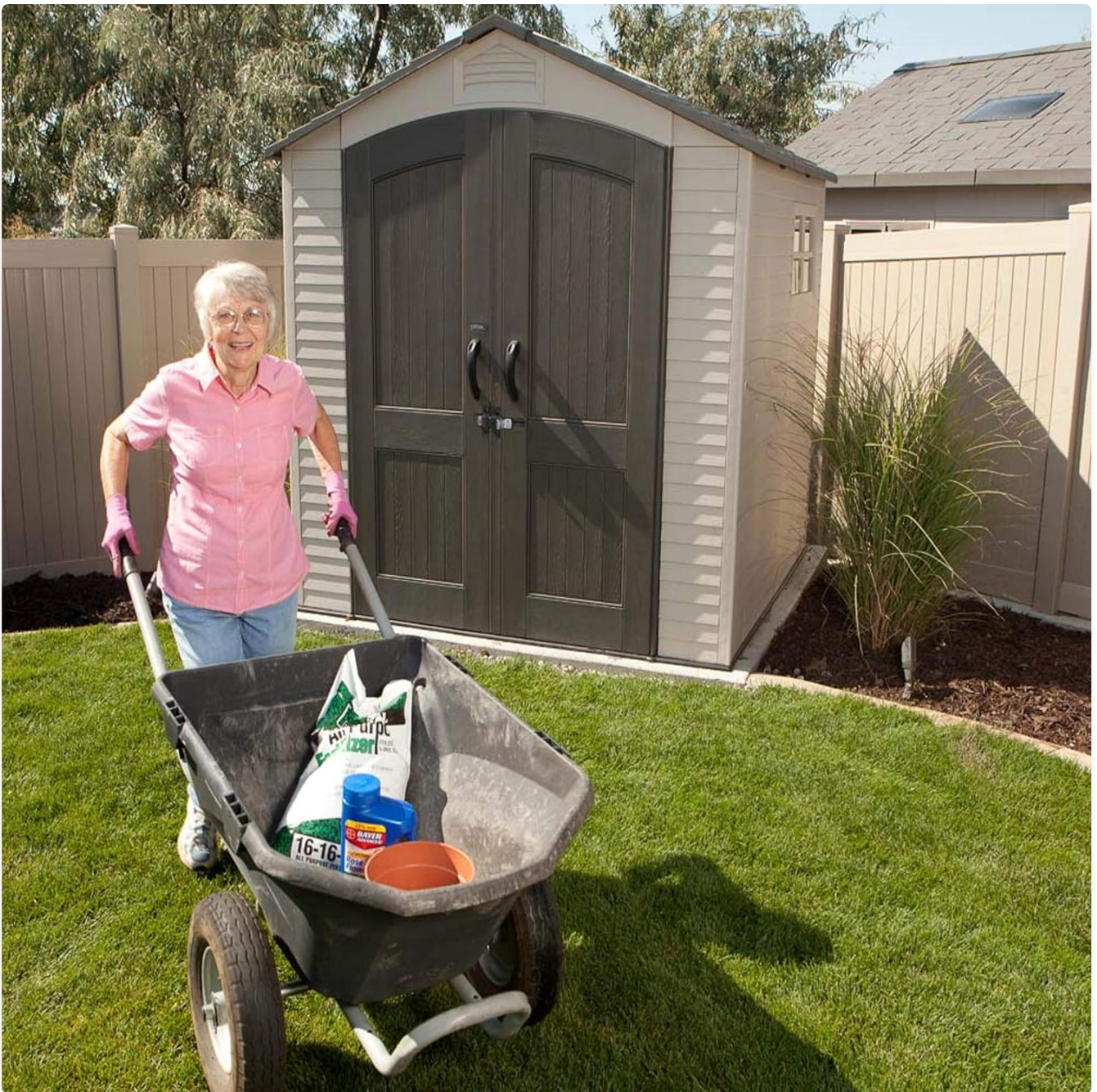
Figure 7: Wide-opening double doors for easy access.