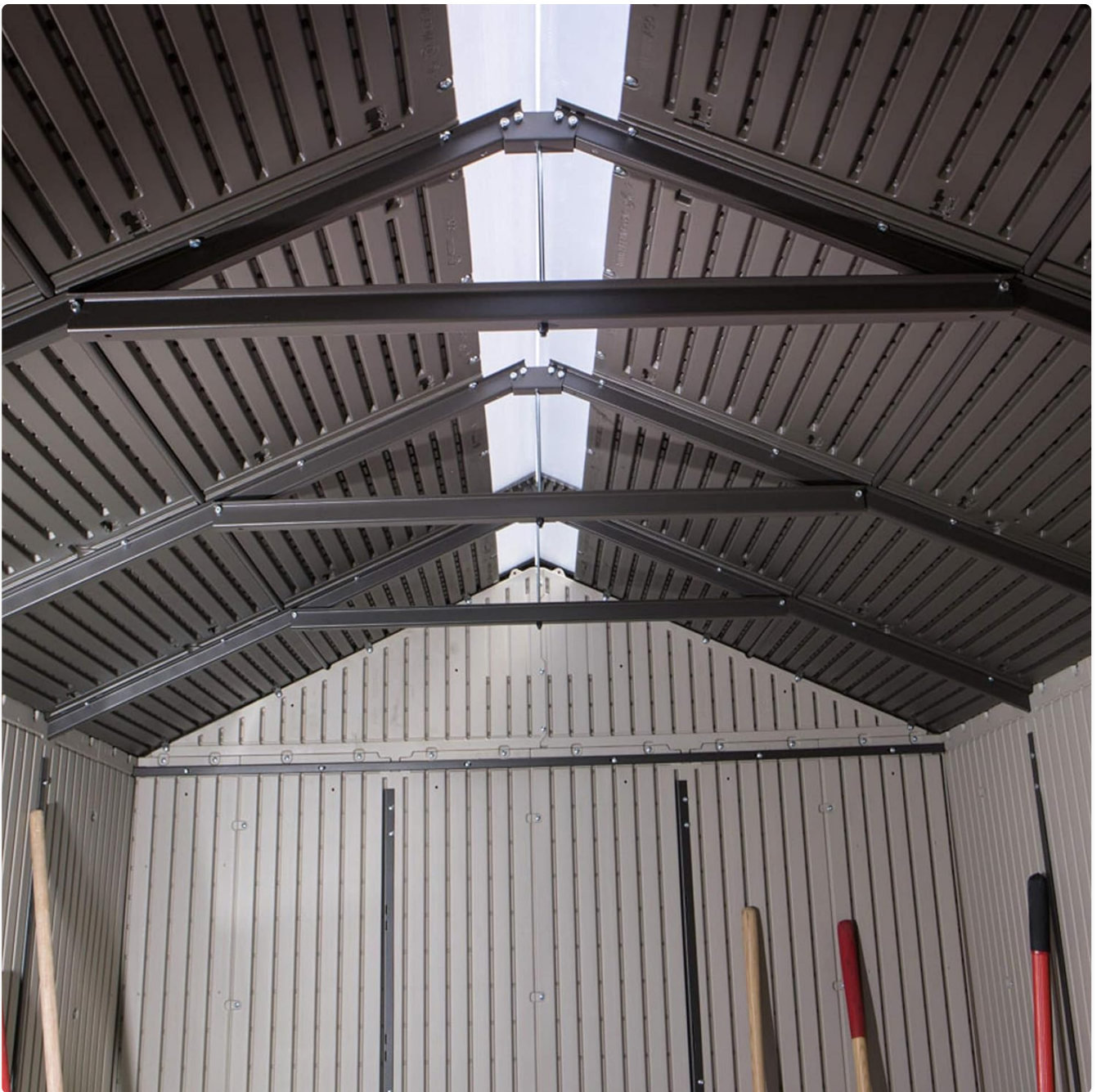
Figure 9: Full-length skylight for interior illumination.

For organization, the shed includes one 30 in. x 10 in. shelf and two corner shelves. The interior walls are designed to accommodate additional shelving or hooks for various tools and equipment, allowing for customizable storage solutions.