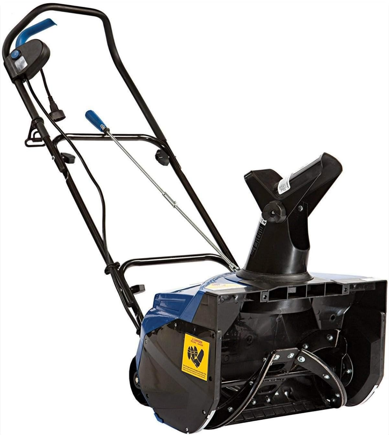
Figure 1: Front view of the Snow Joe Ultra SJ620 Electric Snow Thrower.