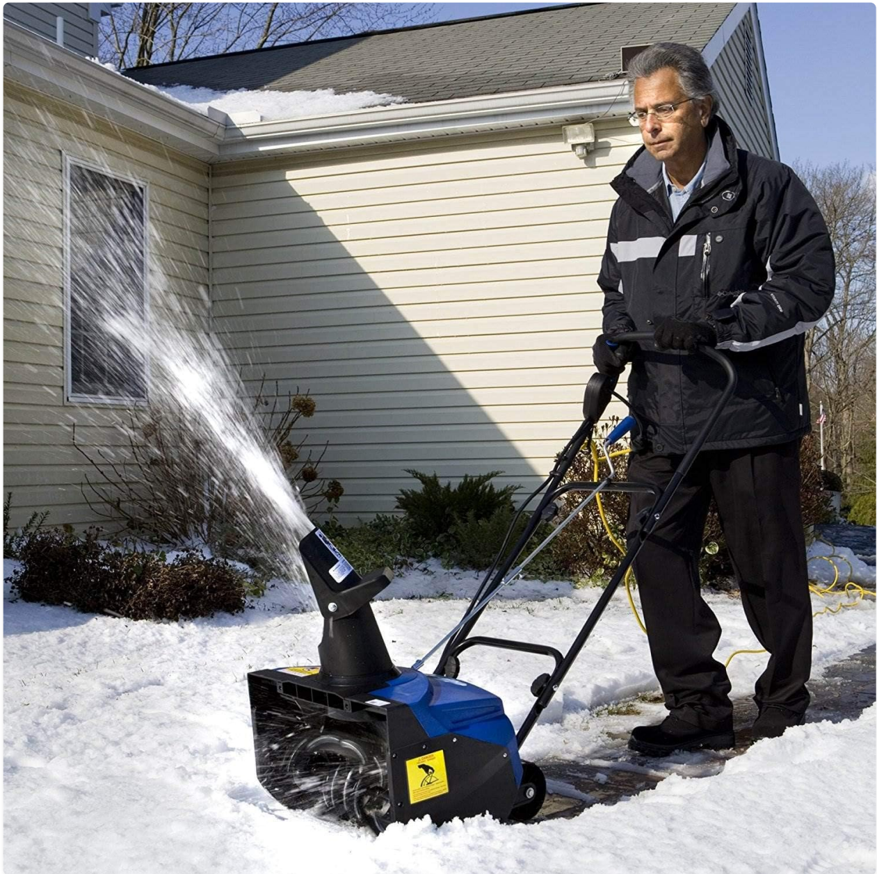
Figure 2: A person operating the Snow Joe Ultra SJ620 electric snow thrower, clearing snow from a paved surface.

rotates 180 degrees, allowing precise control over snow direction and height.