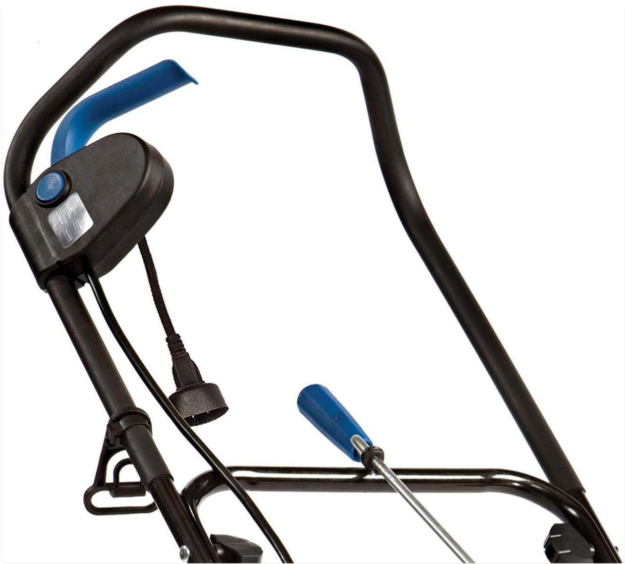
Figure 3: Close-up of the Snow Joe Ultra SJ620's handle assembly, showing the power switch and extension cord connection point.