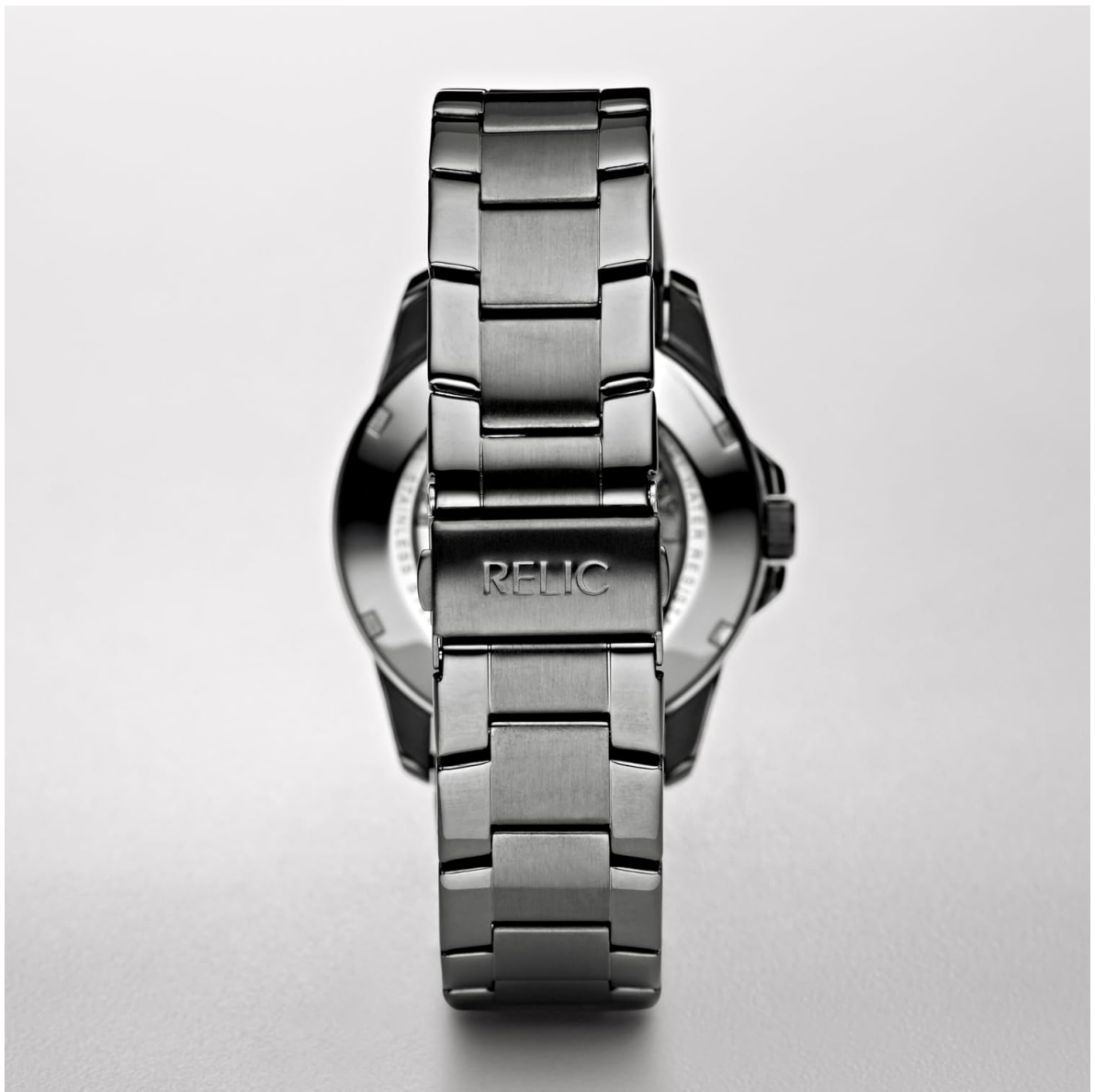
Rear view of the watch, showing the transparent case back that reveals the automatic movement.