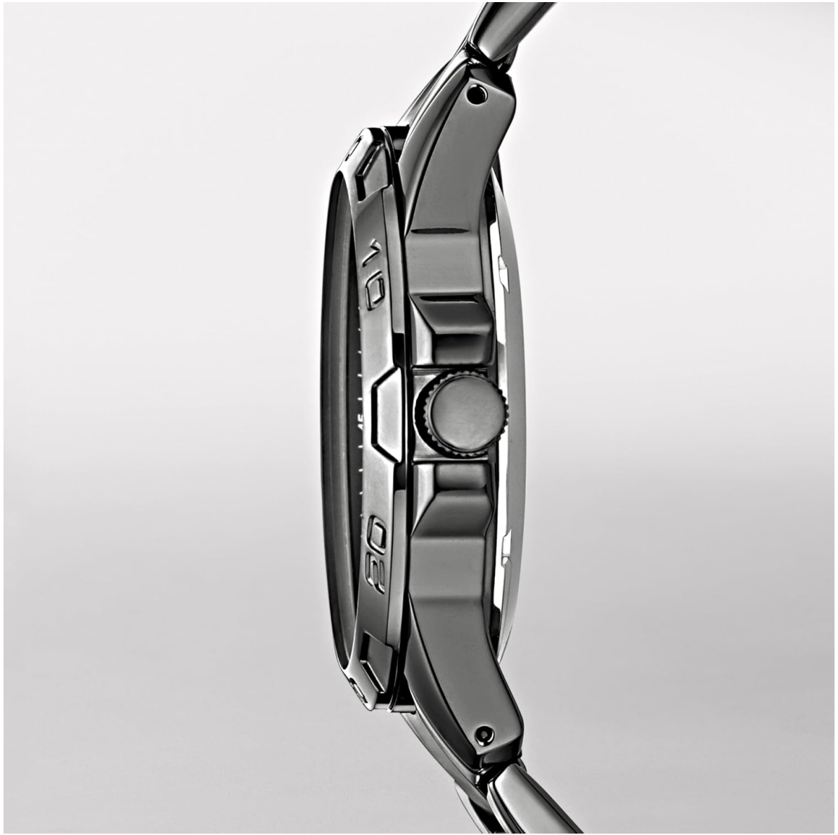
Side profile of the watch, highlighting the crown and case thickness.

Front view of the RELIC Men's Gunmetal Automatic Skeleton Watch, showcasing the intricate skeleton dial.