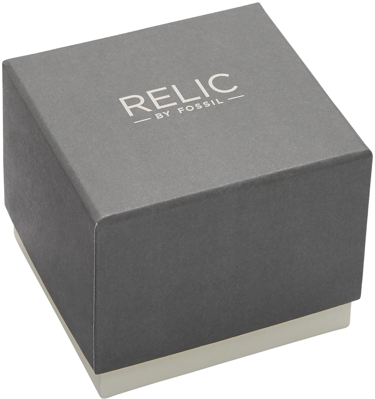
The RELIC branded packaging box for the watch.