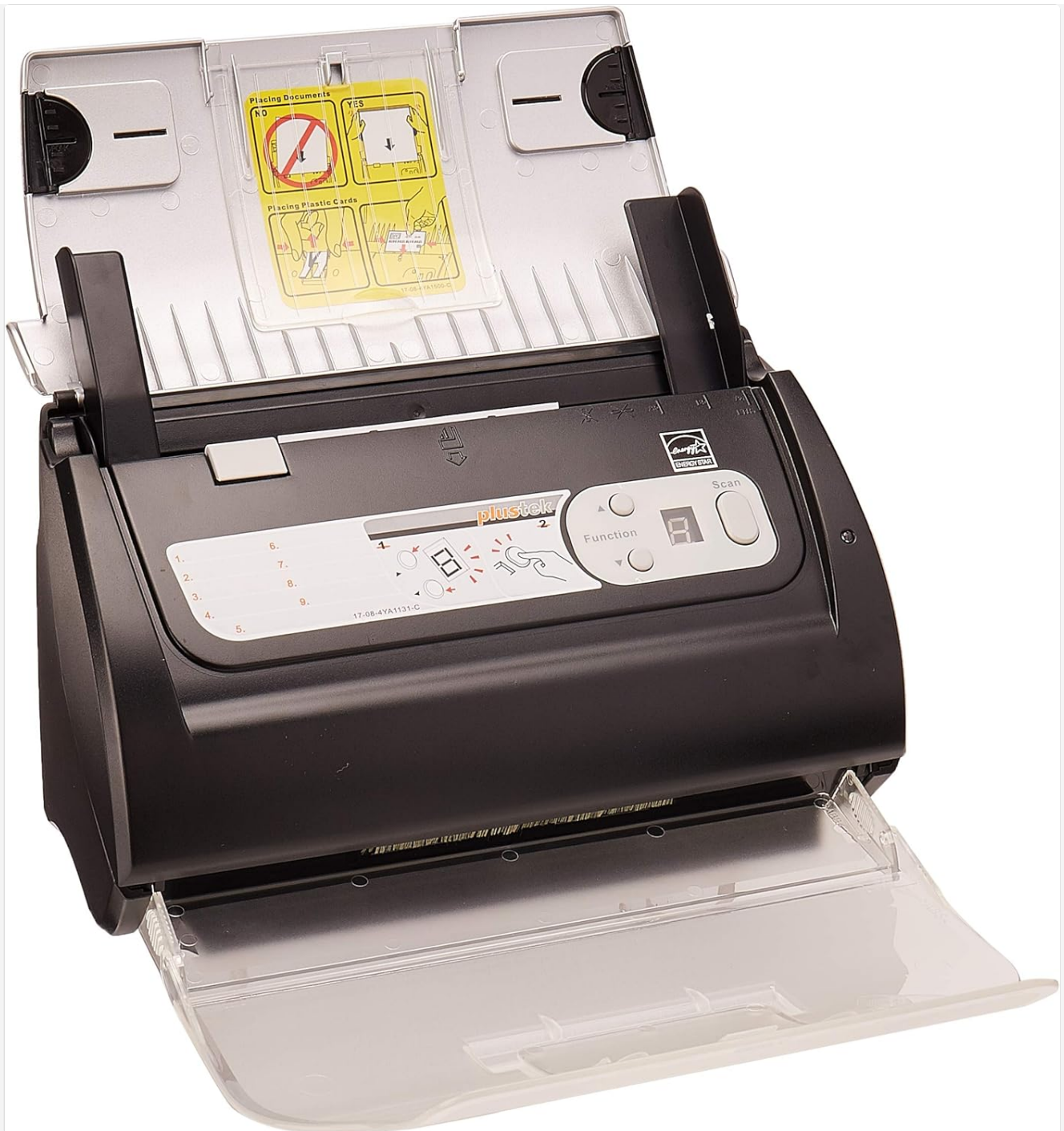
Figure 2.1: Scanner with ADF Open and Output Tray Extended