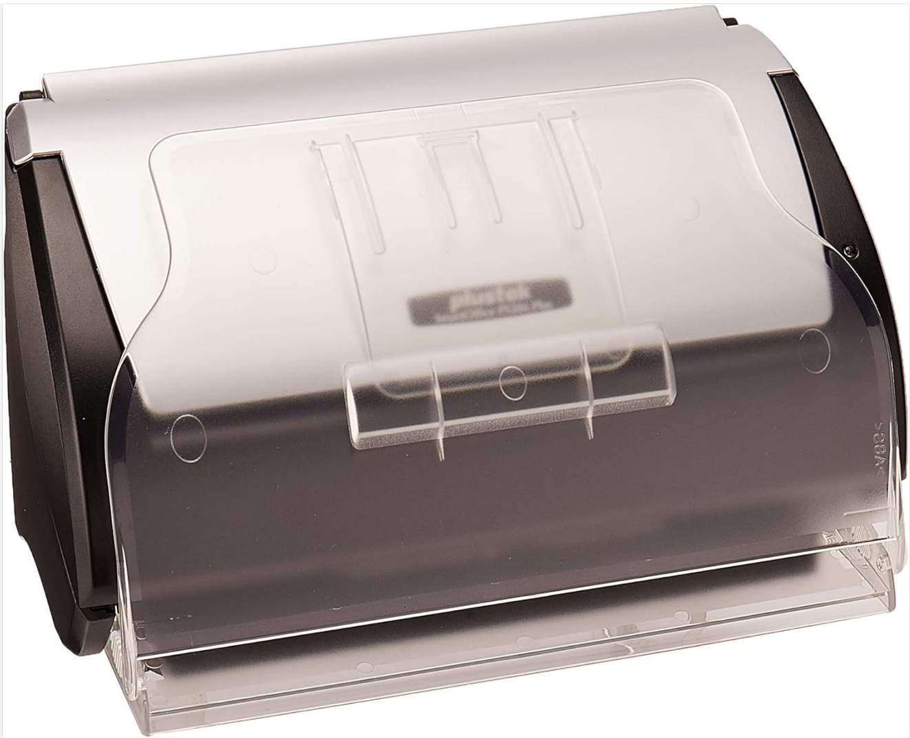
Figure 1.1: Plustek SmartOffice PS286 Plus Document Scanner (Closed)