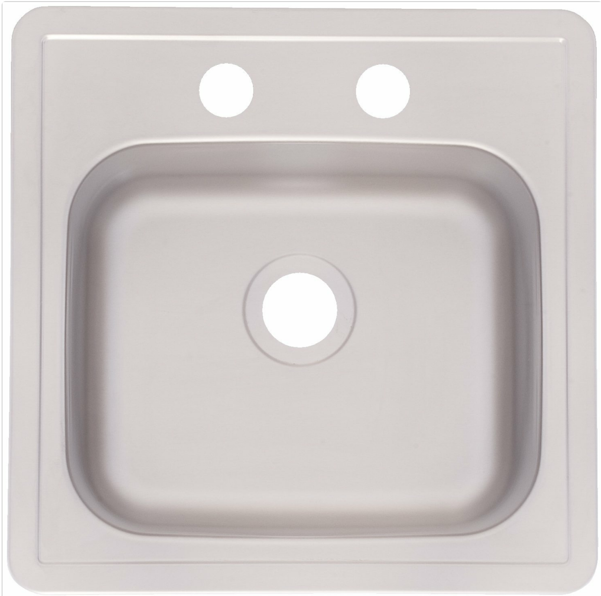
Figure 2: Technical diagram of the FBS602NB sink, illustrating overall dimensions (15" x 15" x 7" deep bowl) and key features like the 2 faucet holes and rear drain location.