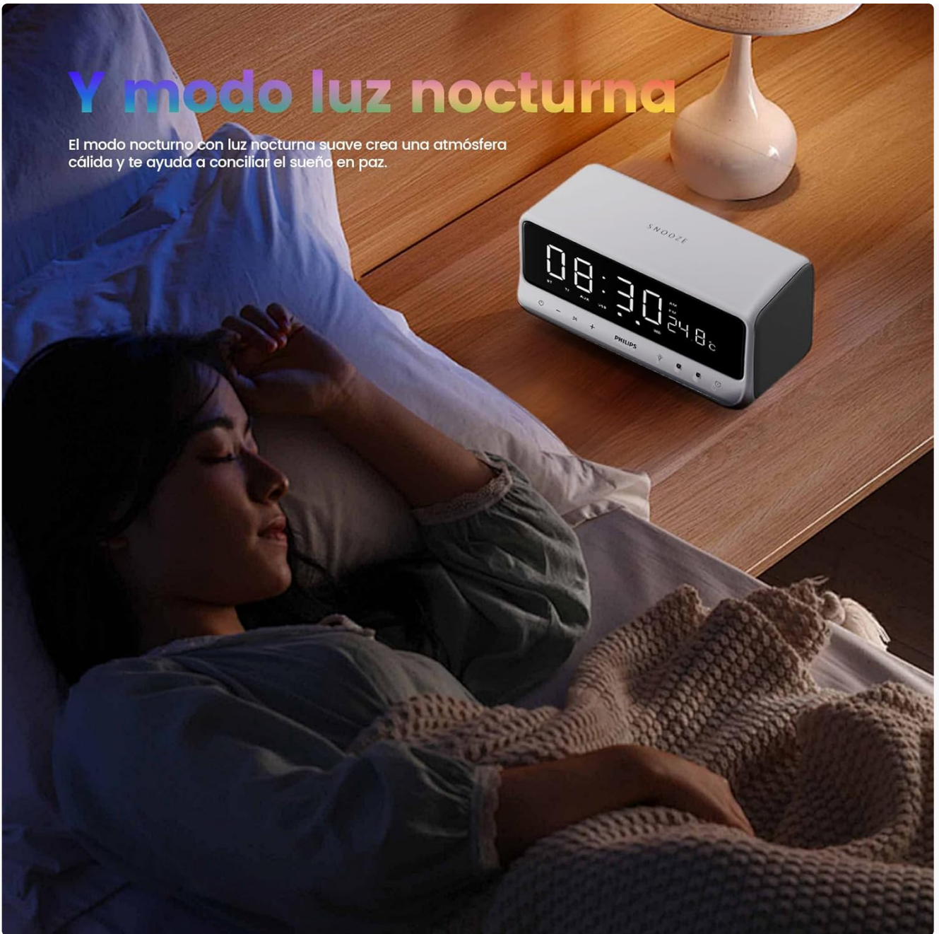
Figure 7: The soft night light feature creates a calming atmosphere for sleep.

El modo nocturno con luz nocturna suave crea una atmósfera cálida y te ayuda a conciliar el sueño en paz.