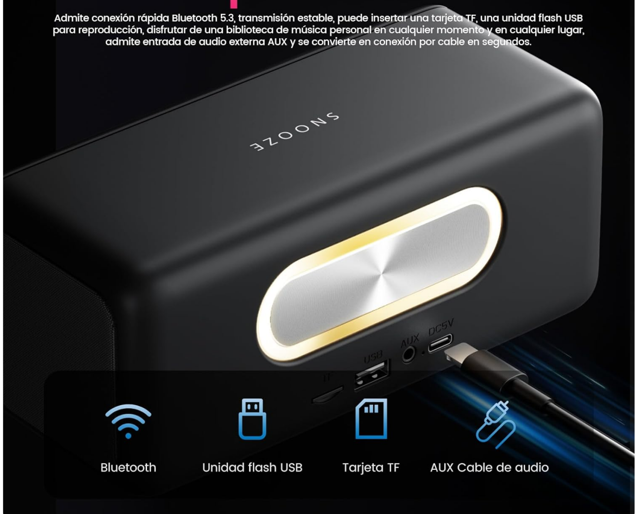
Figure 3: Rear panel with input ports: TF card slot, USB port, AUX input, and DC 5V power input.

Admite conexión rápida Bluetooth 5.3, transmisión estable, puede insertar una tarjeta TF, una unidad flash USB para reproducción, disfrutar de una biblioteca de música personal en cualquier momento y en cualquier lugar, admite entrada de audio externa AUX y se convierte en conexión por cable en segundos.