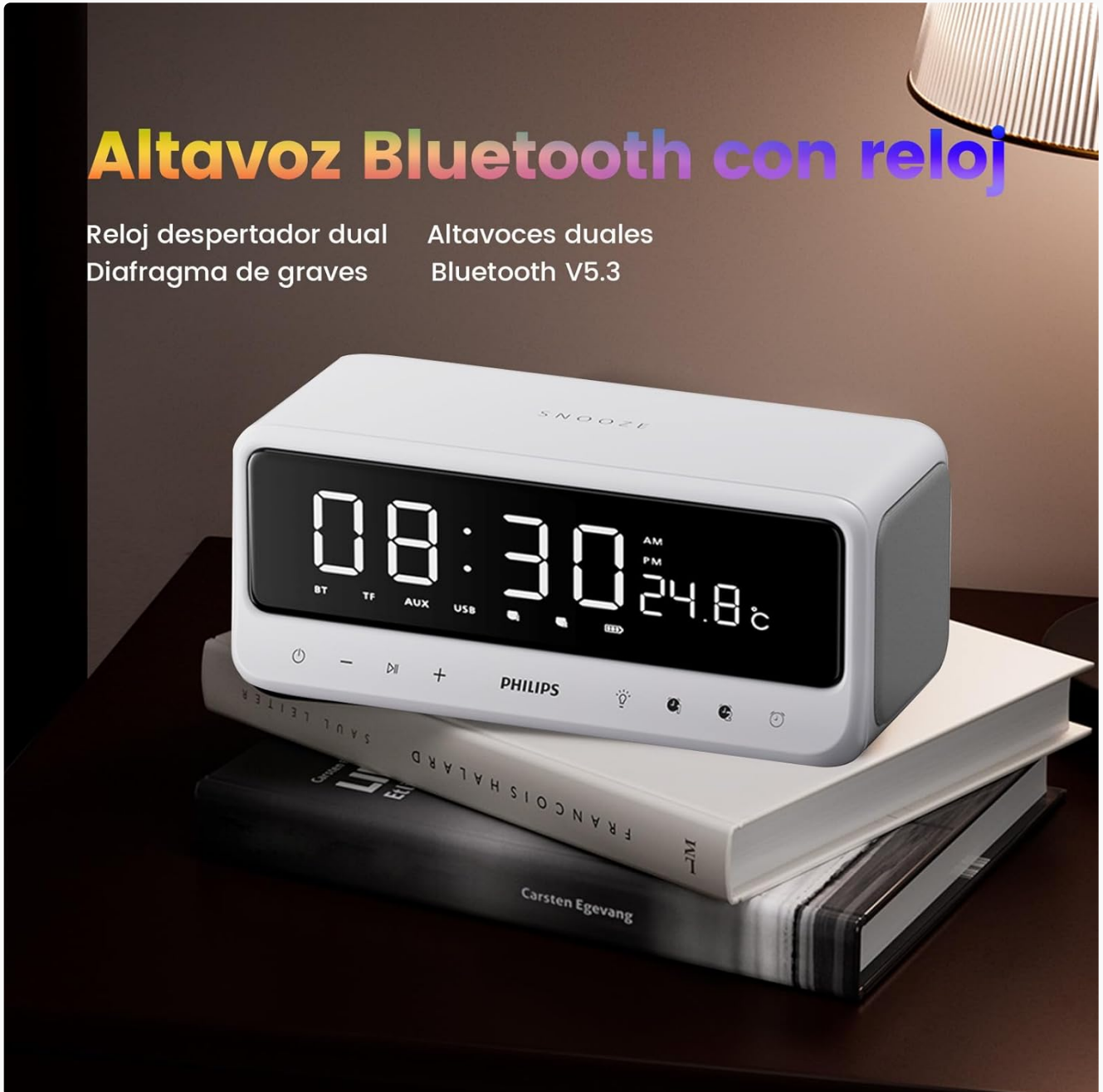
Figure 5: The device functions as both a Bluetooth speaker and a dual alarm clock, displaying time and temperature.