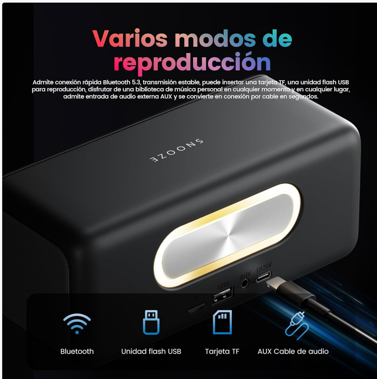
Figure 6: Multiple playback options including Bluetooth, USB, TF card, and AUX input.