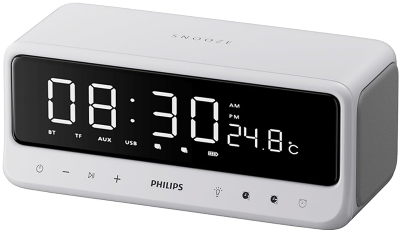
Figure 1: Front view of the device, displaying the time, temperature, and various control icons for Bluetooth, TF card, AUX, and USB modes.