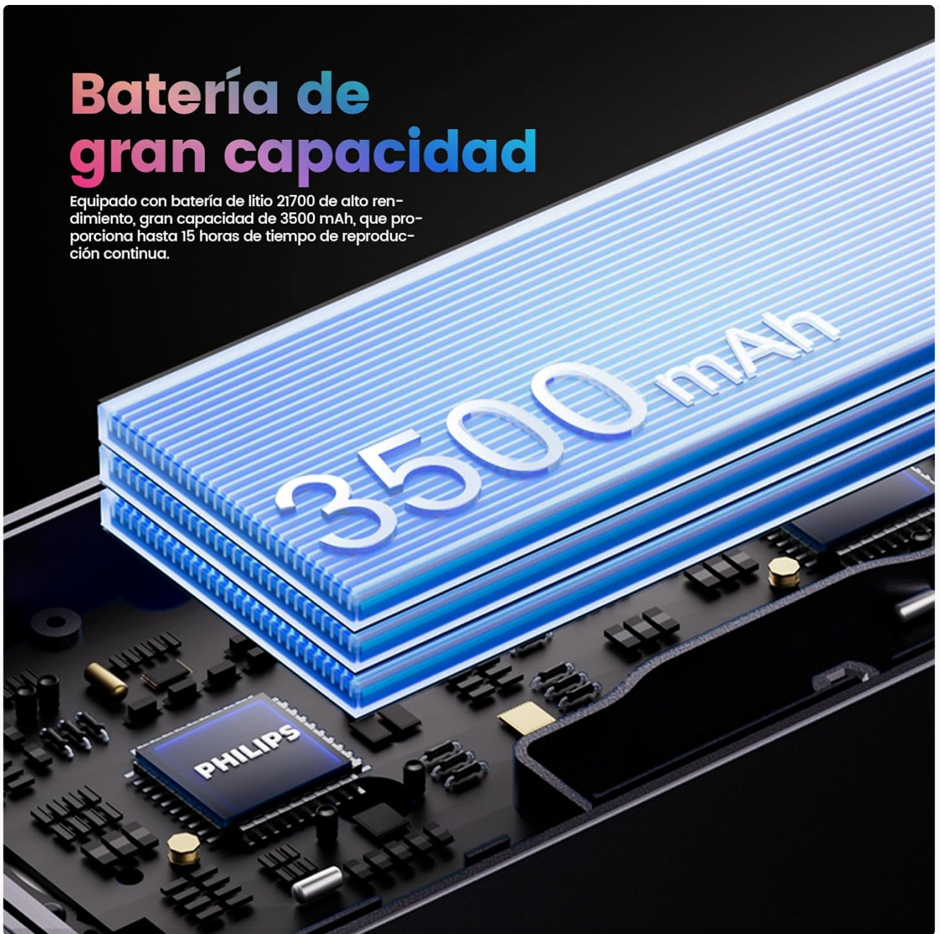
Figure 4: The device features a high-capacity 3500mAh battery for extended use.

Equipado con batería de litio 21700 de alto rendimiento, gran capacidad de 3500 mAh, que proporciona hasta 15 horas de tiempo de reproducción continua.