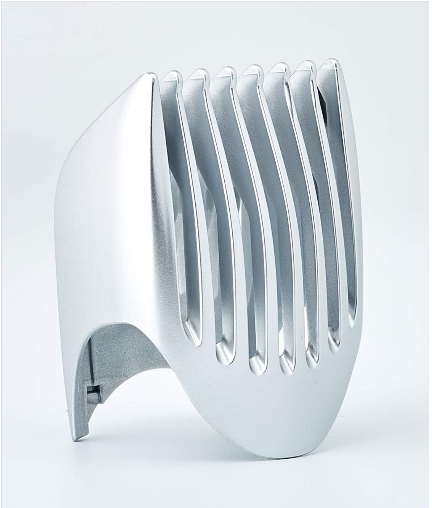
Image 1: Side view of the Panasonic WER221S7408 replacement comb, showing its general shape and teeth structure. This view helps in identifying the correct orientation for attachment.