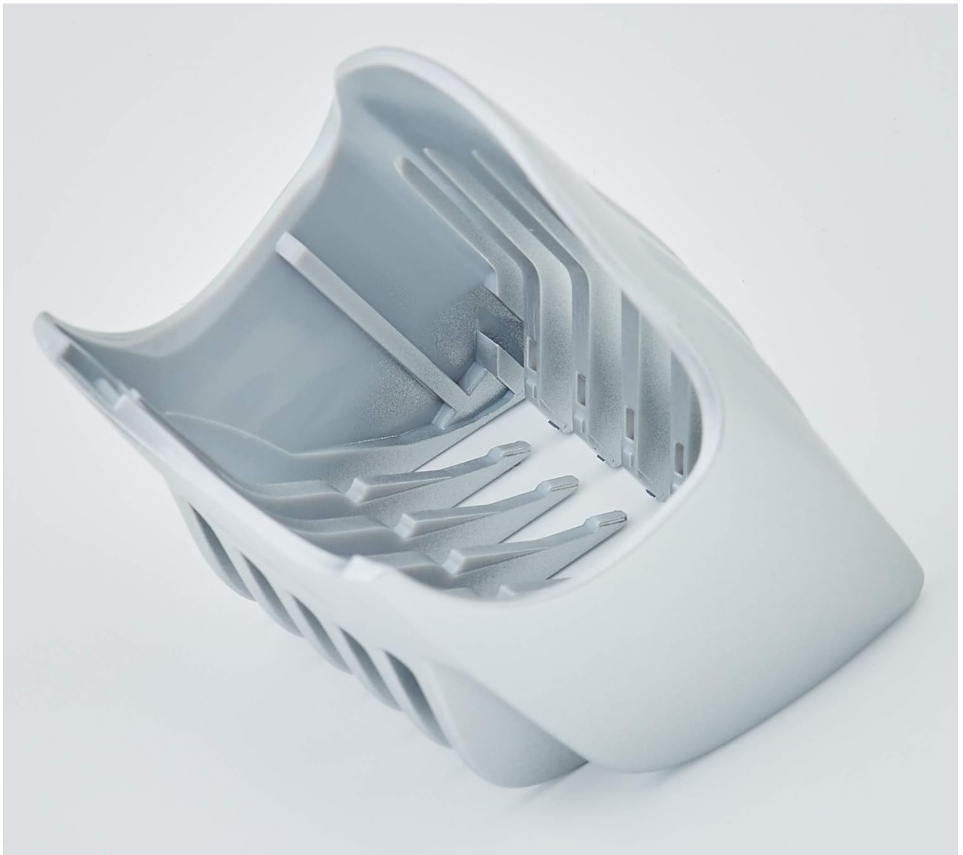
Image 2: Underside view of the Panasonic WER221S7408 replacement comb, illustrating the internal clips and guides that connect to the trimmer head. This helps in understanding how the comb locks into place.