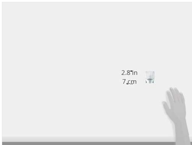
Image 4: Visual representation of the comb's dimensions, indicating a length of approximately 7 cm (2.8 inches).