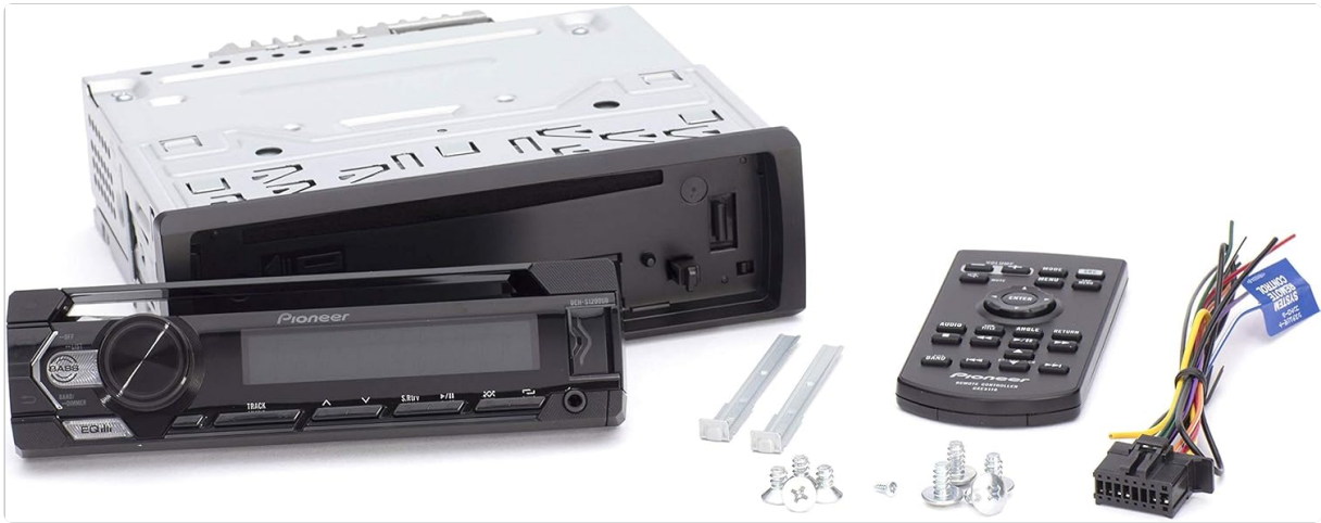
Figure 2: Included components of the DEH-1300MP package.