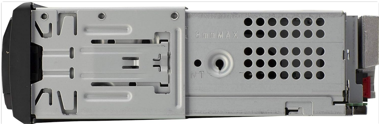
Figure 4: Side view illustrating the mounting points for secure installation.